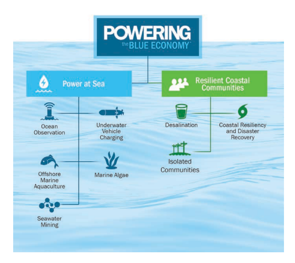
Figure 11.1. Marine power applications explored in this report

In terms of distance from shore, each marine energy market qualitatively spans different ranges of applicability from nearshore to the deep ocean, with implications for marine energy integration (Figure 11.2). The identified ranges are qualitative because the applicability of a market to different regions will continue to change as technologies and markets evolve. Distance from shore is an important consideration when discussing environmental conditions (e.g., water depth), access to shore-based resources (e.g., grid power access), and ease or mode of access to project sites (e.g., port and vessel availability).