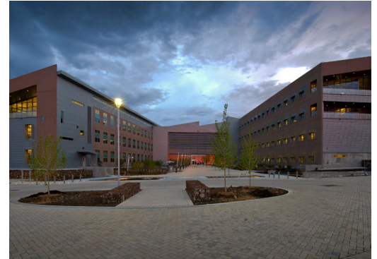
Commercial and Residential Buildings