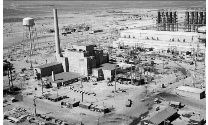
The Manhattan Project