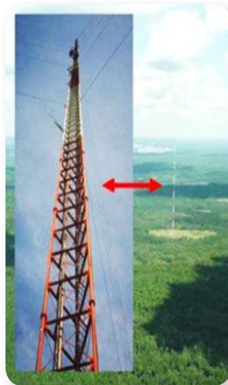
The Carbon Flux Measurement Super Site provides data representing regional to local spatial scales.