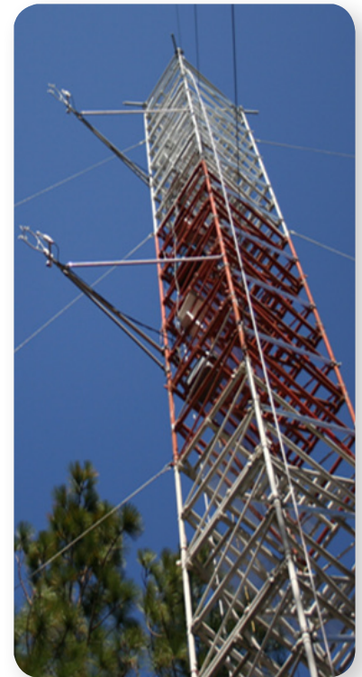
SRNL Forest Flux Tower