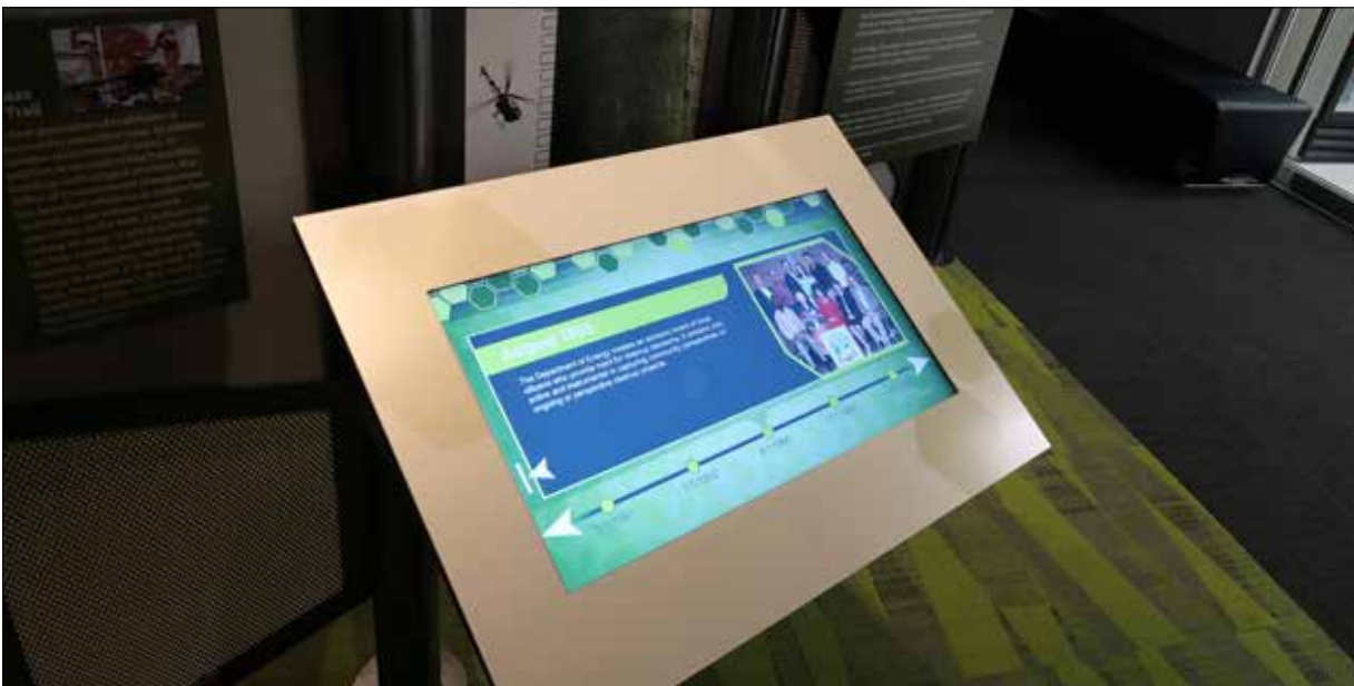
A permanent exhibit at the American Museum of Science and Energy in Oak Ridge details the history of ORSSAB and its members' role in OREM's cleanup mission.

These could be 3-D or otherwise and cover one or more site subjects, such as upcoming cleanup decisions soliciting public comment, site successes/challenges, transportation routes, and identifying websites for more info, etc. These should be updated frequently.