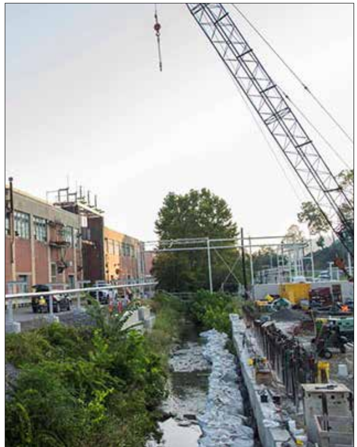
A view of the Outfall 200 area, where the headwaters originate for the Upper East Fork Poplar Creek.

ORSSAB supports OREM's Program Plan and recommends fully funding the activities that are currently supported for FY 2020. In addition, ORSSAB has identified three priorities for cleanup and recommends that the FY 2020 budget request reflect adequate funding to keep these projects going. Also, when additional funds from suitable