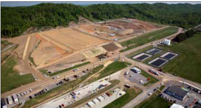
The current facility for low-level radioactive waste, the EMWMF, shown above, is currently 75 percent full.