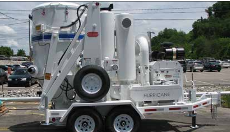
EM now has a powerful, trailer-mounted vacuum for cleaning and maintaining the important liquid and gaseous waste operations at Oak Ridge National Laboratory.

The equipment has already enhanced safety and operational efficiency. Without the vacuum, personnel would be required to fully dress in personal protective equipment and remove the sludge and debris with shovels and buckets. In addition to being closer to contaminated materials in confined spaces, workers would face an increased chance of slips and falls while climbing in and out of slippery areas in the protective suits.