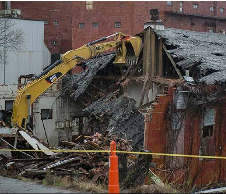
Crews take down Building 9743-2 at Y-12 National Security Complex.

As of December 2016, Oak Ridge contained 60 of DOE's inventory of 203 higher-risk excess facilities.