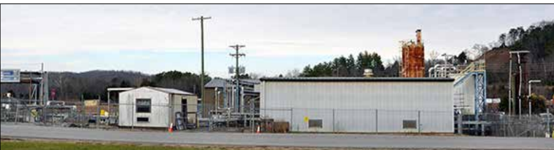
The Central Neutralization Facility is shown before demolition began in January 2018 (top) and after demolition was completed in May.

All operations at the facility ceased in 2013, and a new wastewater treatment facility, the Chromium Waste Treatment System, began operating in its place.