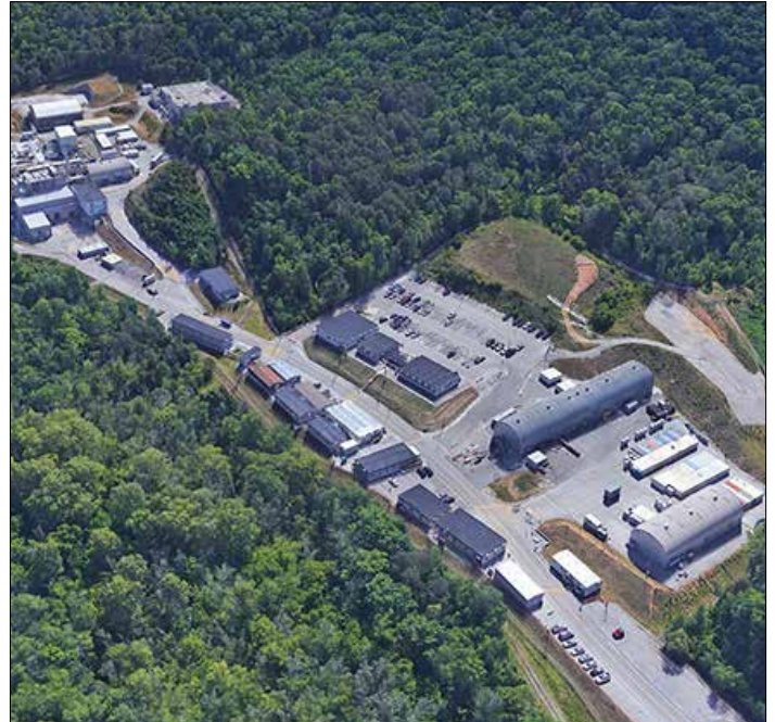
An aerial view of the Transuranic Waste Processing Center in Oak Ridge, where the final drums of legacy transuranic waste stored at Oak Ridge National Laboratory will be processed before shipment to the Waste Isolation Pilot Plant for permanent disposal.

After crews process the drums at the Transuranic Waste Processing Center (TWPC), they will eventually be transported to WIPP near Carlsbad, N.M., for final disposal.