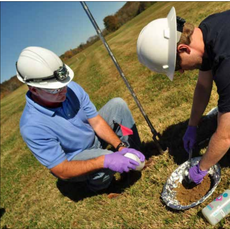
Workers sample soil on the Oak Ridge Reservation.

DOE OREM awarded Strata-G LLC a contract to perform environmental sampling in support of efforts to construct additional onsite disposal capacity on the Oak Ridge Reservation (ORR).