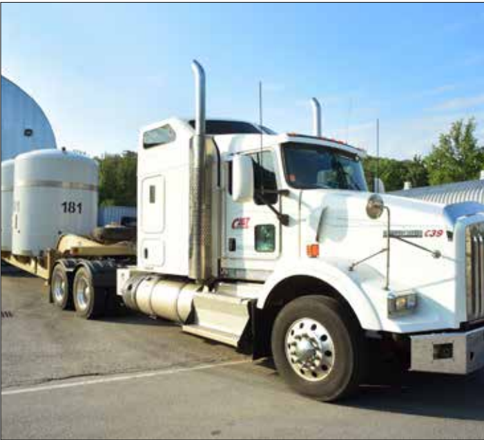
The ECA Report sets forth policy changes to advance desirable and widely-accepted goals of cleaning up nuclear wastes nationally.

In 2017 the Energy Communities Alliance (ECA) sponsored the wide-ranging report “Waste Management: A New Approach to DOE’s Waste Management Must be Pursued” (available at www.energyca.org/publications ) These recommendations would, if implemented, bring about major changes in long-standing national policies regulating the categorization, treatment, and disposition of DOE legacy radioactive waste.