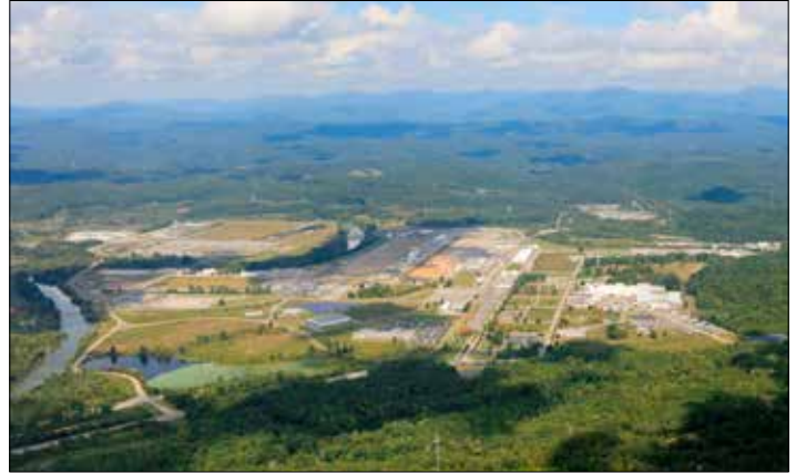
Vision 2016, Vision 2020 is DOE's long-term cleanup goal for ETTP. This aerial photo from 2018 shows major progress at the site.

A significant amount of soil removal is ongoing and the work that remains to be done at ETTP is to tear down a number of buildings, including the centrifuge test facilities.