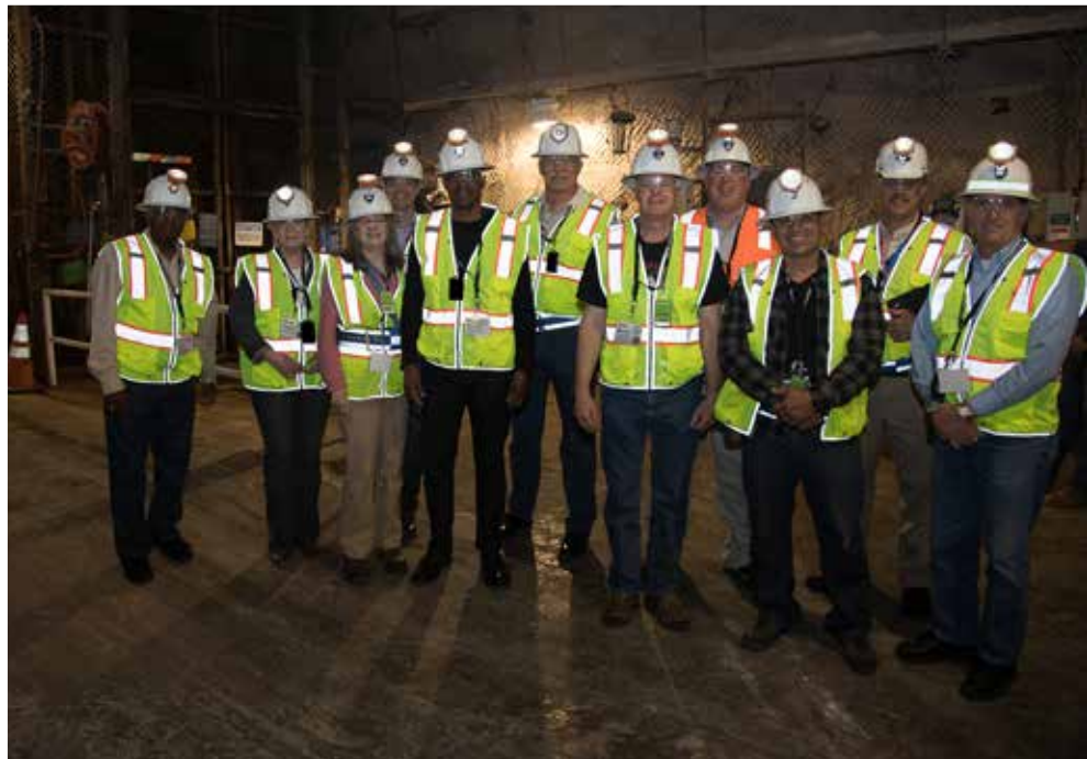
ORSSAB members toured DOE's Waste Isolation Pilot Plant (WIPP) in Carlsbad, N.M. in conjunction with the SSAB Spring Chairs' Meeting held in May in Roswell, N.M.

Each board regularly hosts events designed to let the boards collaborate on recommendations, share best practices, hear updates from DOE headquarters officials and understand the unique challenges faced by the other sites.