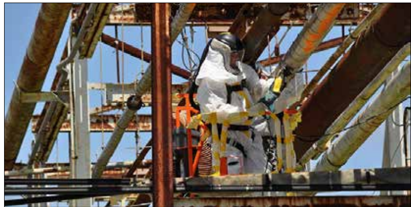
Crews deactivate the Central Neutralization Facility by disabling utilities and cutting tie lines.

Workers deactivated the facility by disabling utilities and cutting tie lines, which are the pipes that transported enriched uranium between the site’s facilities. During previous closure activities, crews removed materials containing radiological, metal, and organic contamination. Workers thoroughly rinsed and sampled remaining process tanks, pipes, and equipment.