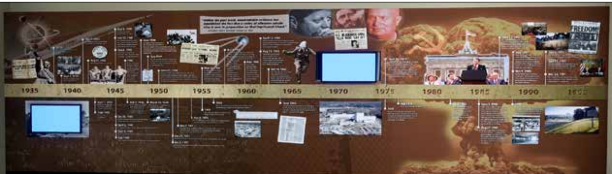
Historic preservation activities at the former K-25 site were among the OREM budget priorities discussed for FY 2020.