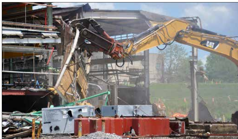
Crews began tearing down Building K-633 in May and completed the project in June.

Building K-633 was the fourth building Oak Ridge's EM program has removed from ETTP's Poplar Creek area since last year. Prior to those teardowns, this area contained