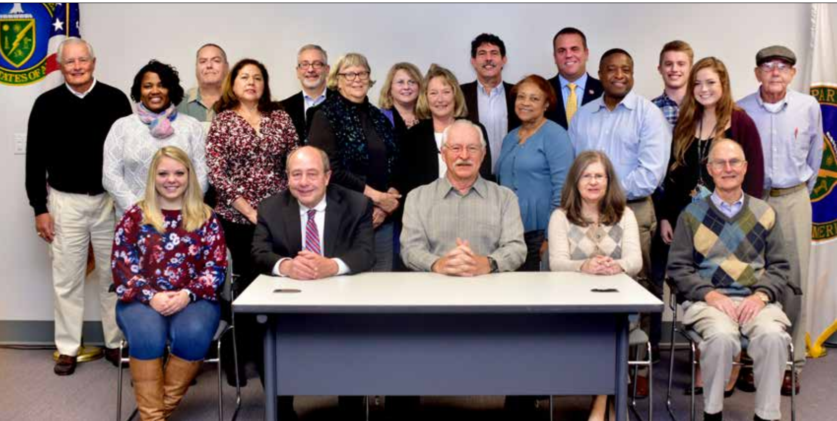
The FY2018 Oak Ridge Site Specific Advisory Board

Committees usually meet monthly, and all meetings are open to the public.