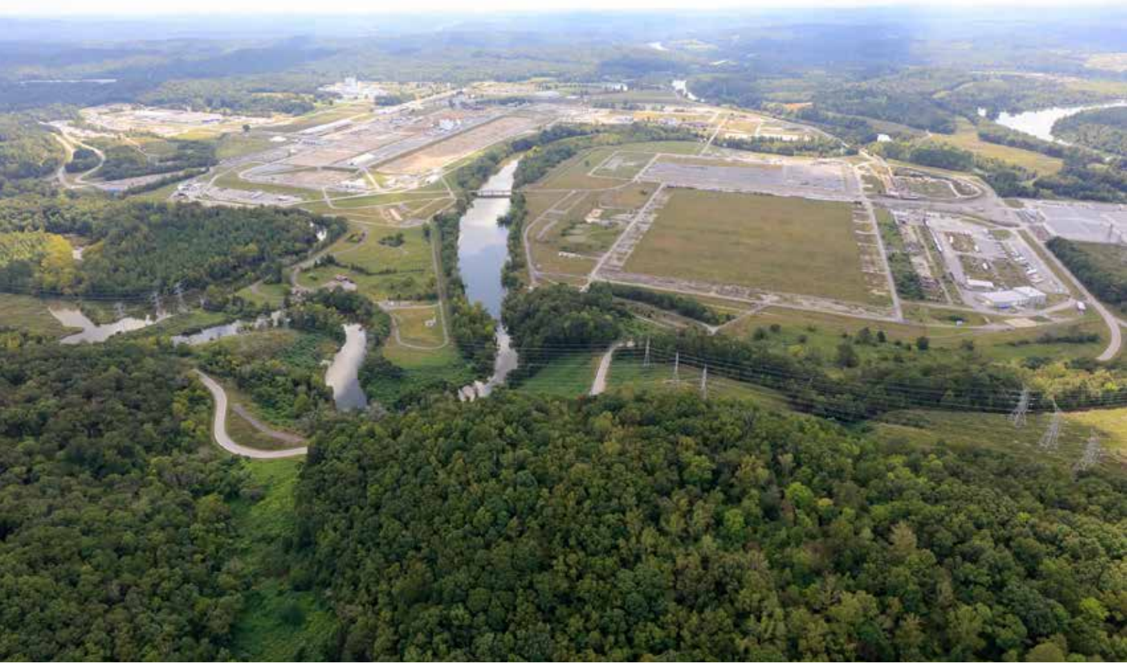
Updated aerial photos of East Tennessee Technology Park show progress made to remove unneeded facilities from the site and further the goal of turning most of the site into an industrial park.