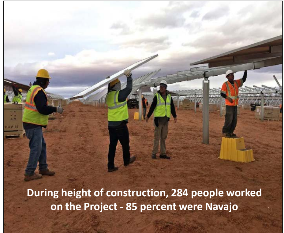
During height of construction, 284 people worked on the Project - 85 percent were Navajo