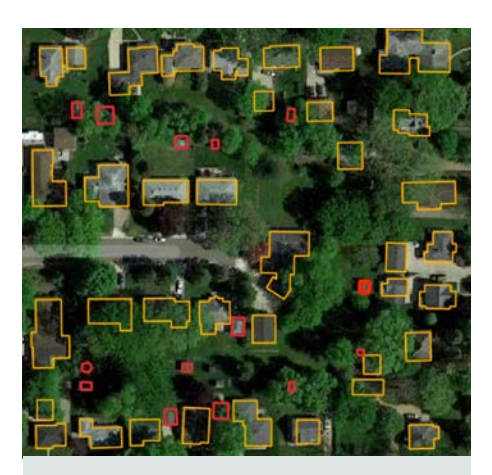
Figure 1. Example of GIS buildings data for Hutchinson, Minnesota

To estimate rooftop solar energy generation technical potential for all buildings in Hutchinson, NREL started with geographic information system (GIS) data provided by the city, which included the building footprint area and zoning district for every building in the city (see Figure 1). Google Project Sunroof's Data Explorer provides rooftop PV generation potential in many, but not all, U.S. cities (google.com/get/sunroof/data-explorer/).