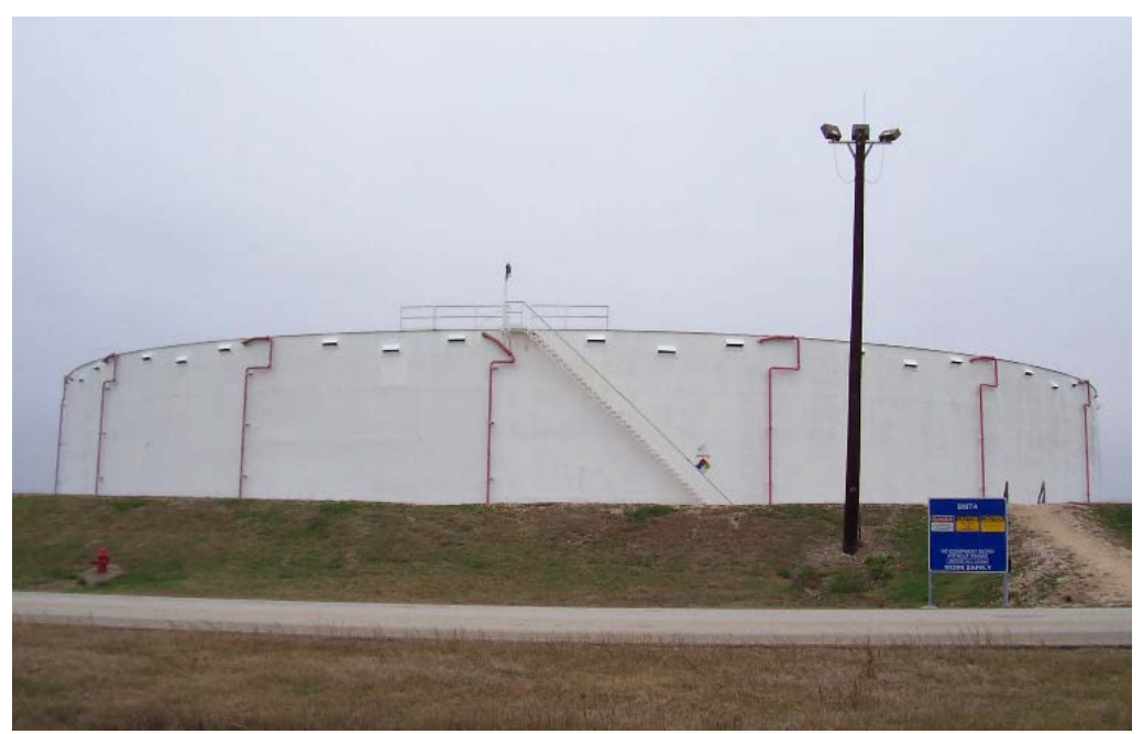
Bryan Mound Tank BMT-4

Above is a photograph of the Bryan Mound Tank BMT-4 exterior where one of the floating roof failures occurred.