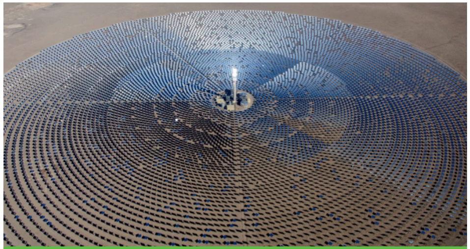
The Crescent Dunes concentrating solar power plant in Nevada uses molten salt technology to store heat and generate electricity and can provide power to 75,000 homes during peak operations.

The U.S. Department of Energy Solar Energy Technologies Office (SETO) supports early-stage research and development to improve the affordability, reliability, and performance of solar technologies on the grid. The office invests in innovative research efforts that securely integrate more solar energy into the grid, enhance the use and storage of solar energy, and lower solar electricity costs.