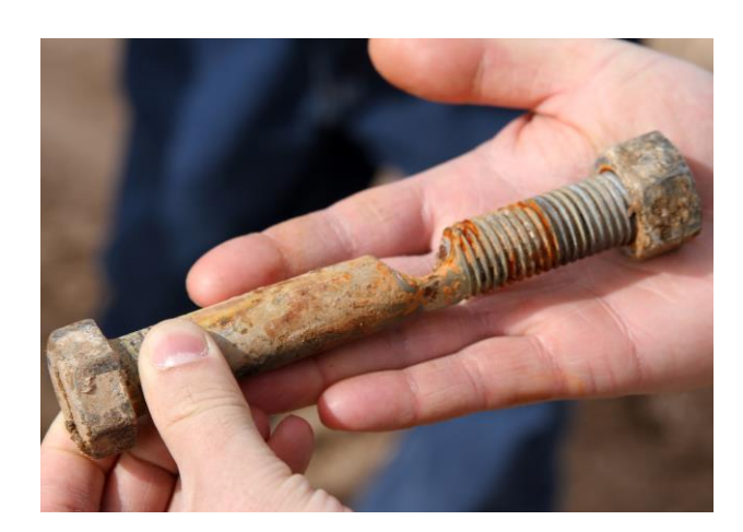
Bolt cut from the water leak between the flange faces

The initial failure of the gasket caused a low flow, high-pressure leak that was not detected for some time. With the system pressure operating at approximately 150 pounds per square inch (psi), the orifice created by the failure of the gasket(s) between the two flanged faces created a water jet, which eroded the metal valve flange and bolts.