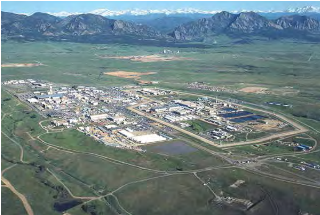
Colorado's Rocky Flats Site in June 1995 (left) before cleanup and in June 2014 (facing page). DOE completed cleanup at the site in 2005.