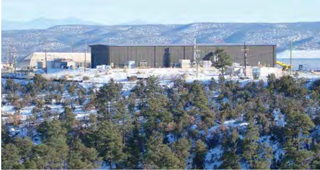
A view from Pueblo de San Ildefonso land of Technical Area 54 used for onsite disposal and radioactive and chemical waste management at Los Alamos National Laboratory.