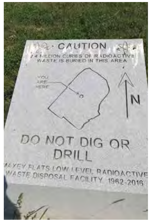
KENTUCKY DIVISION OF WASTE MANAGEMENT

Maxey Flats, left, contains disposal trenches with a final landfill cap, above, and requires a long-term IC plan for at least 100 years.