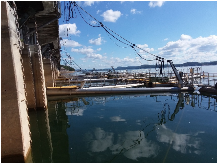
Surface Mixers, Cherokee Dam