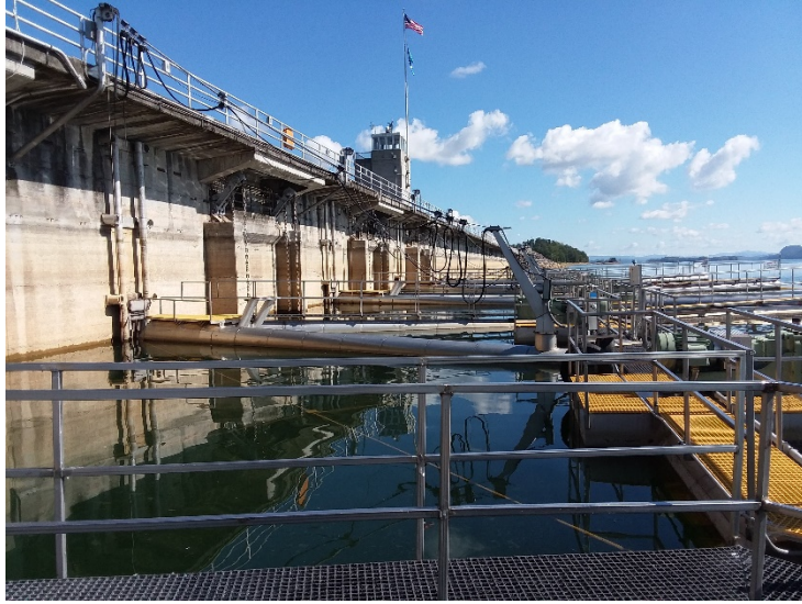
Surface Mixers- Showing Connection to Cherokee Dam