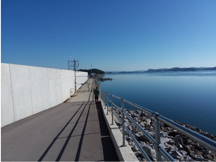
Surface Mixers, Cherokee Dam