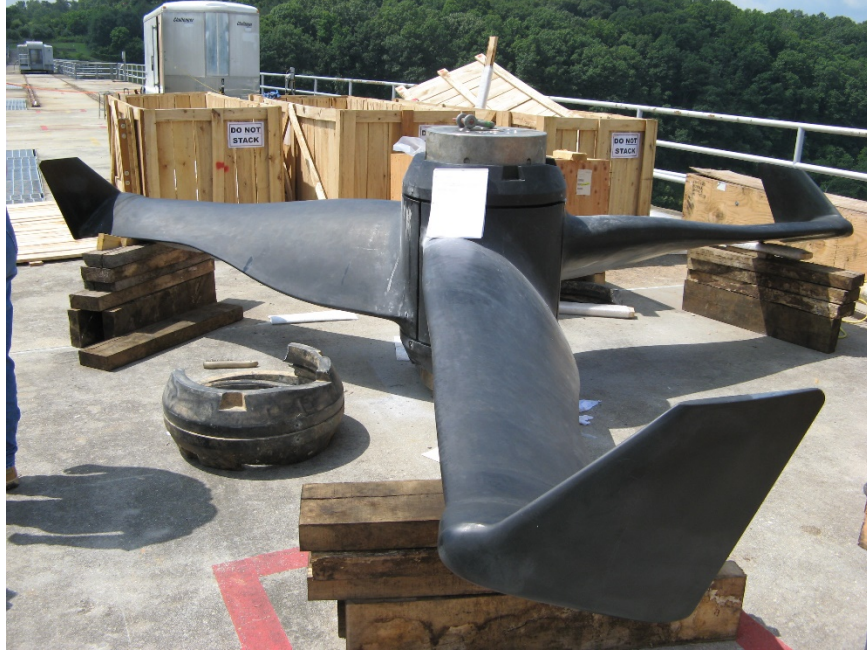
Impellor from Douglas Dam Surface Mixer