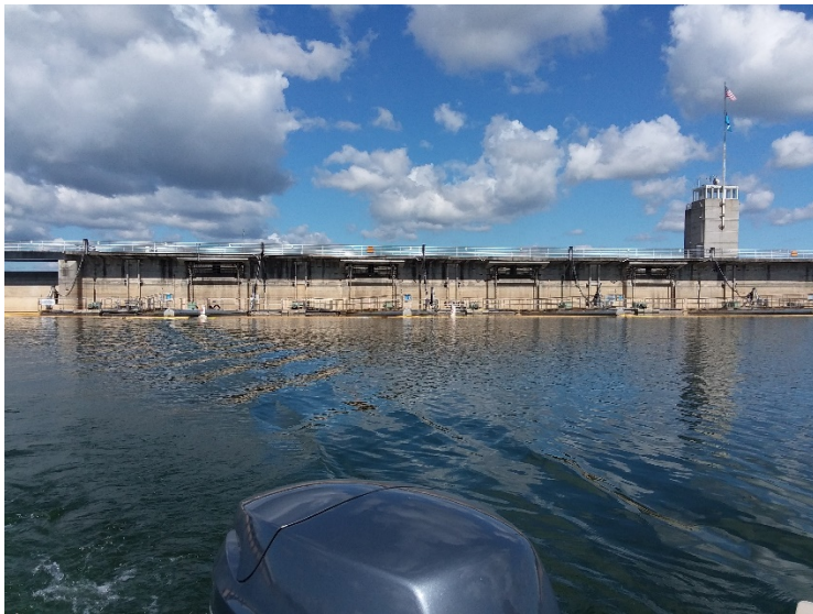
Surface Mixers (Pumps), Cherokee Dam