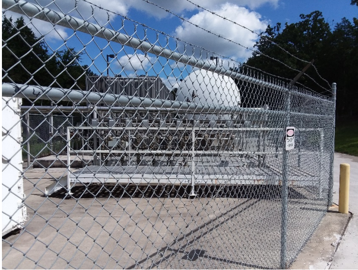
Feeder Valve System, Cherokee Dam