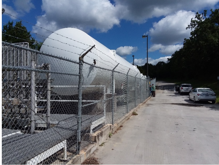
Liquid Oxygen Storage Tanks, Cherokee Dam