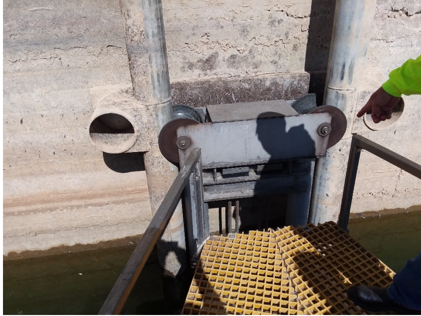
Surface Mixers Connection Equipment Close-Up, Cherokee Dam