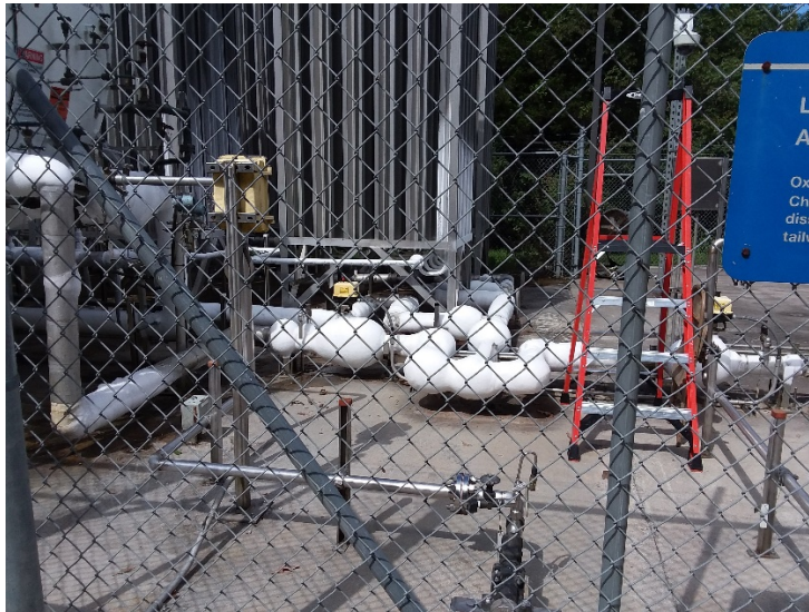
Evaporators Which Convert Liquid O2 to Gaseous Phase, Cherokee Dam