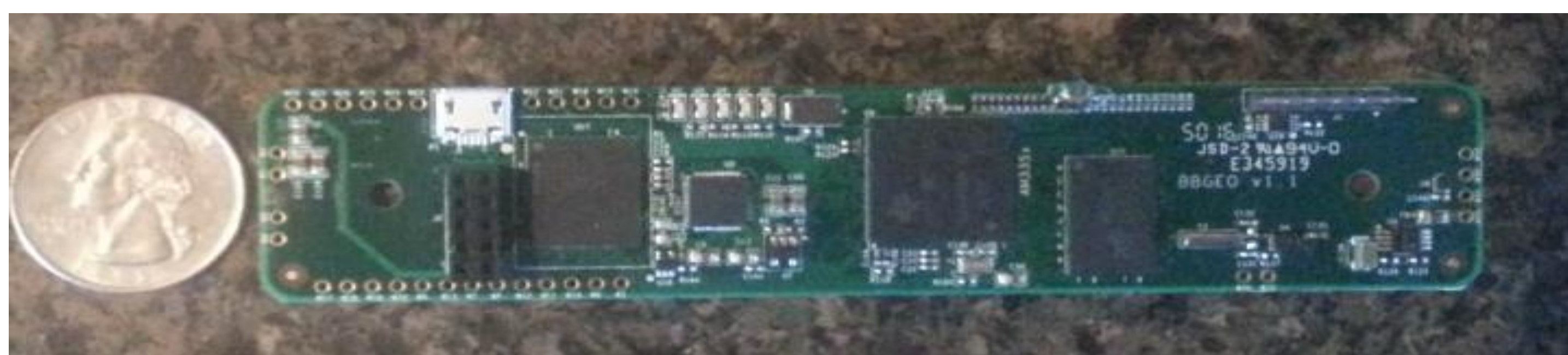
The Beagle Bone Geo, a 32bit, 1GHz Geothermal Data Collection System developed for this project.

Thermal modeling predicts we can keep the camera cool!