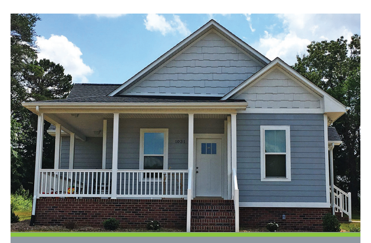
The U.S. Department of Energy's Building America Solution Center conveys the research that turns today's homes into high-performance Zero-Energy Ready homes.

The Sales Tool can also be used to produce a customized full reference document for your sales team with non-jargon descriptions of your building-science measures, the compelling benefits they provide, and sales messages for conversations with consumers.