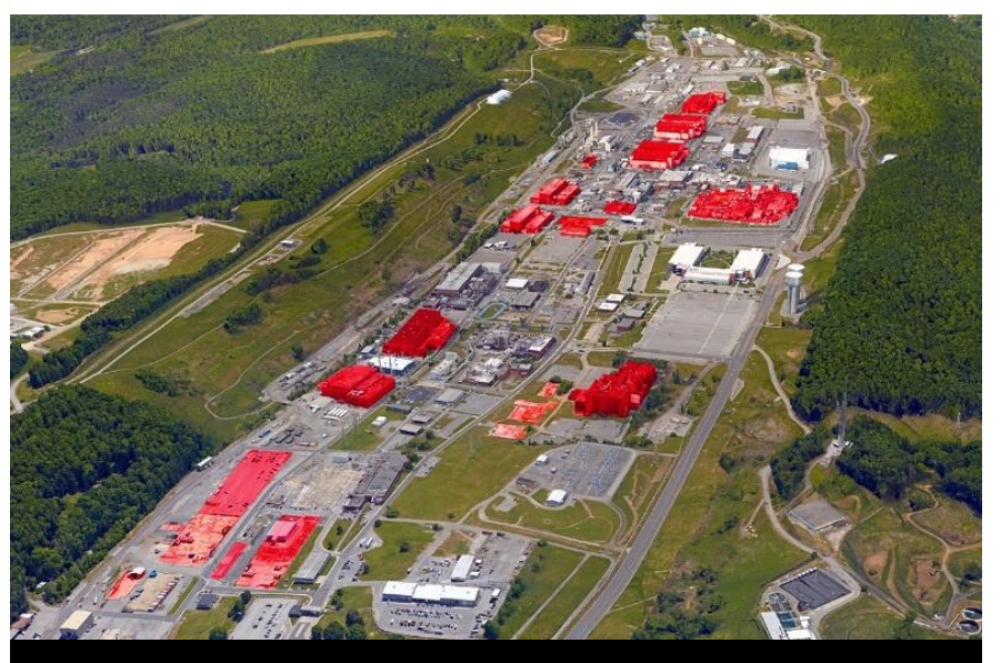
Excess Facilities at Y-12