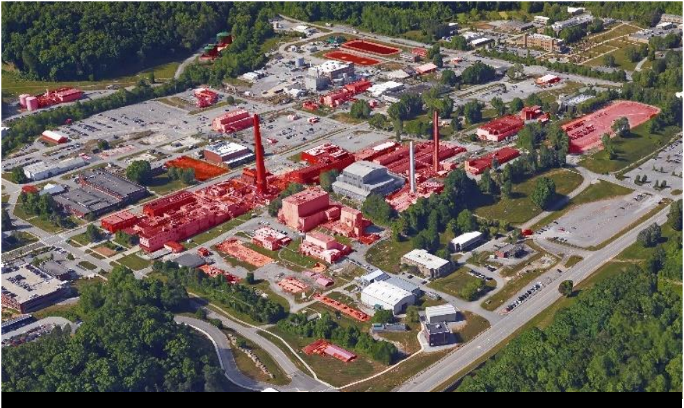
Excess Facilities at ORNL