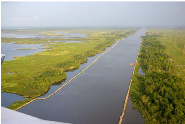
The Office of Fossil Energy prepared an EA to evaluate the potential environmental impacts of proposed access improvements to four remote valve stations of the SPR pipeline that are only accessible from the Gulf Intracoastal Waterway.

The Remote Valve Station Access EA evaluated proposed actions to improve access to the valve stations by constructing elevated, galvanized steel boat landings and walkways connecting to walking paths that would be cleared of overgrown vegetation and resurfaced with gravel. The goals of the project were to improve safety for personnel and property, reduce costs and increase the efficiency of maintenance operations at the valve stations, and ensure future access to the valve stations.