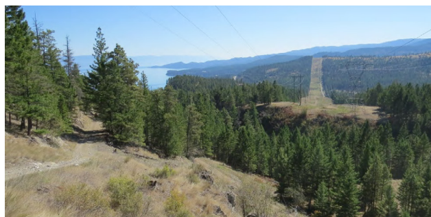
The EA cover photo depicts the transmission line corridor.

BPA owns and operates more than 15,000 circuit miles of high-voltage transmission lines in its service territory (Idaho, Oregon, Washington, western Montana and small parts of eastern Montana, California, Nevada, Utah, and Wyoming). The transmission lines move most of the Northwest's