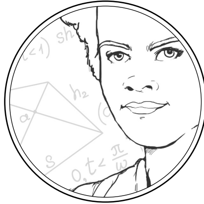
EVELYN BOYD GRANVILLE

Her idea is now the basis for the tech behind mobile phones, fax machines, and other wireless communications.