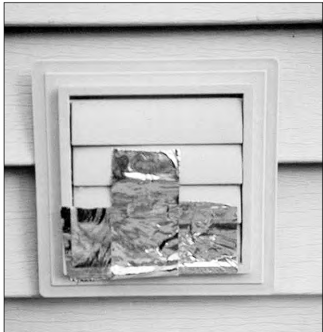
By taping shut first, two, and then, three louvers on the vent hood, I raised static pressures in the venting system.

number of watt-hours used per cycle is largely a function of the amount of time the fan is on and drum is turning, I used watt-hours per load as a way of measuring drying time without having to babysit every test. I did babysit a couple of tests to make sure that the electric use during the cool-down portion of the cycle didn't vary.