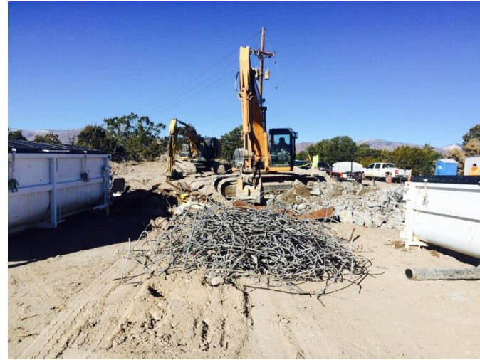
Debris from the demolition of the Sewage Treatment Facility