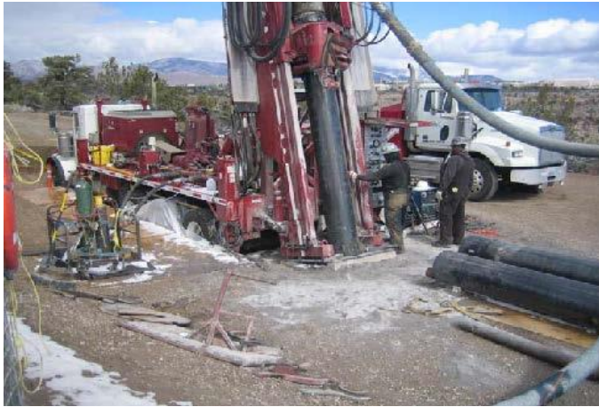
Angled drilling at CrIN-4