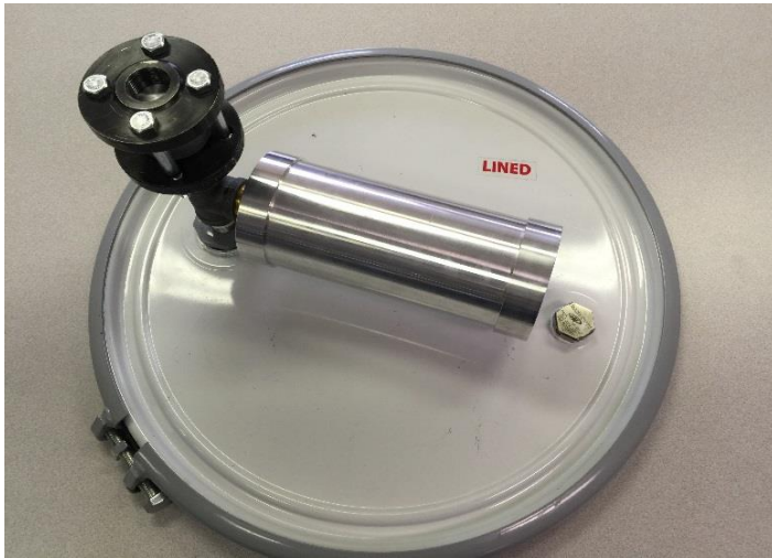
Pressure Relief Device with Supplemental Vent