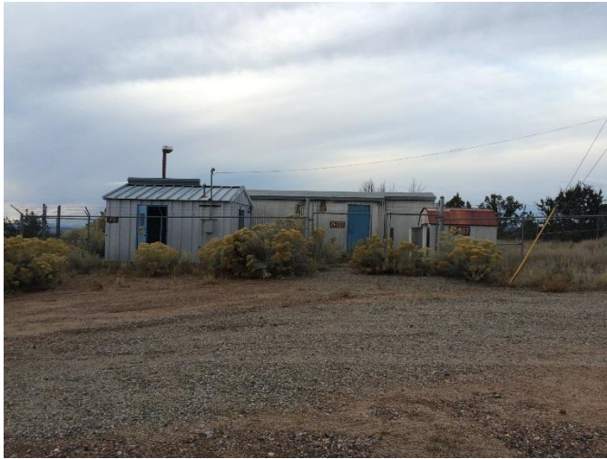
Sewage Treatment Facility prior to demolition