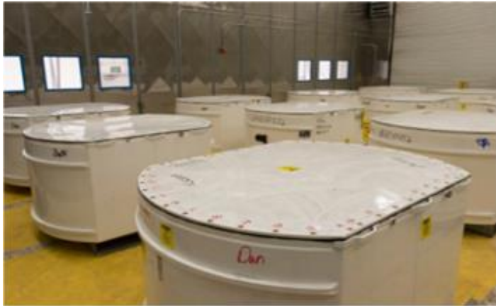
Standard Waste Boxes in the Permacon