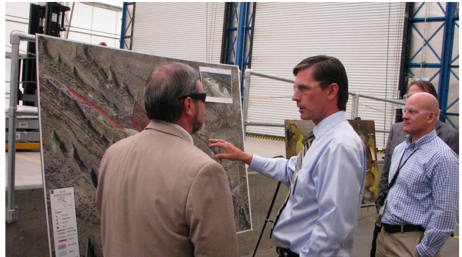
Senator Heinrich on his May 5, 2016 visit to Area G