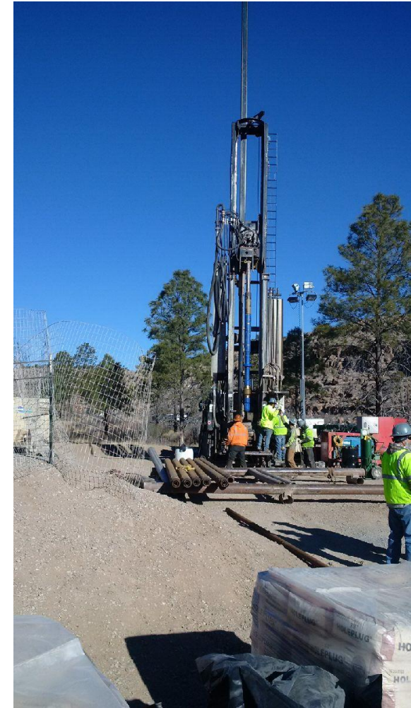
CrEX3 Extraction Well