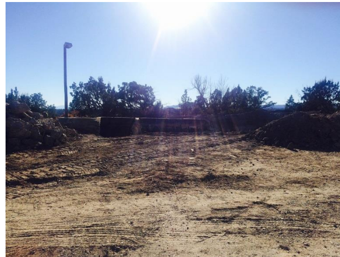
Site of the former Sewage Treatment Facility