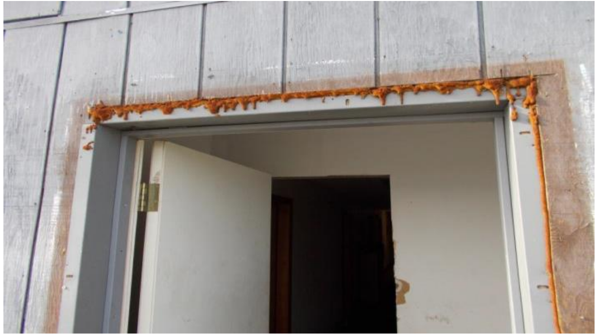
Figure 2. This was one of the older doors on the lodge, insulated around the frame but still with numerous air leaks around the entire frame and UV rays are reducing the effectiveness of the insulation

An array of options for the community were discussed including renewable energy, energy efficiency, community infrastructure needs and the high cost of heating and electrifying the Lakeview Lodge. After collecting information on all of the community's options over the next few months, the tribal council selected the 10,000 sq ft Lakeview Lodge as their main focus for the project funds. The Lodge is home to the main tribal offices, elders nutrition program, IGAP program, school lunch program, tribal operations, tribal transportation and the Indian Child Welfare Act (ICWA) program. It was agreed IRHA would put together a proposal for the project, the DOE would contribute $250k for weatherization and energy efficiency and the tribe would match the DOE share with $113,158 from a state of Alaska Capital Improvement Project (CIP) and donated in-kind staff time. The final product would be a complete weatherization of the lodge and hopefully a 30-50% reduction in energy costs.