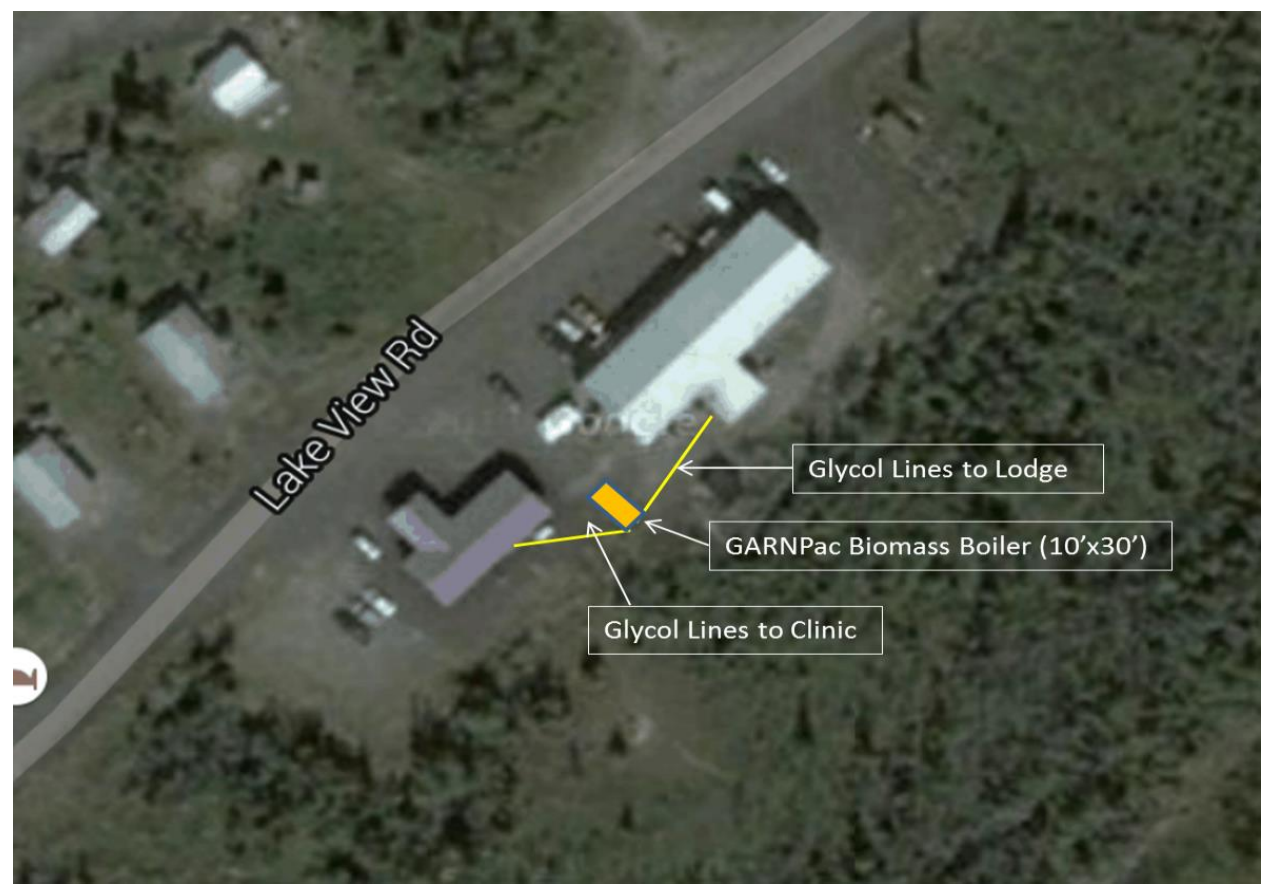
Figure 5. Aerial view of the Minto Lakeview Lodge (Right) and Minto Clinic (Left) and the approximate location of the biomass boiler slated for construction summer 2016 which will heat both buildings with locally sourced cord wood

An additional result of this project was that the tribe also applied for and was granted funding to complete the construction of a small biomass boiler that is being designed to heat the Lakeview Lodge and adjacent Minto Village Clinic. The grant funds came from the state of Alaska Renewable Energy Fund in the amount of $273k and they are working with the Alaska Native Tribal Health Consortium (ANTHC) to determine the best project management approach to complete the construction of the biomass system that will service both buildings.