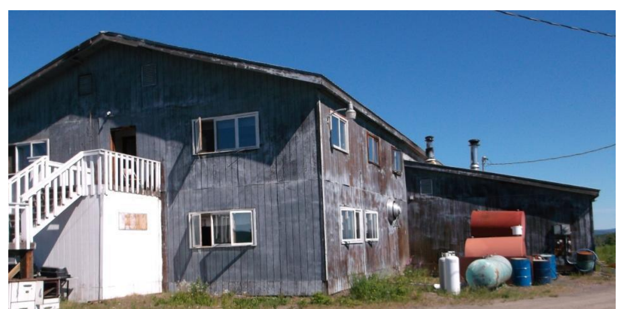
Figure 1 Old View of the Minto Lakeview Lodge from the same aspect as Figure 1 before Renovation. Note the stains on the building from 30+ years of frost buildup as the heat from inside the building met the extreme cold temperatures on the outside

During the early summer of 2013, energy specialists from the Alaska Energy Authority, the Dept of Energy Tribal Energy Program, The Denali Commission, Alaska Energy Authority (AEA), Alaska Housing Finance Corporation (AHFC), National Renewable Energy Laboratory (NREL), Interior Regional Housing Authority (IRHA) and Tanana Chiefs Conference (TCC) came to Minto and hosted a community meeting to identify and prioritize the community's energy needs.