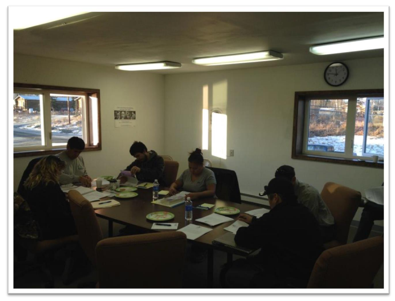
Figure 4. Minto Village Council members in the newly renovated Minto Lakeview Lodge under LED lighting and with new triple paned windows throughout the building

As part of the START program, conversations and outreach were completed with village residents and individuals were provided with energy efficiency education and LED lighting for some homes. This has helped encourage the continuation of energy efficiency conversation in the small, close-knit community.