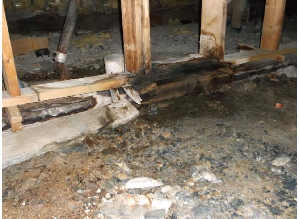
Figure 3. Mold and rot visible throughout the building's crawl space from various leaks and moisture issues. The building's knee walls were failing in some points when work was started but the knee walls would be shored up and repaired over the course of the project

State of AK funding through the START grant has leveraged an additional $200k Village Energy Efficiency Program (VEEP) grant and a $273k Renewable Energy Fund (REF) biomass project grant that the community is now working to complete.