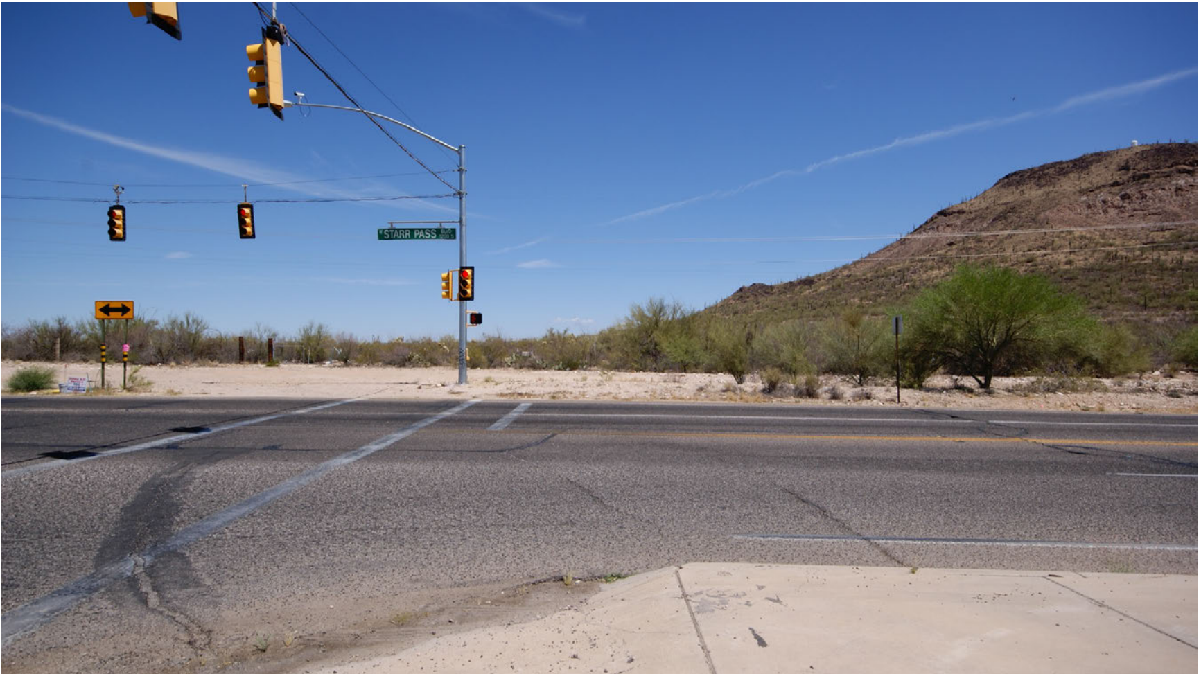
KOP TH1-S2. Existing view along West Starr Pass Boulevard toward representative ROW for local alternative TH1a, which would be visible with Tumamoc Hill in the background.