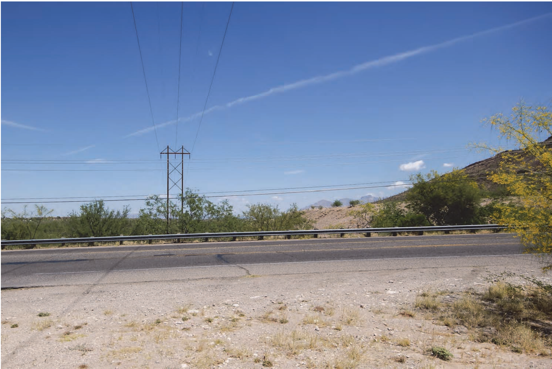
A. KOP TH1-S1. Existing view facing north toward the representative ROW (Segment U3e) from West Starr Pass Boulevard between South Coati Drive and South Bison Drive.