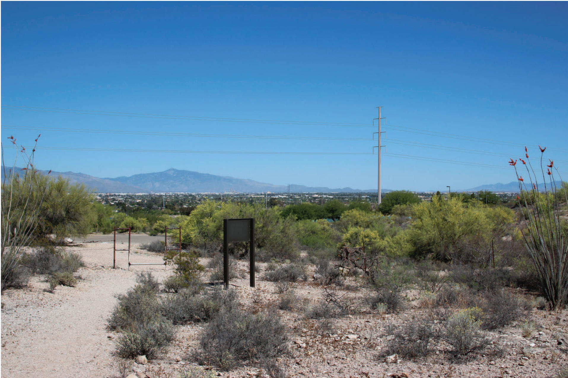
B. KOP U3-11. Simulated view toward the representative ROW from Explorers Trail within Tucson Mountain Park, Pima County.