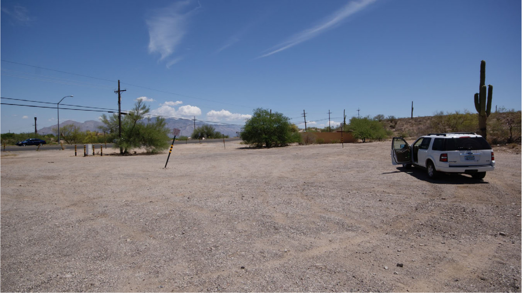
KOP TH1-S7. Existing view toward the representative ROW from Greasewood Road and Speedway Boulevard.