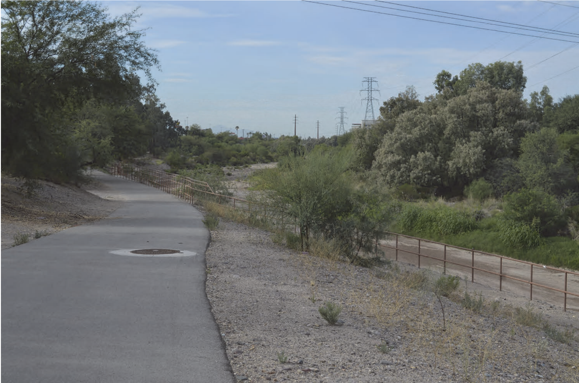
A. KOP NPS-02 . Existing view toward the representative ROW (Segment TH3b) from the bike trail just east of the river bed and west of Interstate 10.