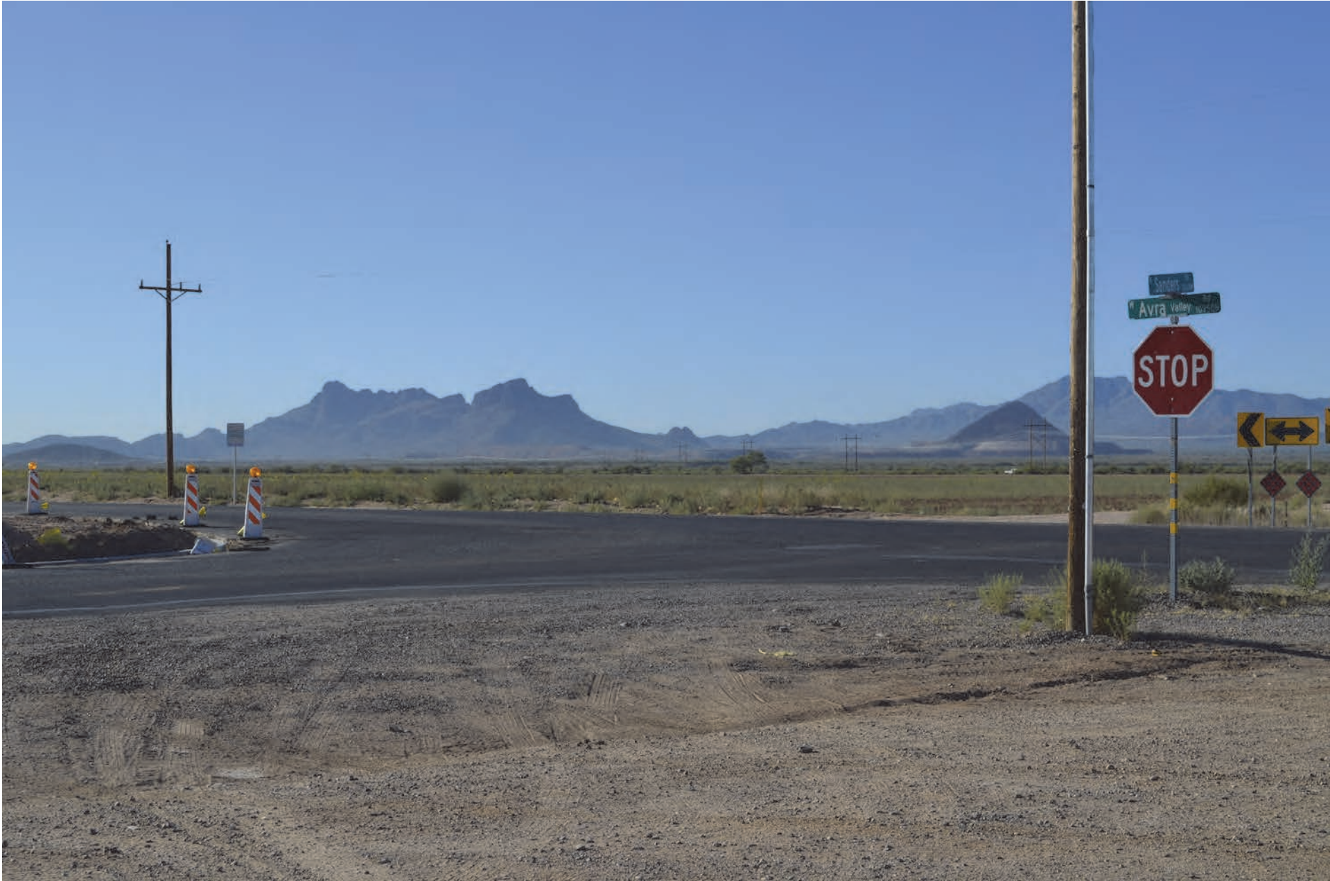
A. KOP MA-02. Existing view toward the representative ROW (Segment U3) from the intersection of Sanders Road and West Avra Valley Road.