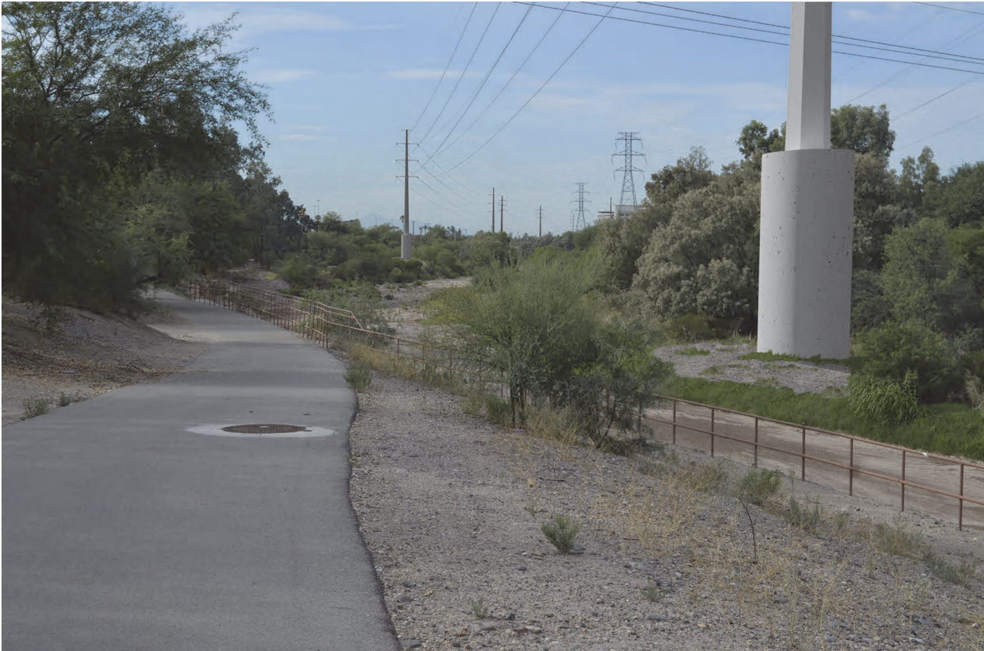
B. KOP NPS-02 . Simulated view toward the representative ROW from (Segment TH3b) the bike trail just east of the river bed and west of Interstate 10.