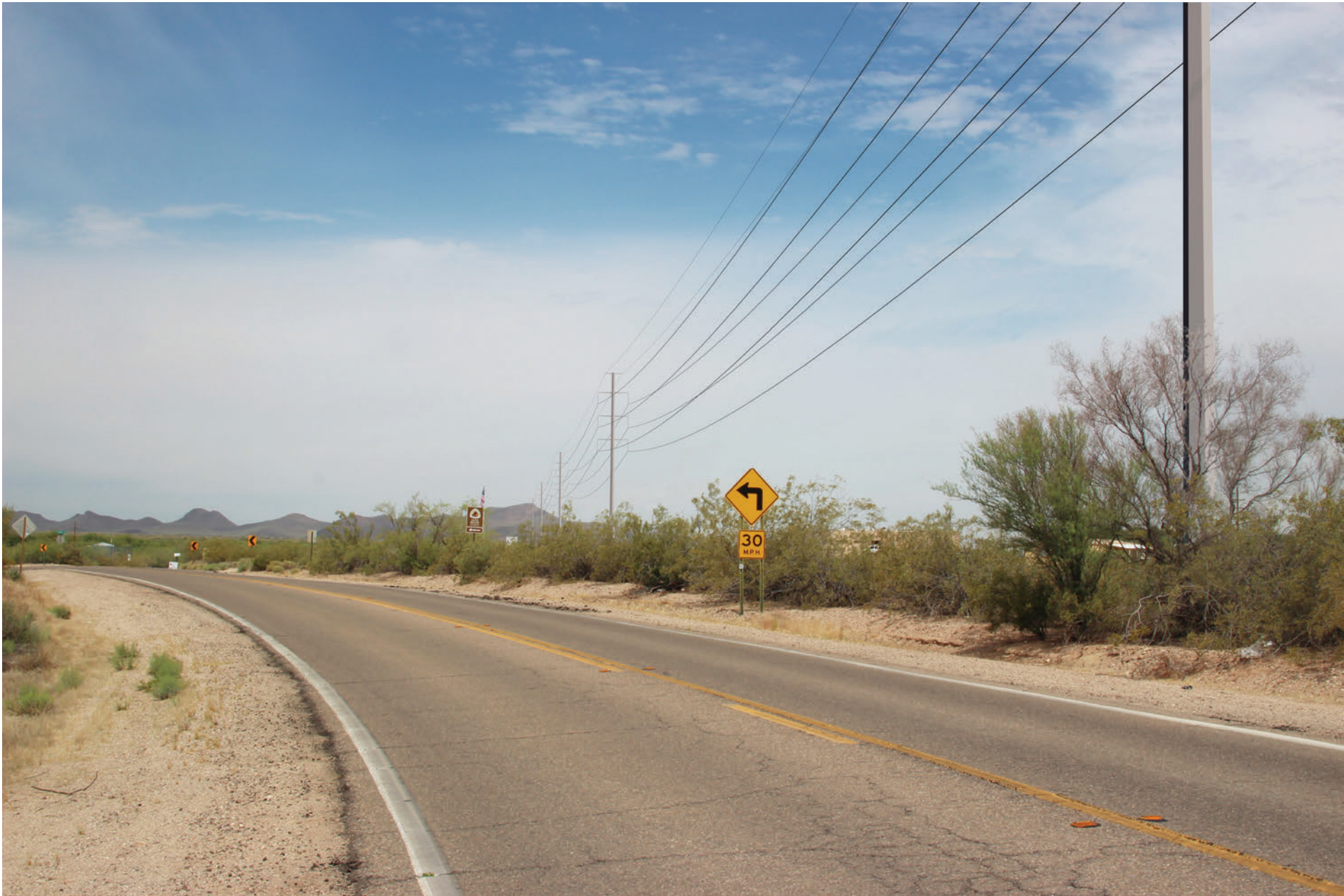
B. KOP U3-23. Simulated view toward the representative ROW from a rural residential area along Silverbell Road historic auto route.