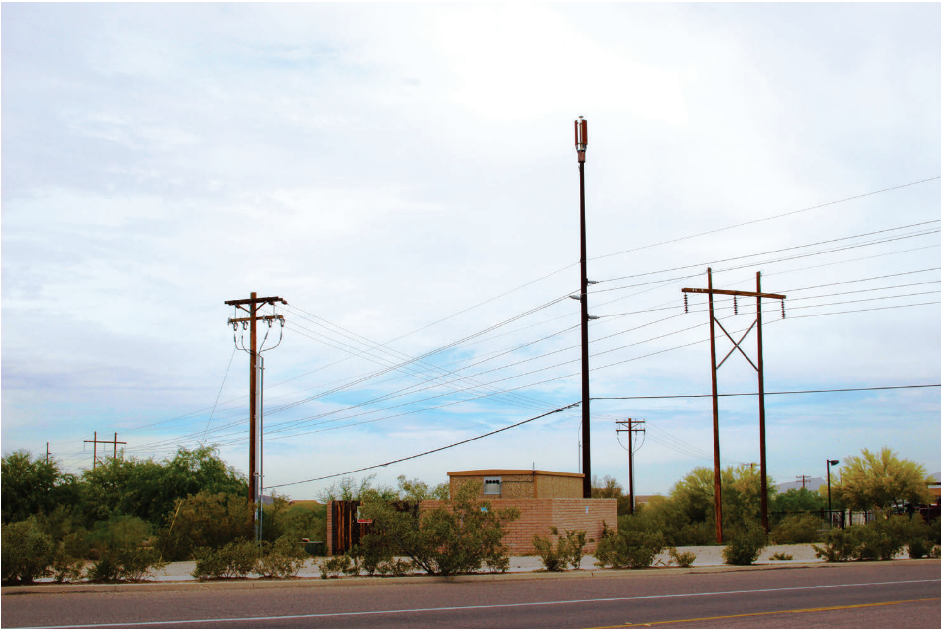
KOP U3-20. Existing view toward the representative ROW from a residential area near the community of Marana.