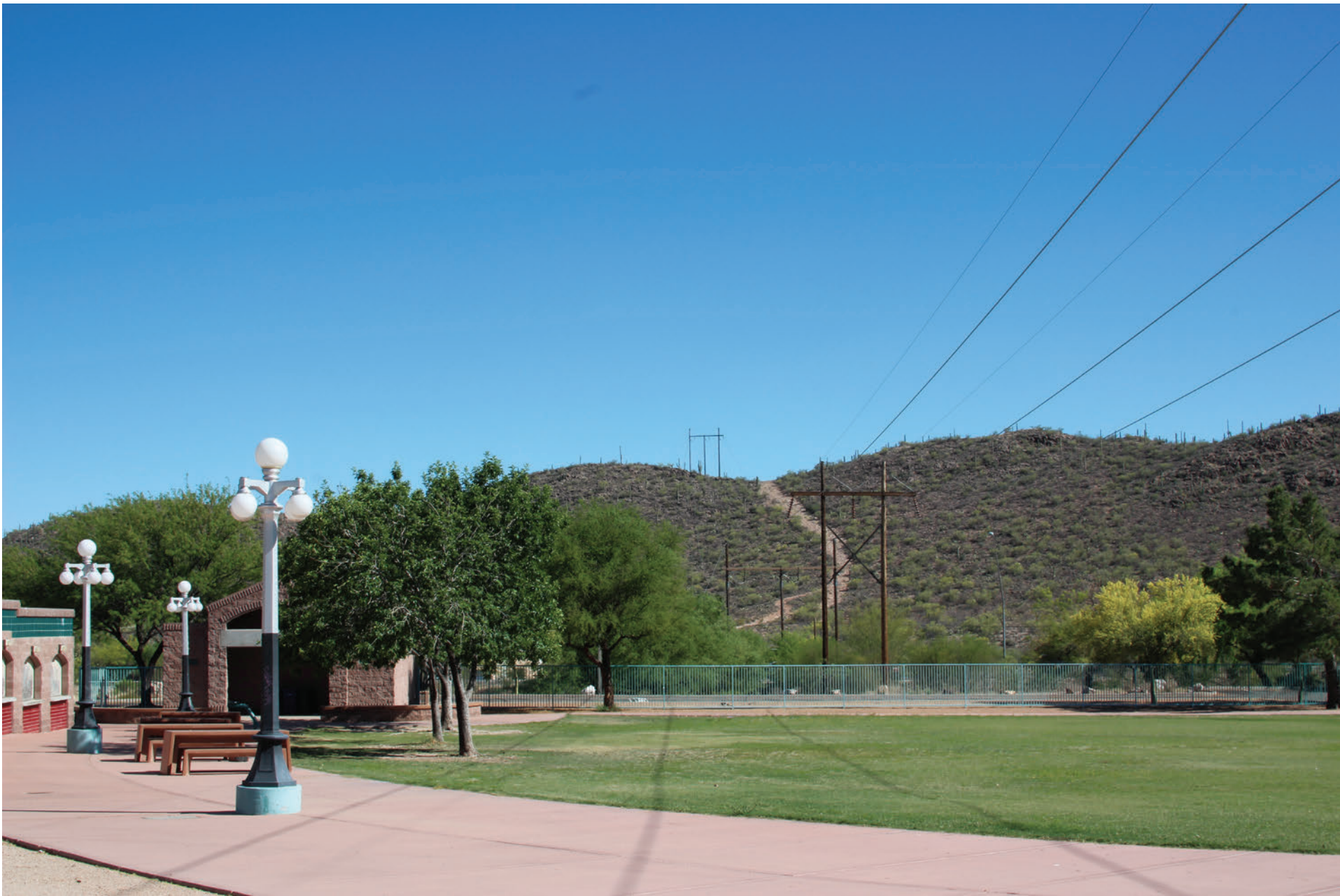
A. KOP U3-10. Existing view toward the representative ROW from an outdoor amphitheatre within Kennedy Park Fiesta Area, a Tucson City park.