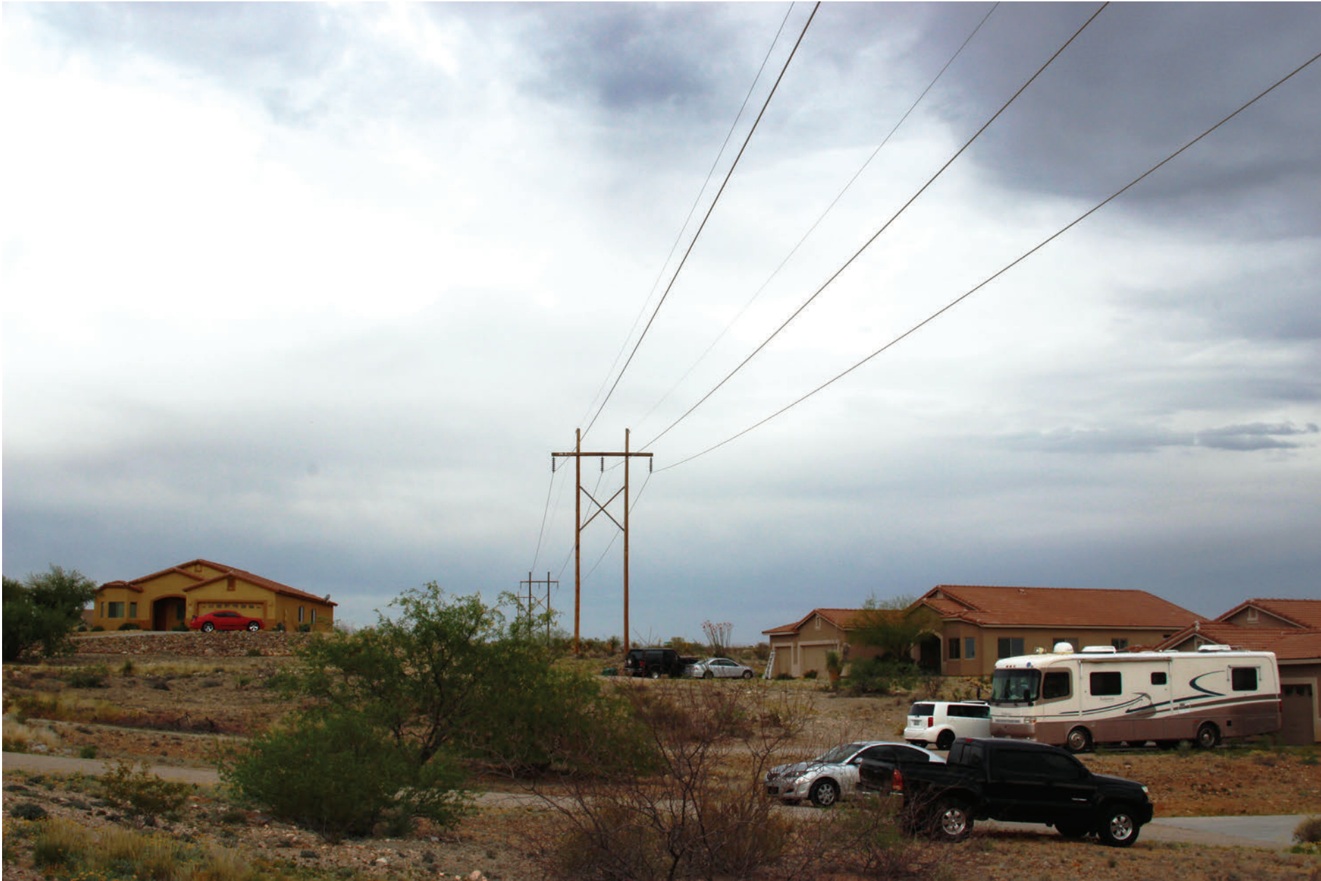
A. KOP U3-04. Existing view toward the representative ROW from New Tucson area near south Sonoita Ranch Circle residential area.