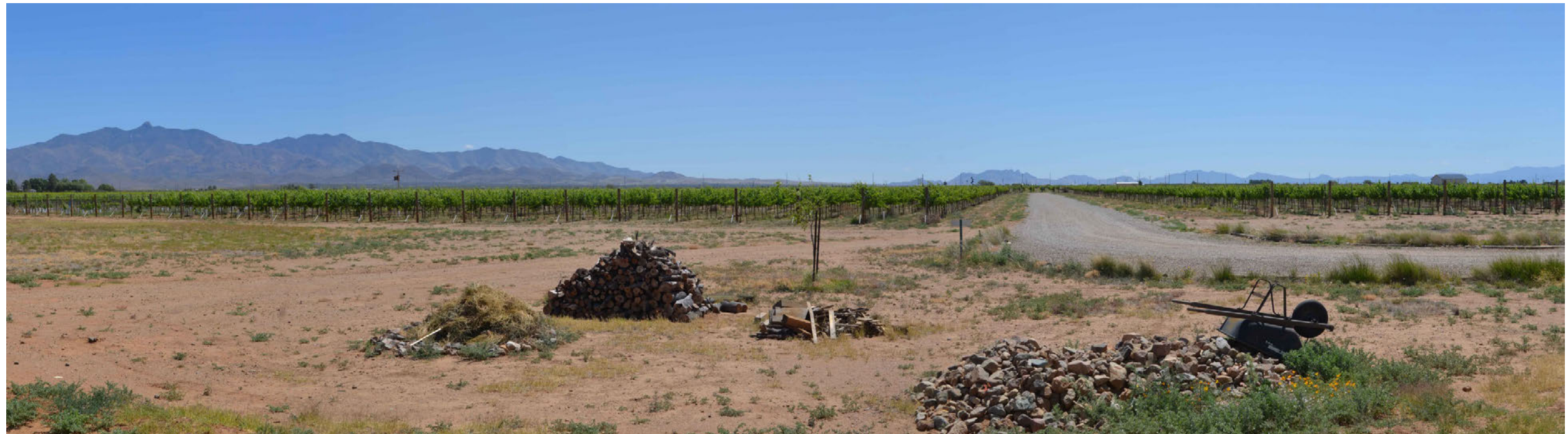
B. KOP WB-01. Simulated view toward route variation P7a from the grounds of the Zarpara Winery Tasting Room