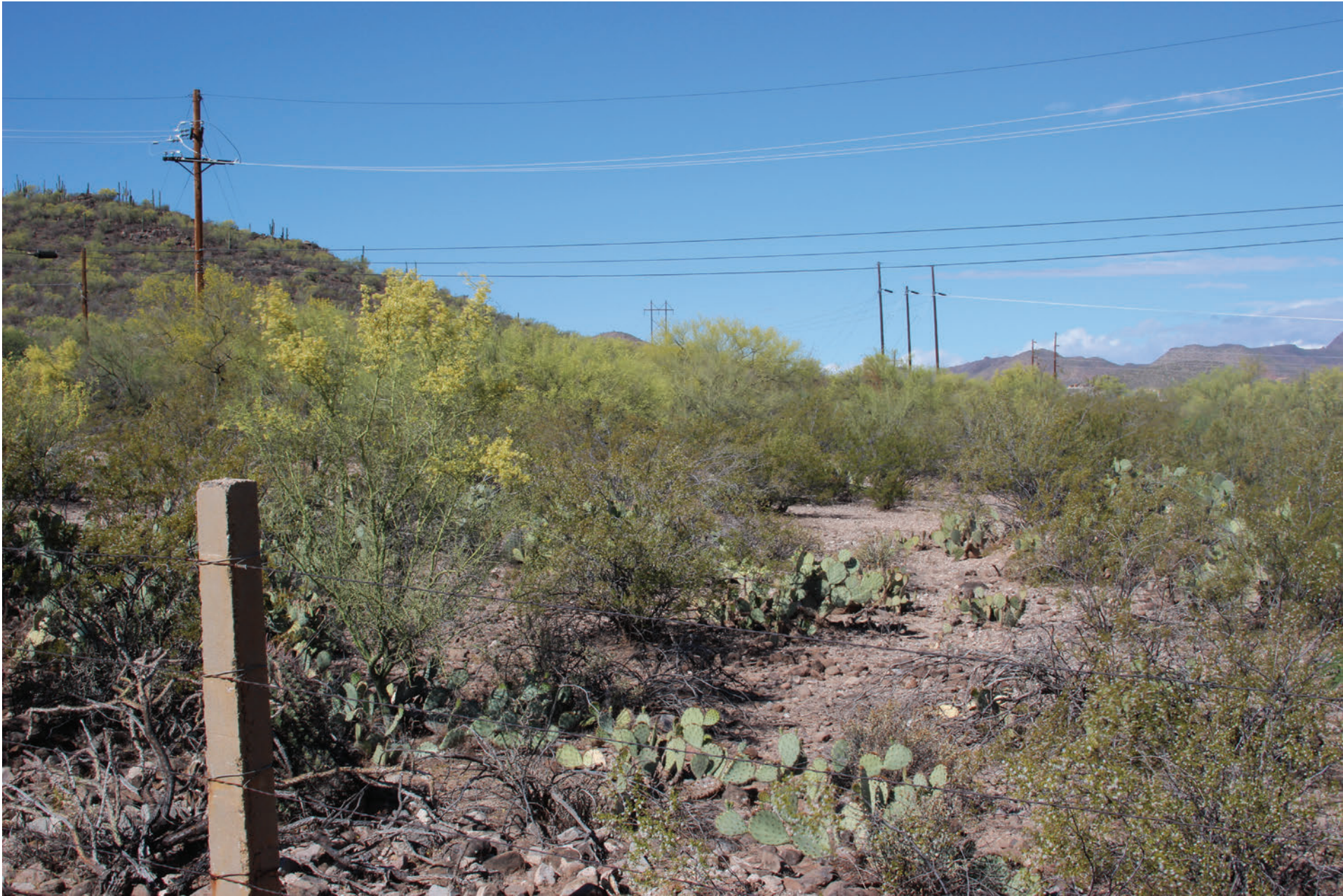
A. KOP U3-13. Existing view toward the representative ROW from Tumamoc Hill Road.