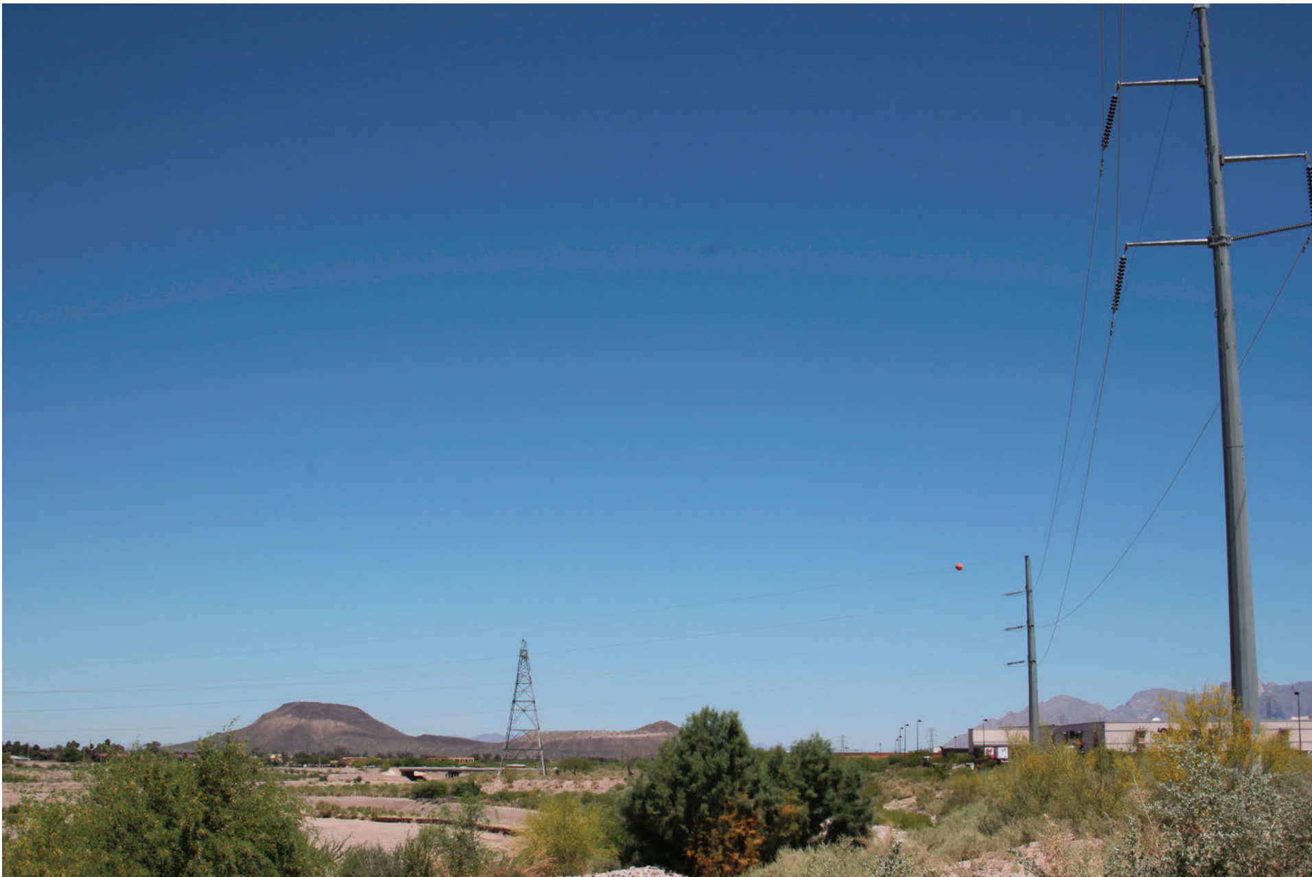
KOP U3-08. Existing view toward the representative ROW from Santa Cruz River Bikeway East River Trail system.