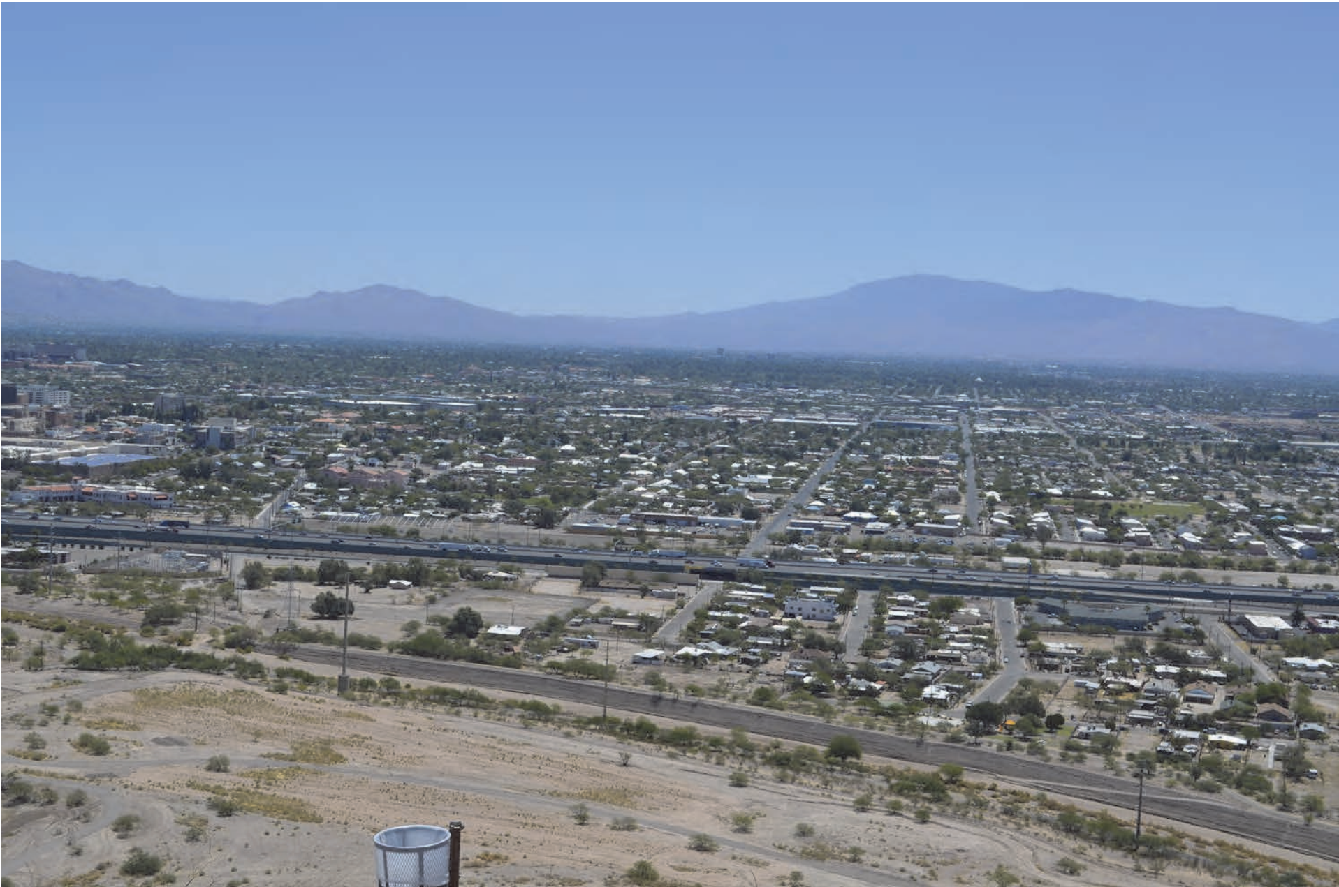
B. KOP TH3-S1. Simulated view toward the representative ROW (Segment TH3b) from South Sentinel Peak Road looking east.