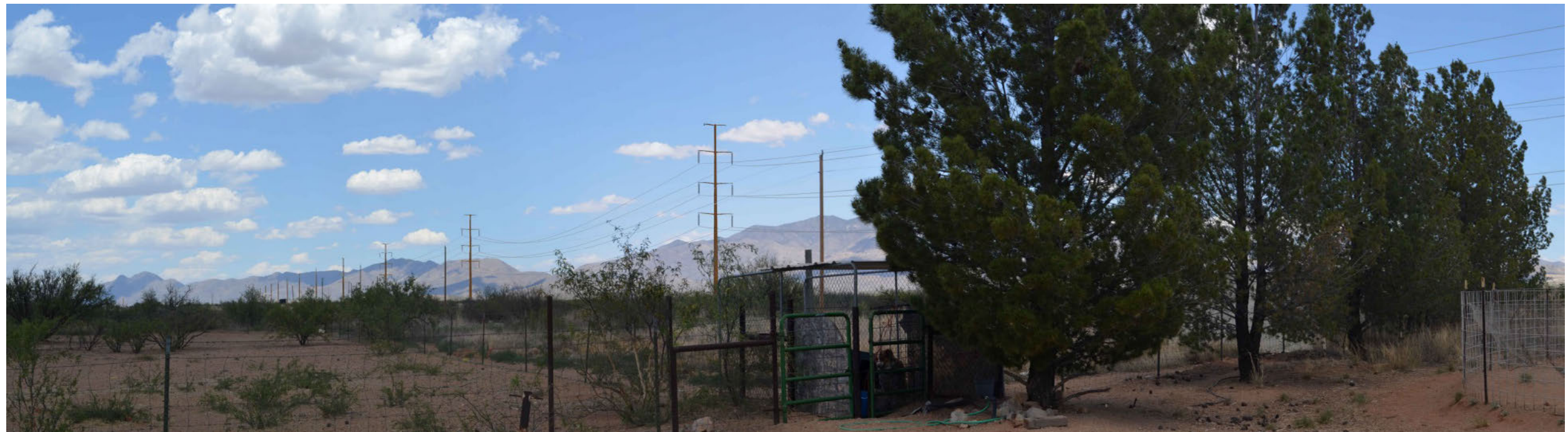
B. KOP WB-02. Simulated view toward route variation P7a from the backyard of the privately owned Narita Property