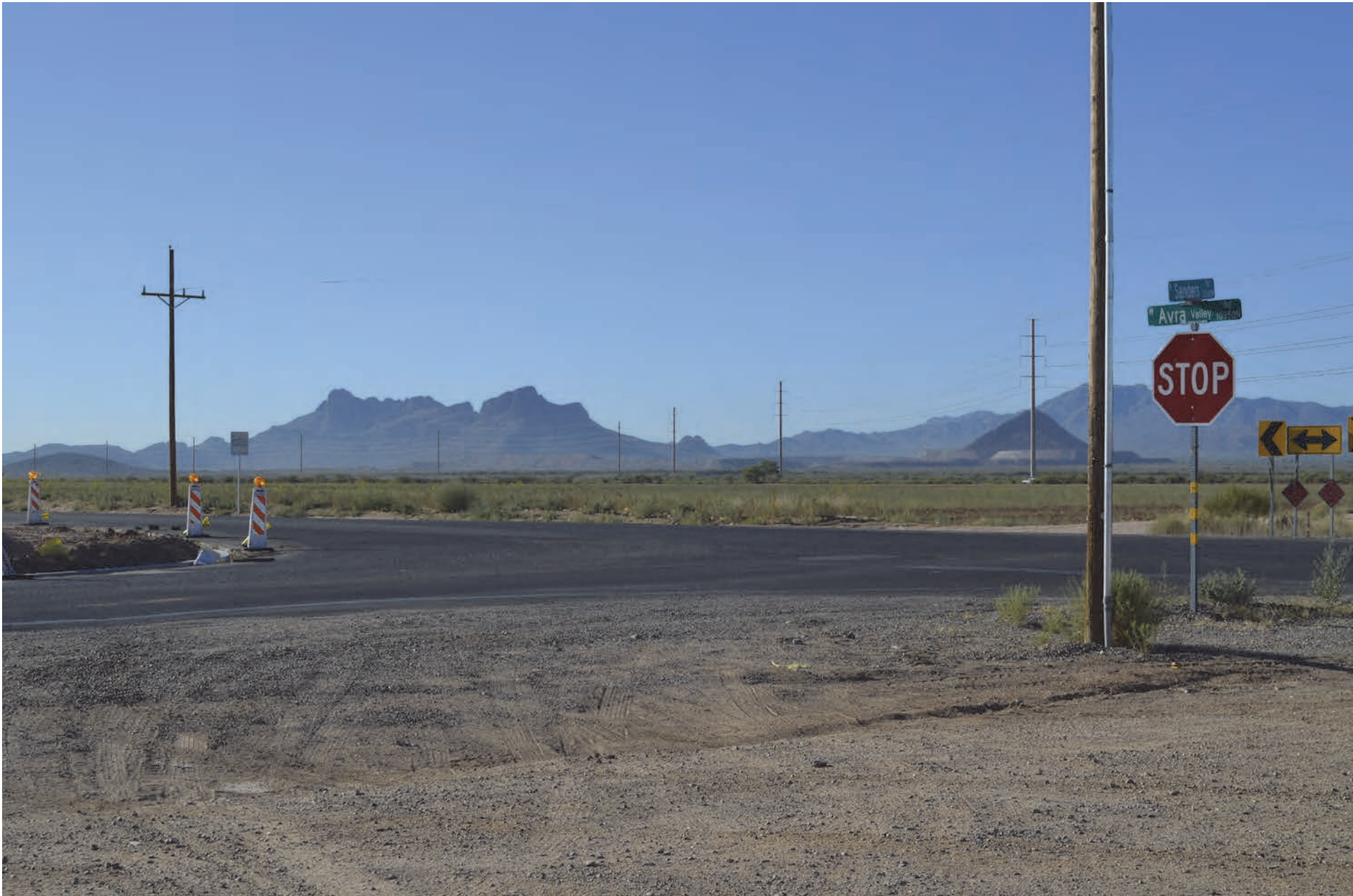
B. KOP MA-02. Simulated view toward the representative ROW (Segment U3) from the intersection of Sanders Road and West Avra Valley Road.