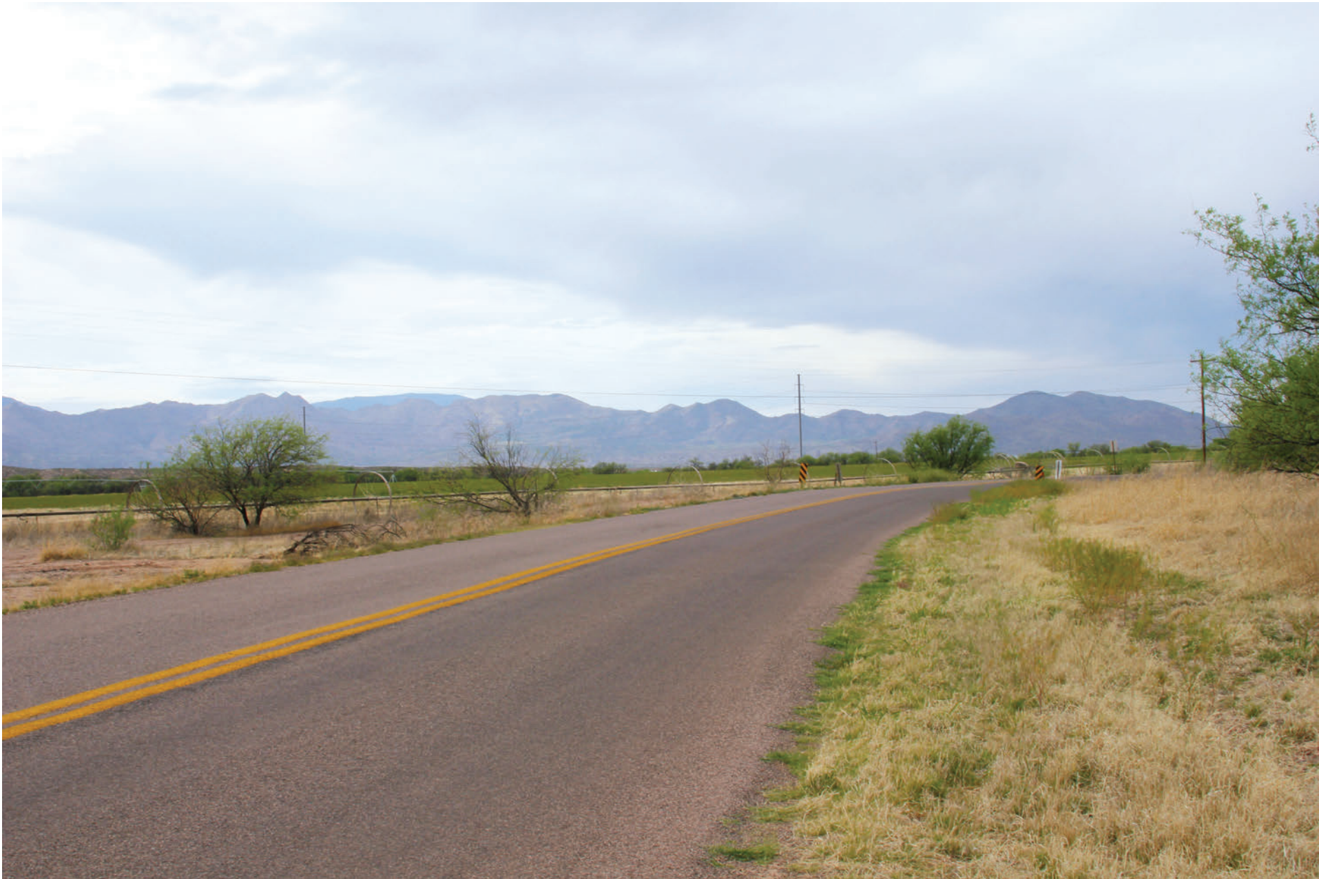
B. KOP H-01. Simulated view toward the representative ROW from a residential area in the community of Pomerene along North Cascabel Road.