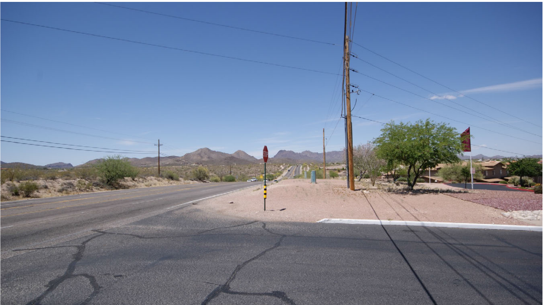
KOP TH1-S8. Existing view toward the representative ROW from Speedway Boulevard.