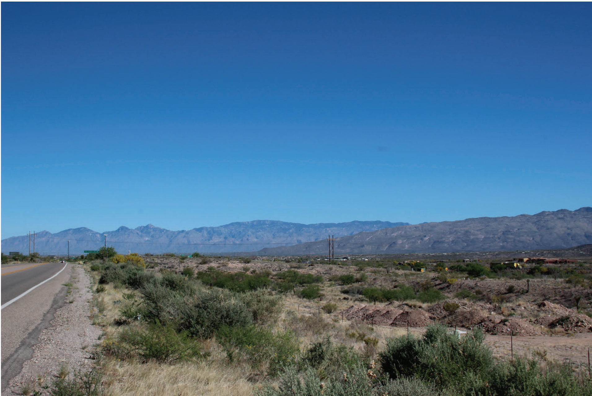
KOP U3-03. Existing view toward the representative ROW crossing of Scenic Highway 83.