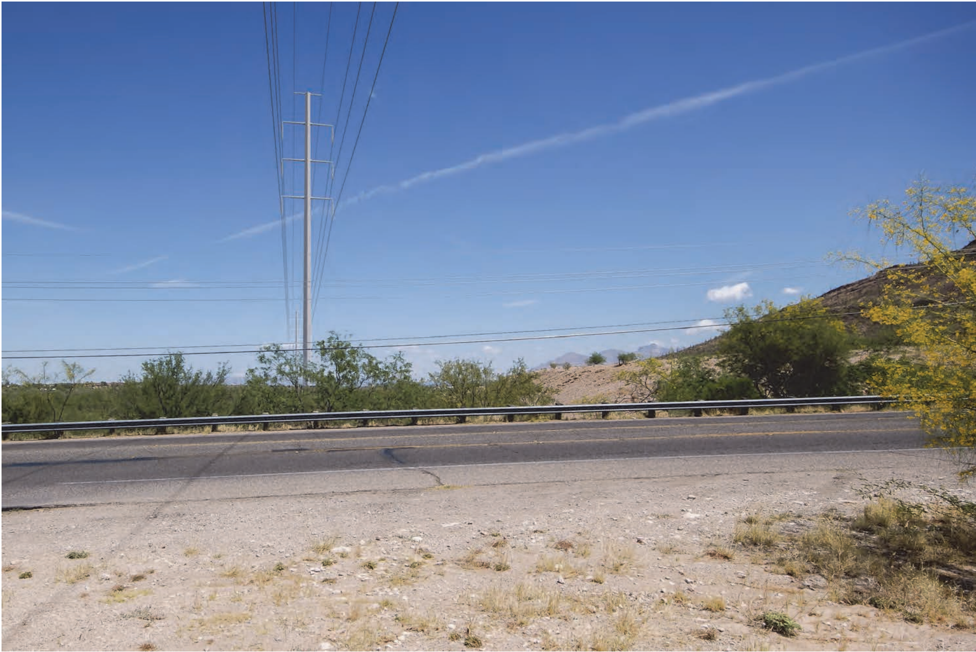
B. KOP TH1-S1. Simulated view facing north toward the representative ROW (Segment U3e) from West Starr Pass Boulevard between South Coati Drive and South Bison Drive.