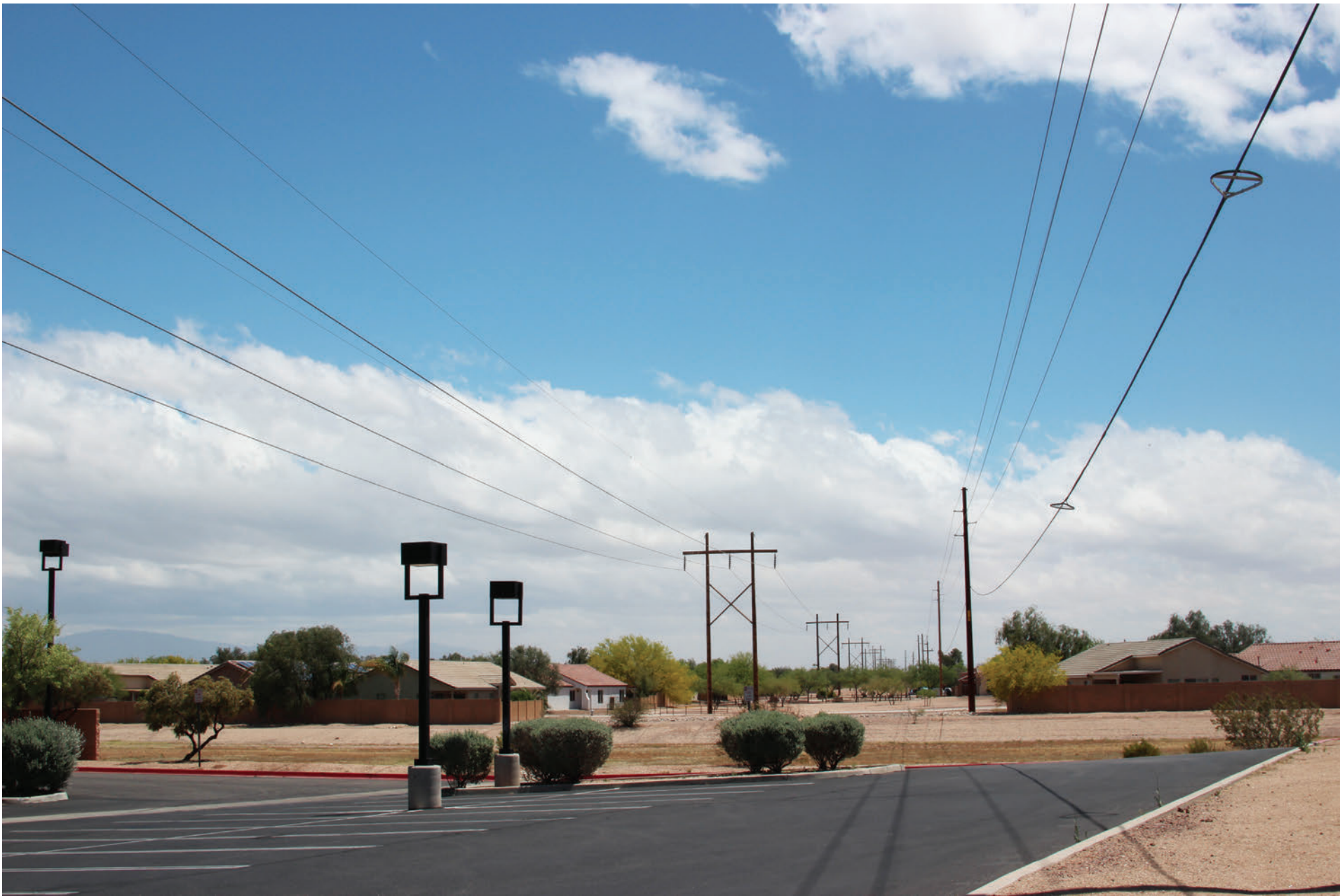
KOP U3-21. Existing view toward the representative ROW looking through a mixed commercial and residential area, southeast of Rattlesnake Ridge.