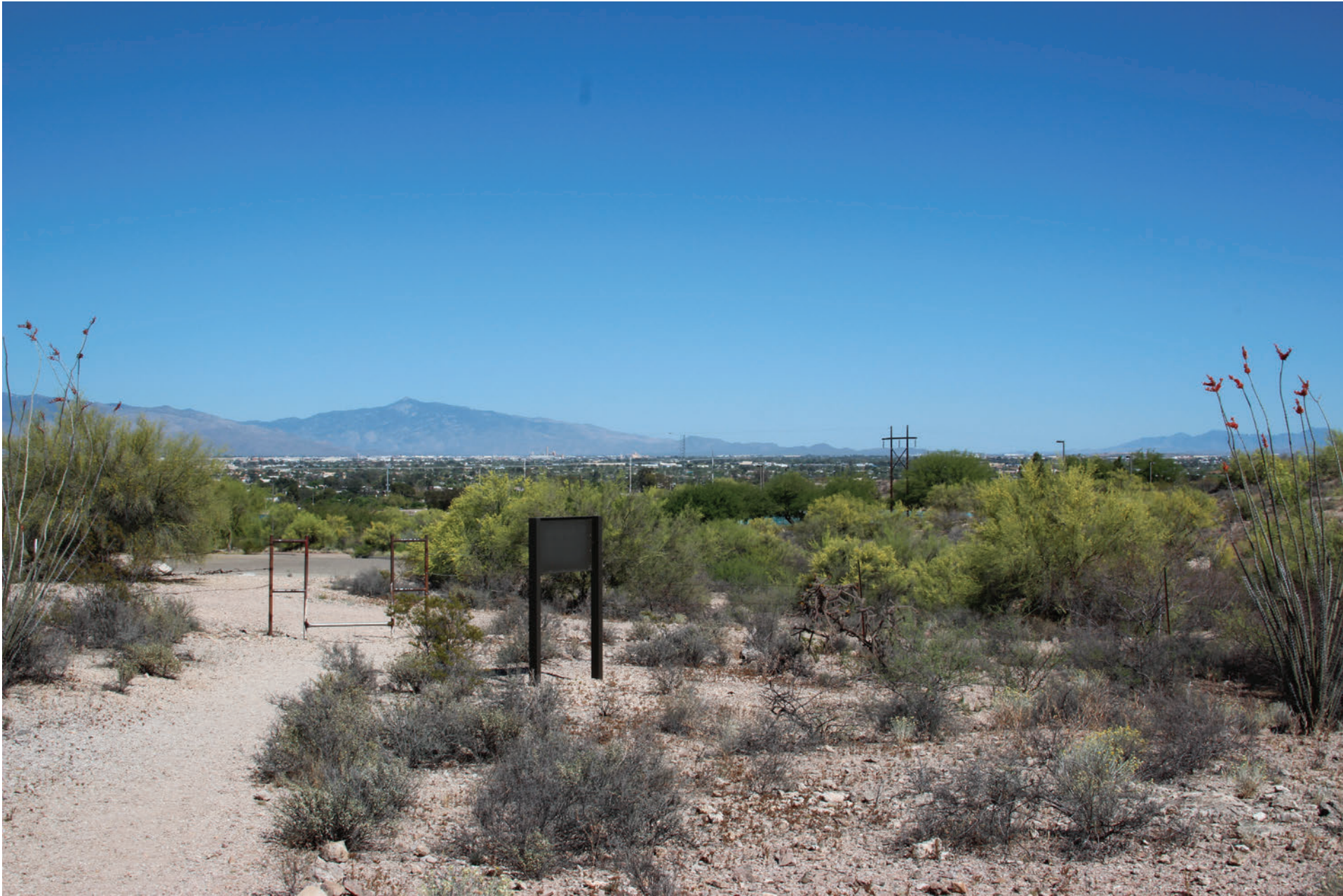
A. KOP U3-11. Existing view toward the representative ROW from Explorers Trail within Tucson Mountain Park, Pima County.