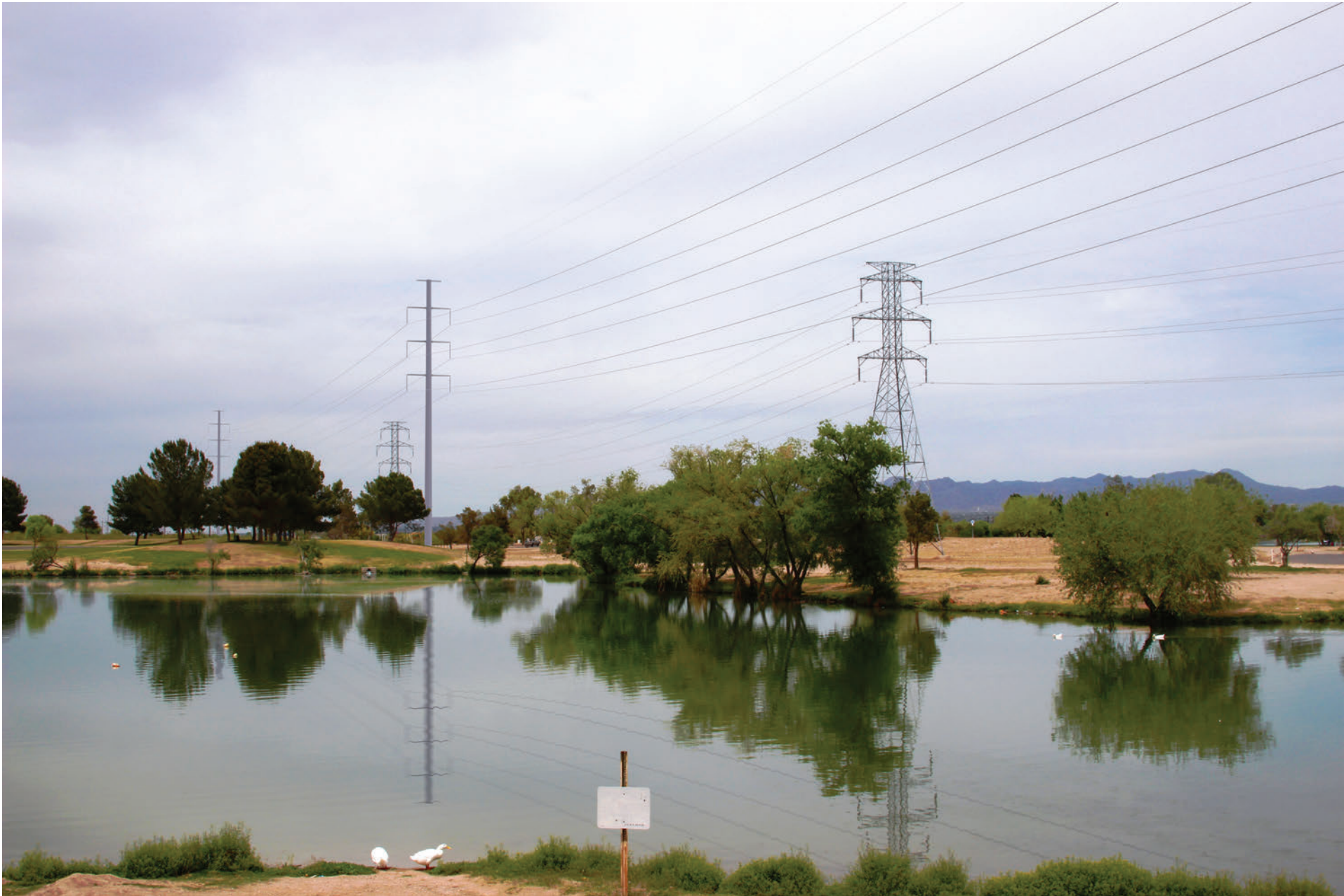
B. KOP U3-17. Simulated view toward the representative ROW from Christopher Columbus Park, a Tucson City park.