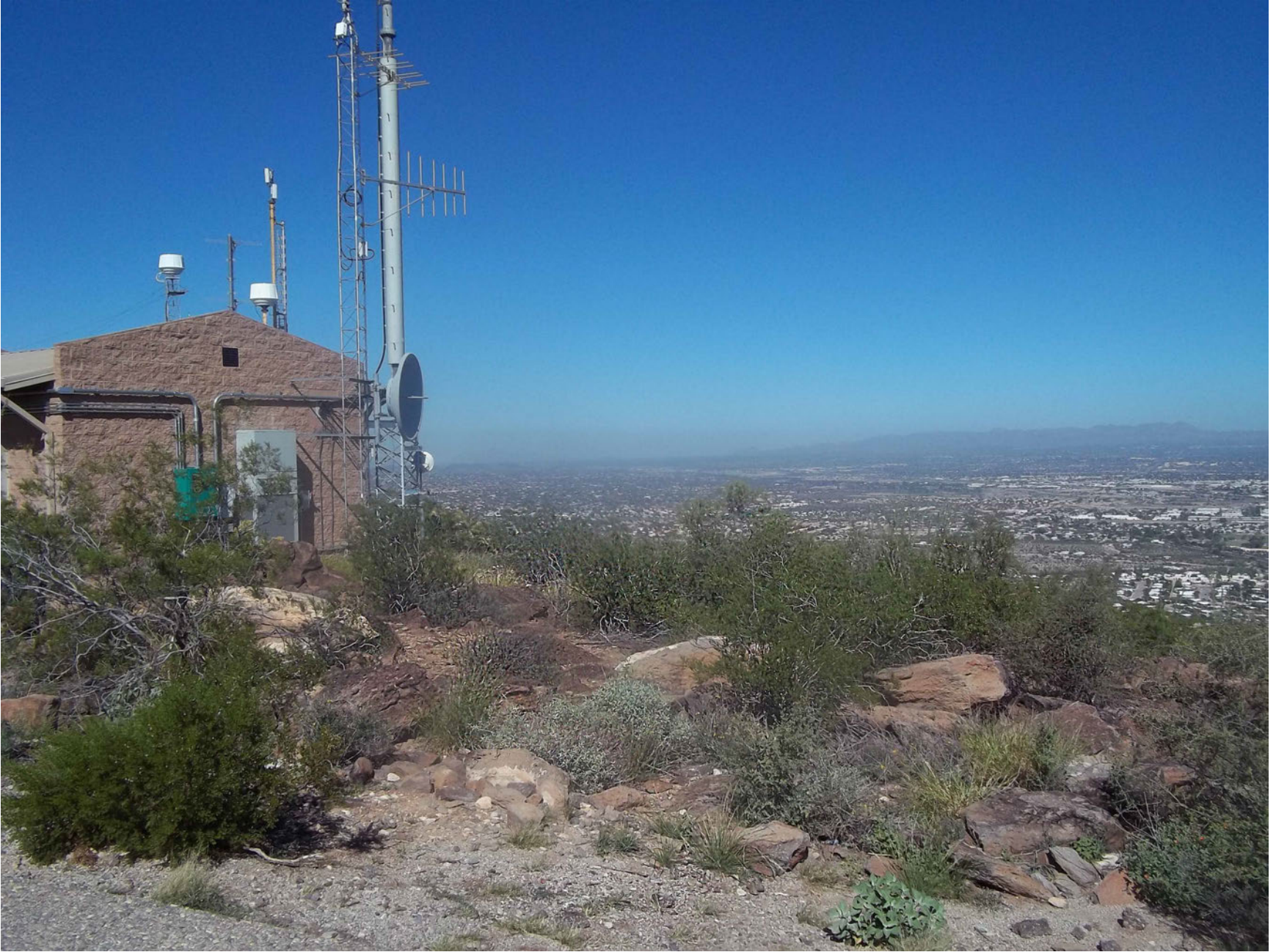
A. KOP TH1-03. Existing view from Sentinel Peak at Tumamoc Hill oriented towards Local Alternatives TH1b and TH1c in the Upgrade Section.