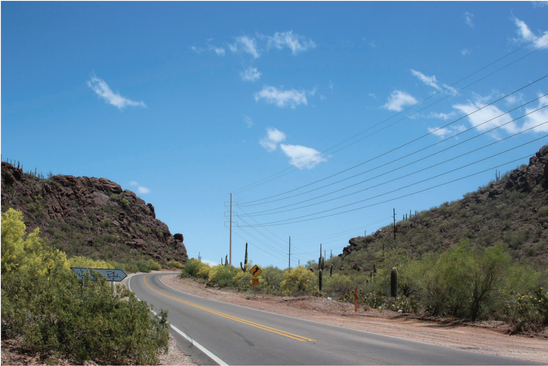
B. KOP U3-22. Simulated sensitive view toward the representative ROW along West Twin Peaks Road, northwest of Rattlesnake Ridge.