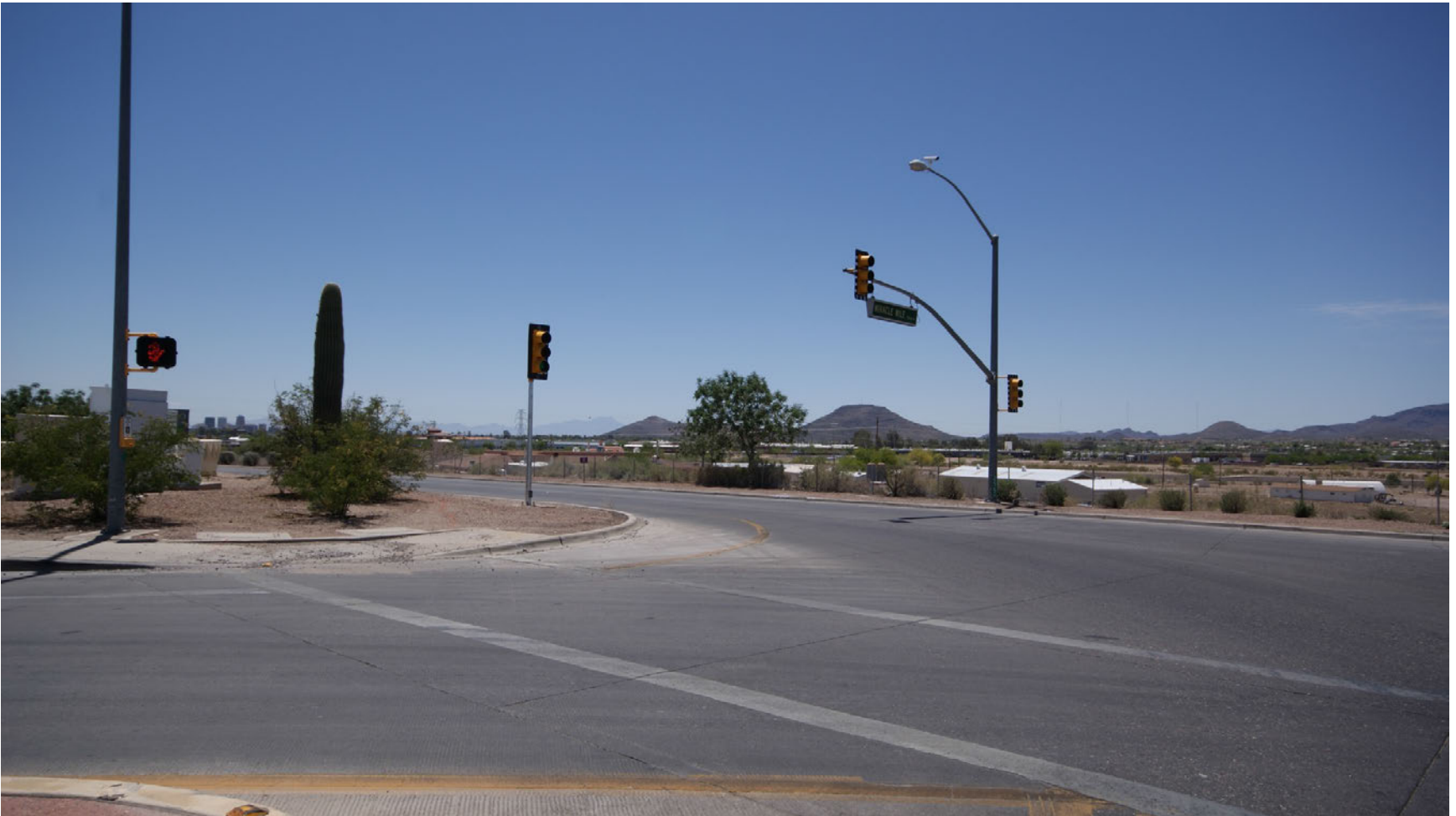
KOP TH1-S10. Existing view toward the representative ROW from West Miracle Mile and I-10.