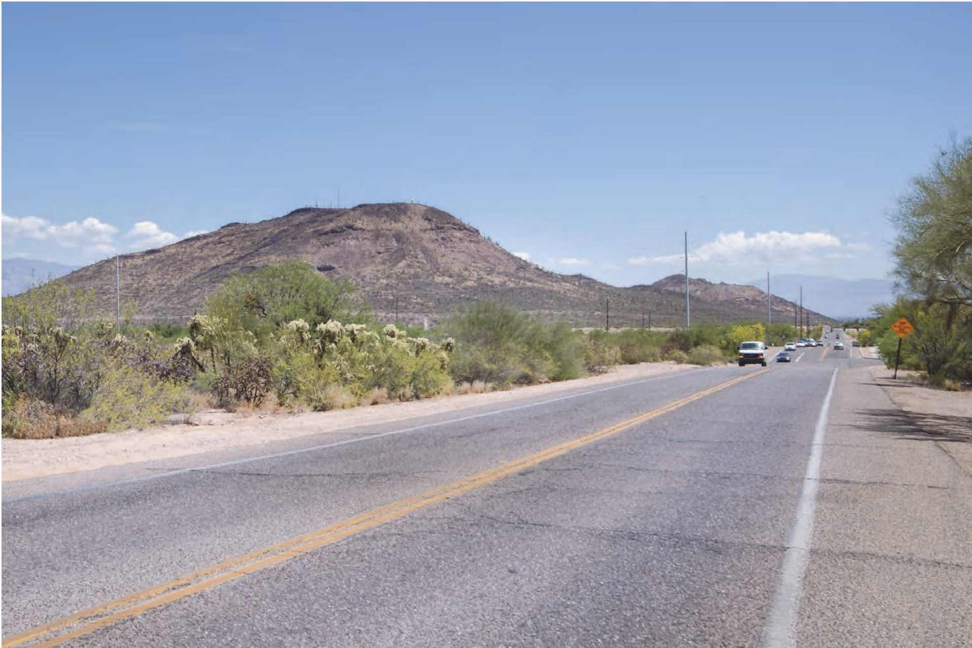
B. KOP TH1-S3. Simulated view facing east toward the representative ROW from West Starr Pass Boulevard near Park W Lane. Segment TH1a is visible north of and along Starr Pass Boulevard. Segment U3d is visible south of Starr Pass Boulevard.