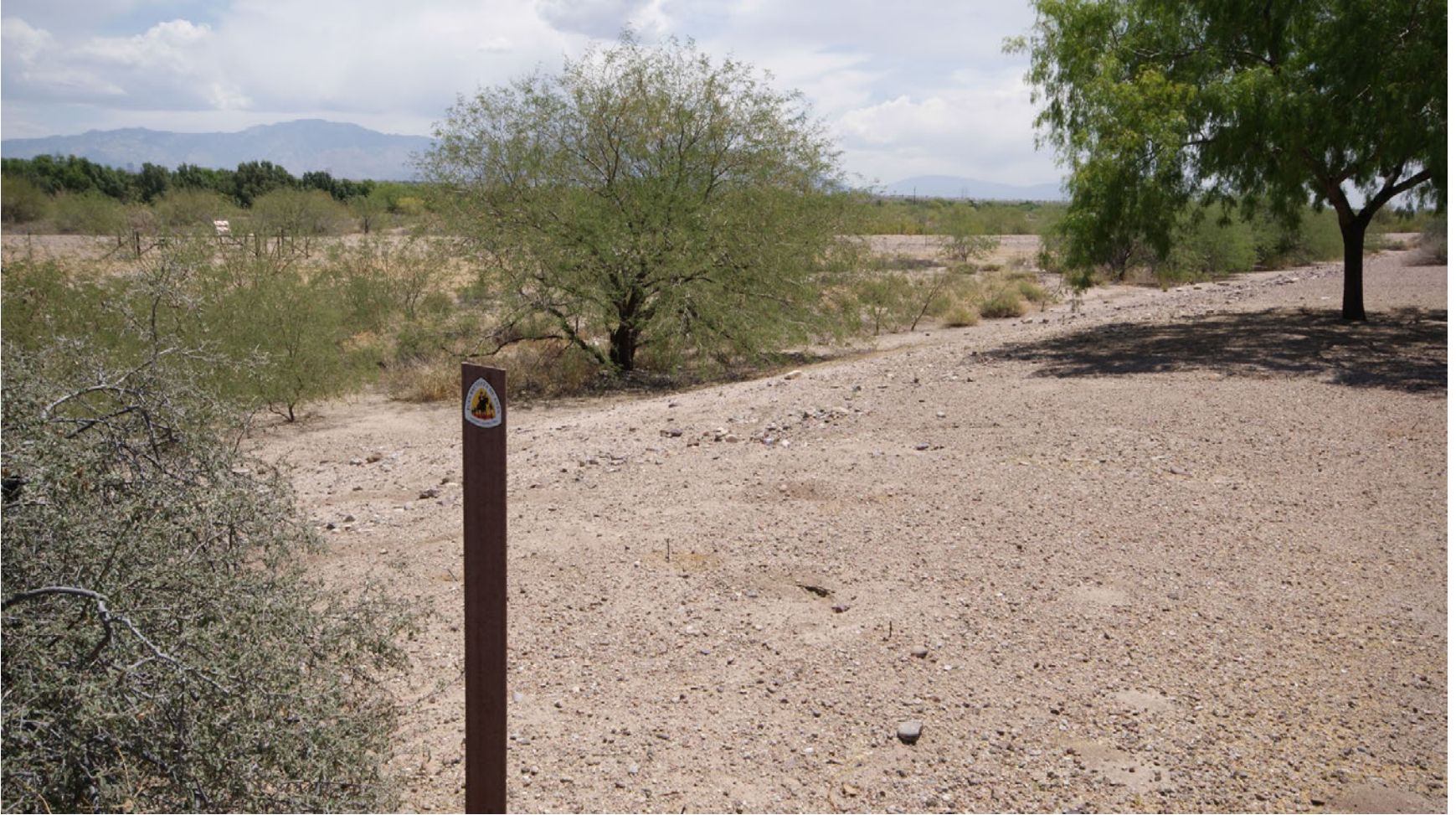
KOP AN-03. Existing view looking north-northwest along the Loop on the Santa Cruz River Bikeway/Anza Trail.