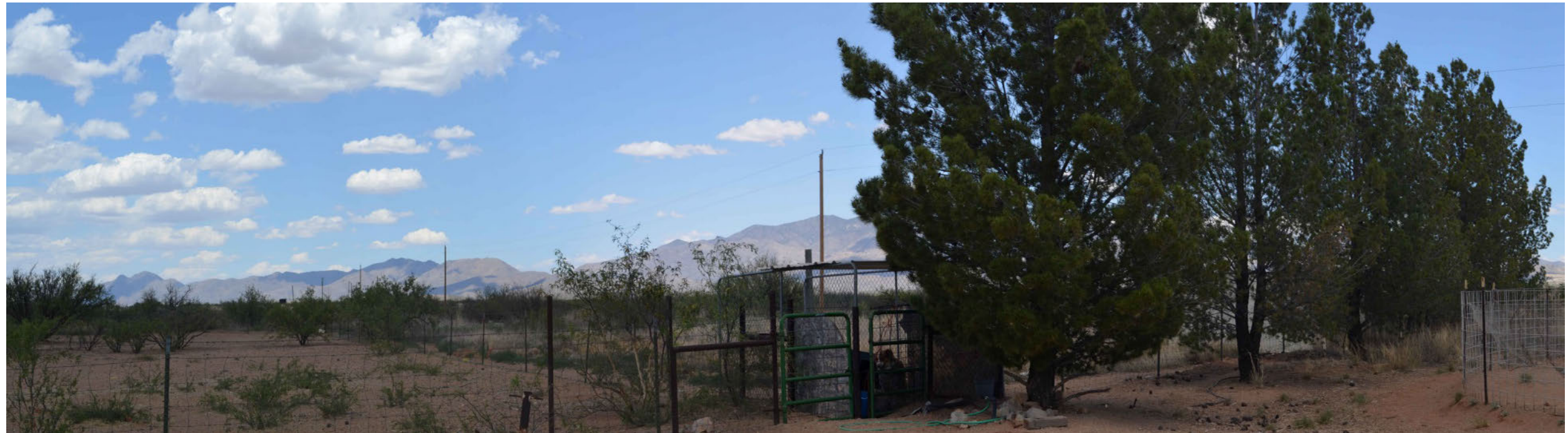
A. KOP WB-02. Existing view toward route variation P7a from the backyard of the privately owned Narita Property