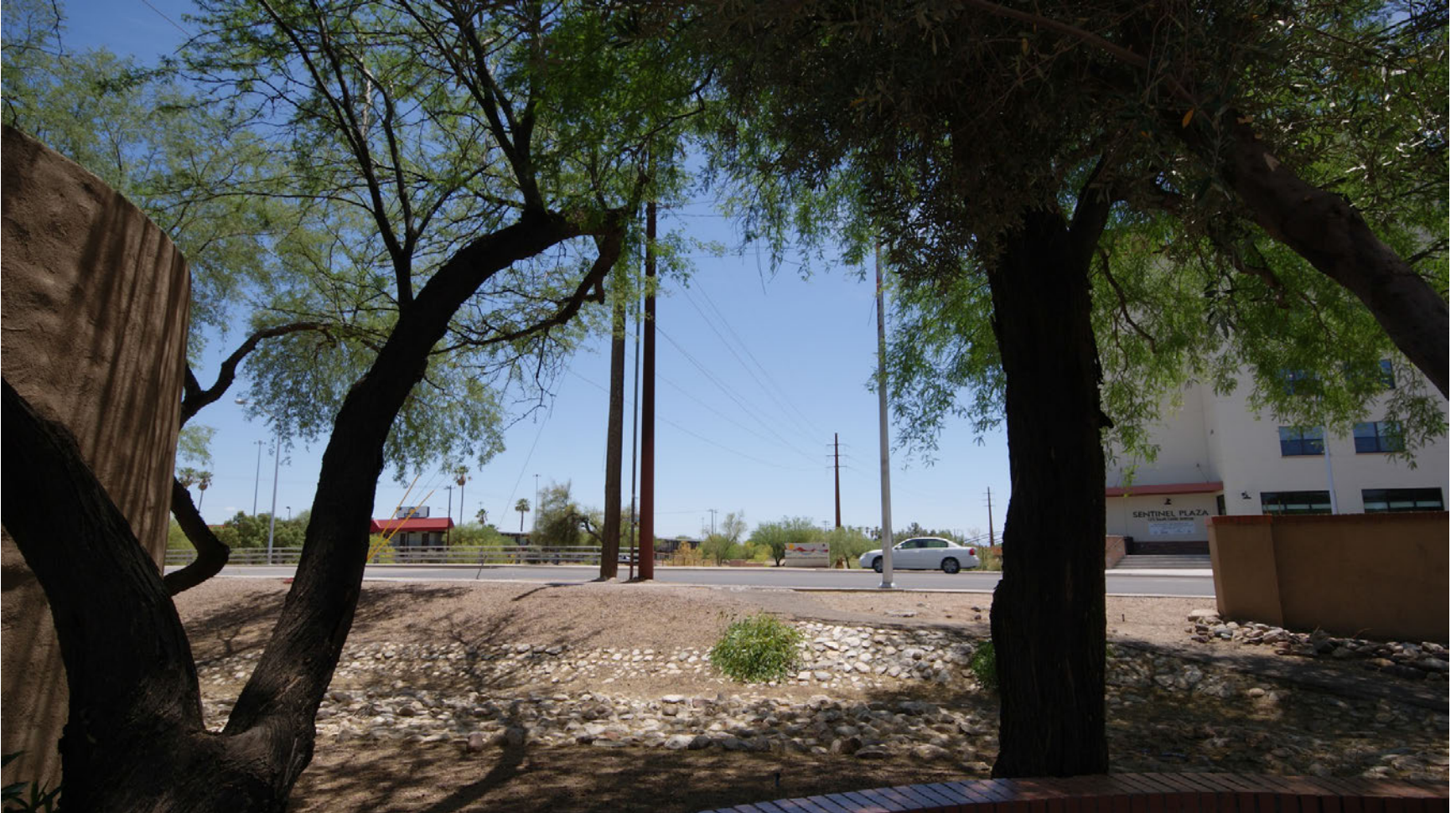
KOP TH3-R3. Existing view toward the representative ROW from the Garden of Gethsemane, a Tucson City park.