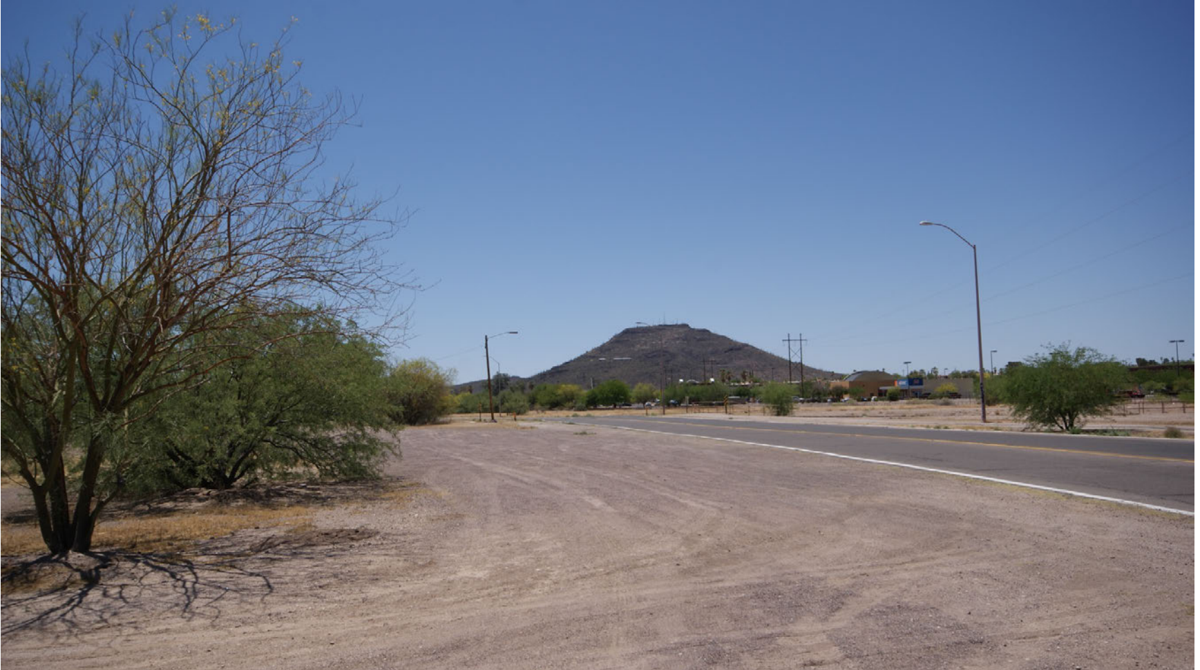
KOP TH1-S9. Existing view toward the representative ROW from North El Rio Drive near El Rio Golf Course, a Tucson City public golf course.