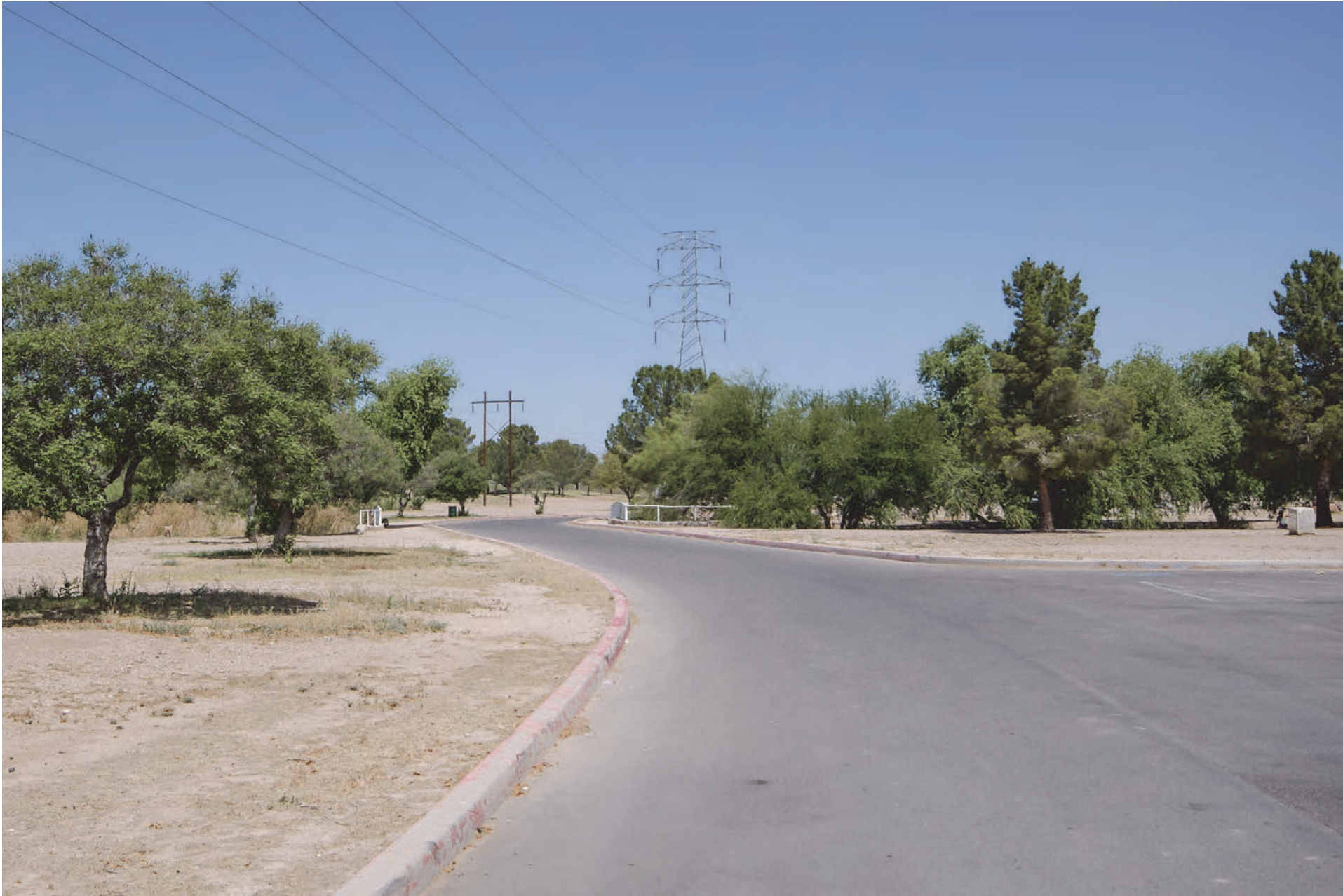
A. KOP AN-04. Existing view toward the representative ROW (Segment U3i) from Christopher Columbus Park.