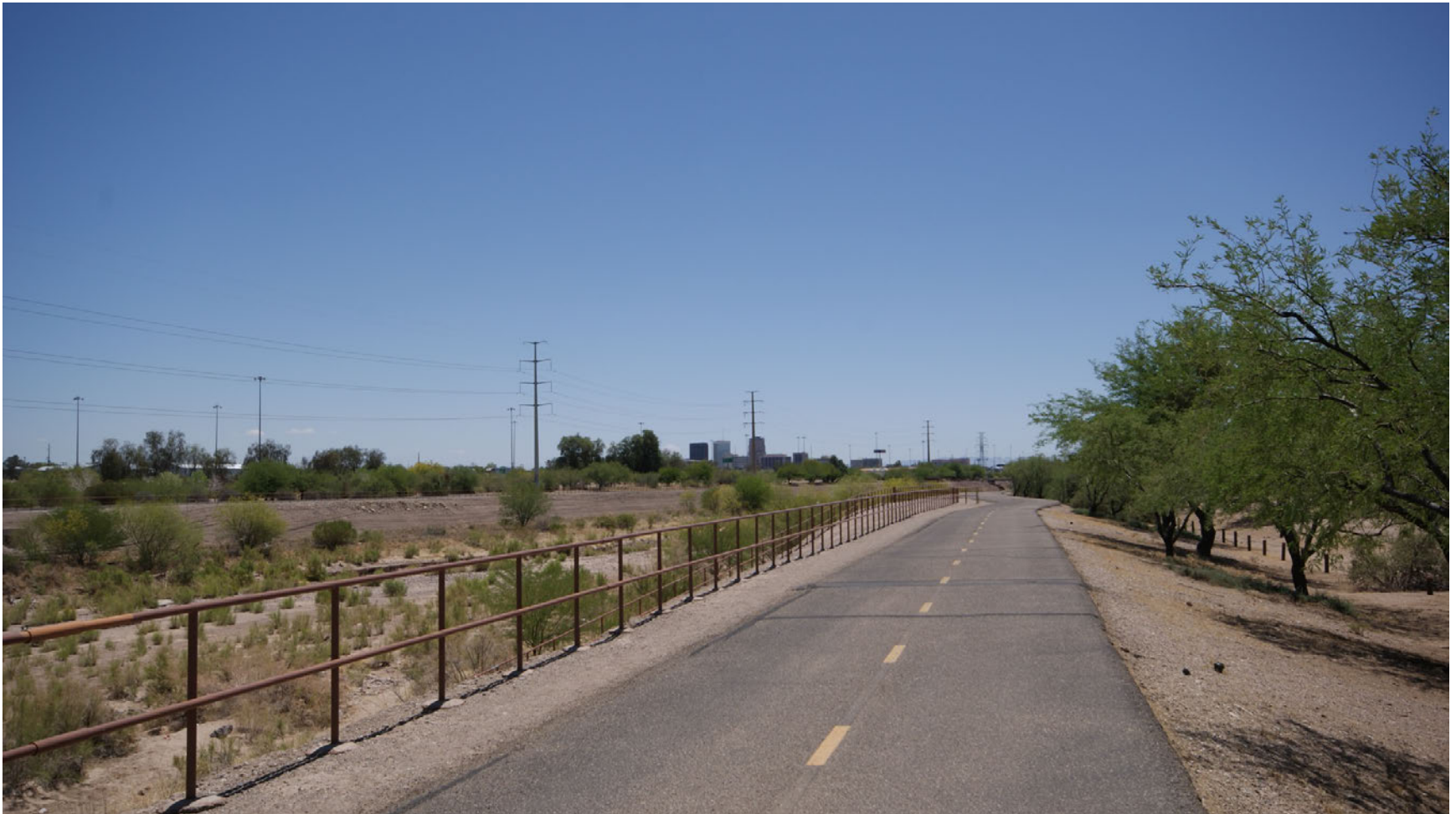
KOP TH3-R1. Existing view toward the representative ROW from the Loop on the Santa Cruz River Bikeway.