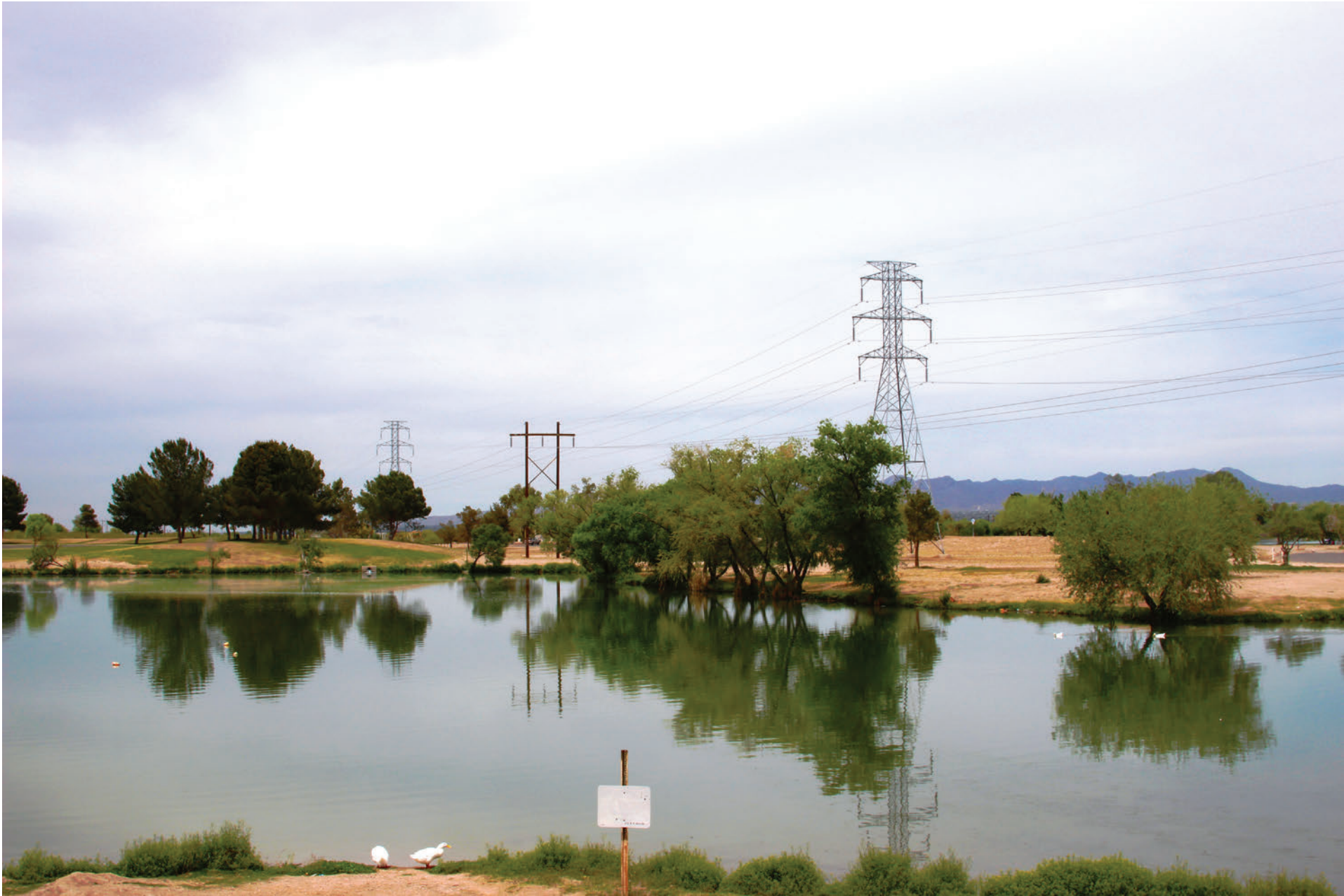
A. KOP U3-17. Existing view toward the representative ROW from Christopher Columbus Park, a Tucson City park.