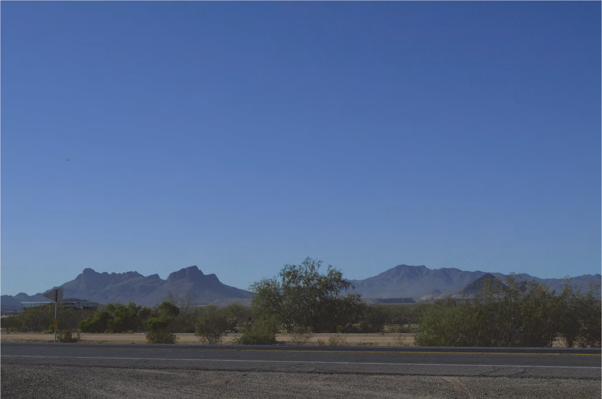
A. KOP MA-03. Existing view toward the representative ROW (Segment U3i) from the Marana Airport entrance located at West Avra Valley Road.