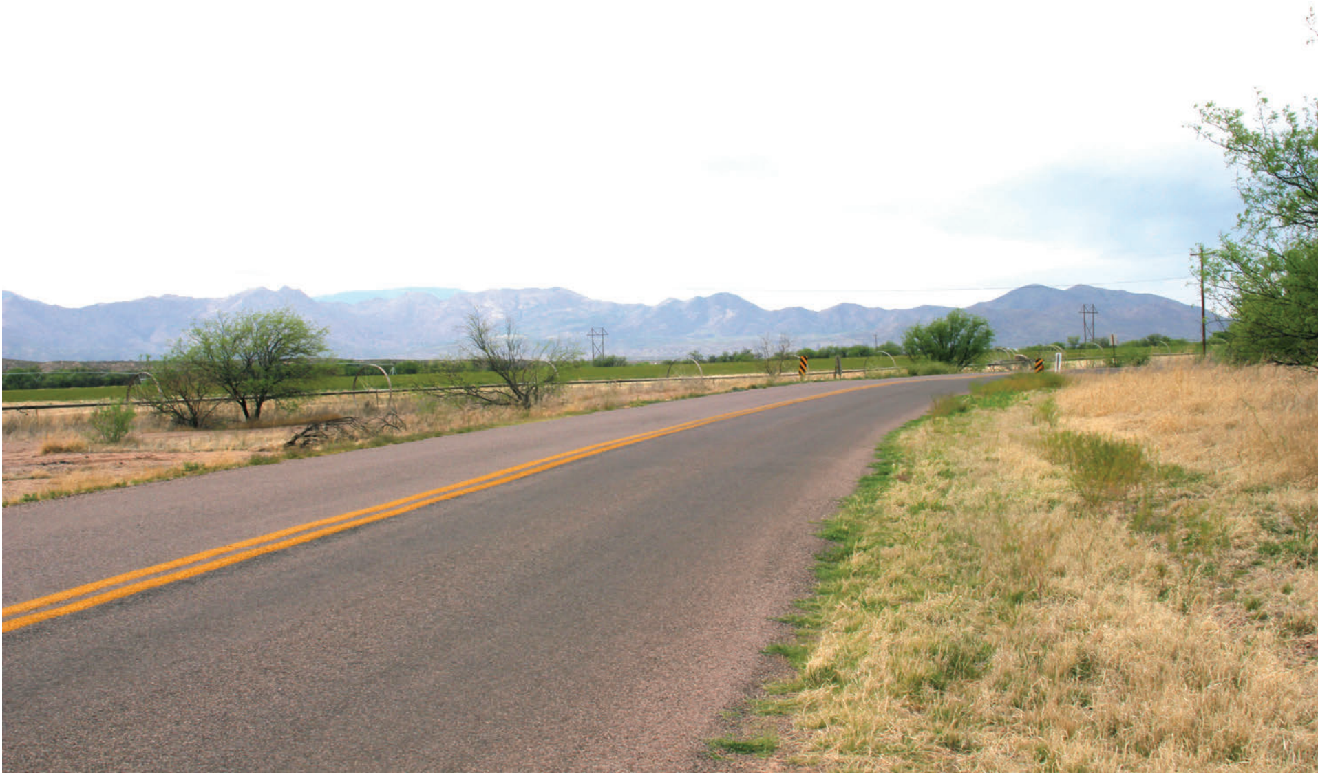
A. KOP H-01. Existing view toward the representative ROW from a residential area in the community of Pomerene along North Cascabel Road.