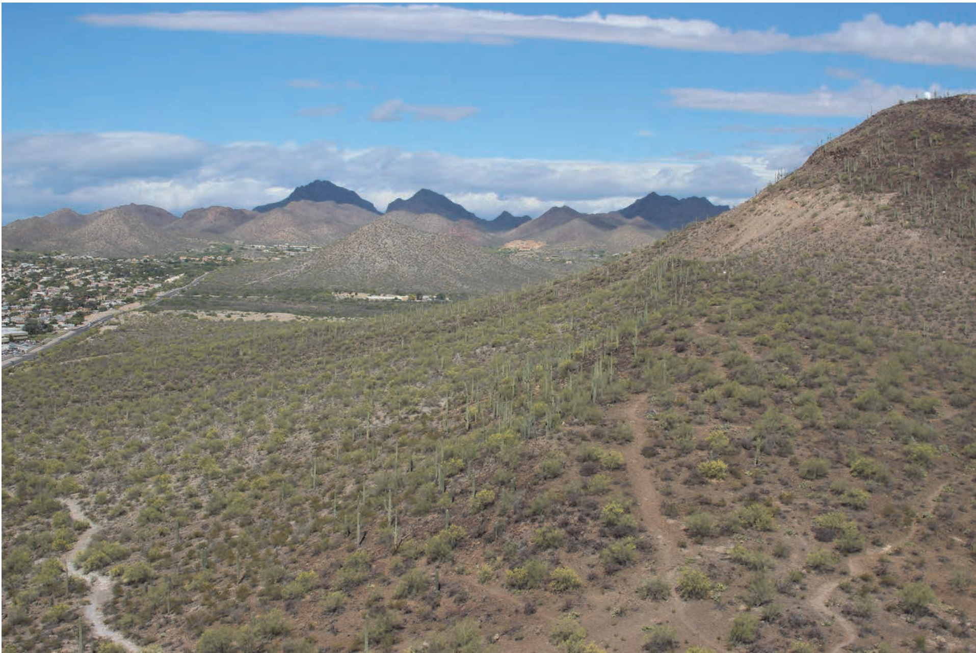
A. KOP TH1-02. Existing view toward the representative ROW from the trail extending off of the parking area formed by Sentinel Peak Road S. looking west.