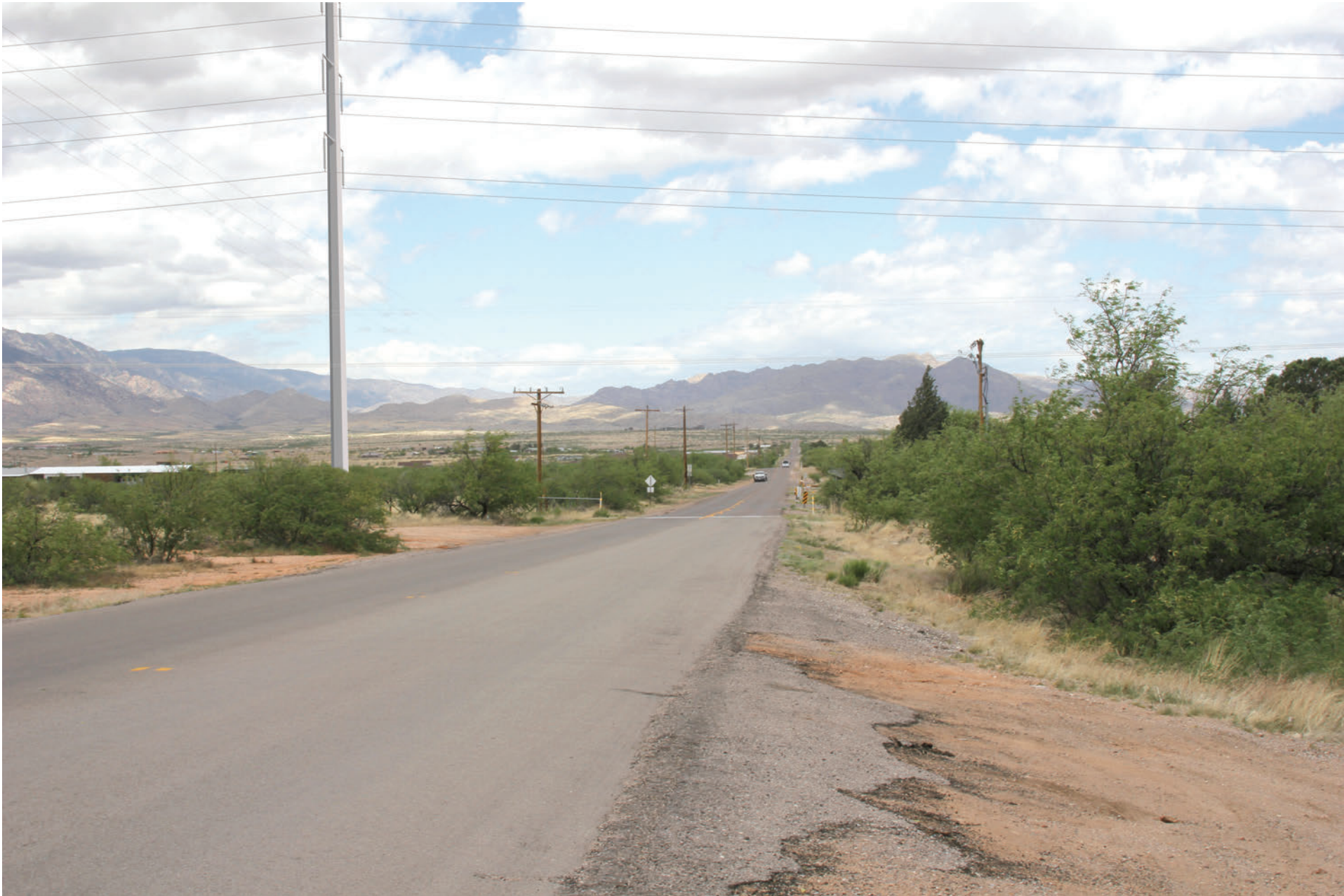
B. KOP U2-03. Simulated view toward the representative ROW from the community of Mescal along North Mescal Road.