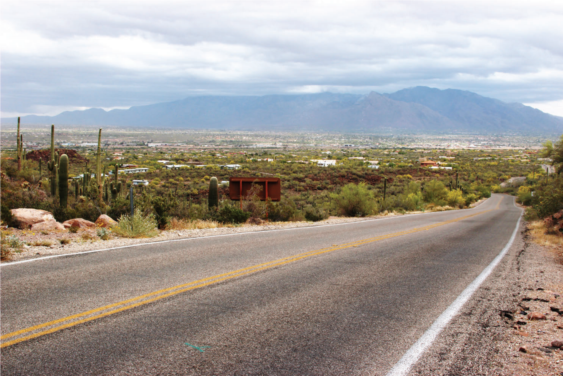
KOP U3-19. Existing view toward the representative ROW from West Picture Rocks Road, located at entry to Saguaro National Park.