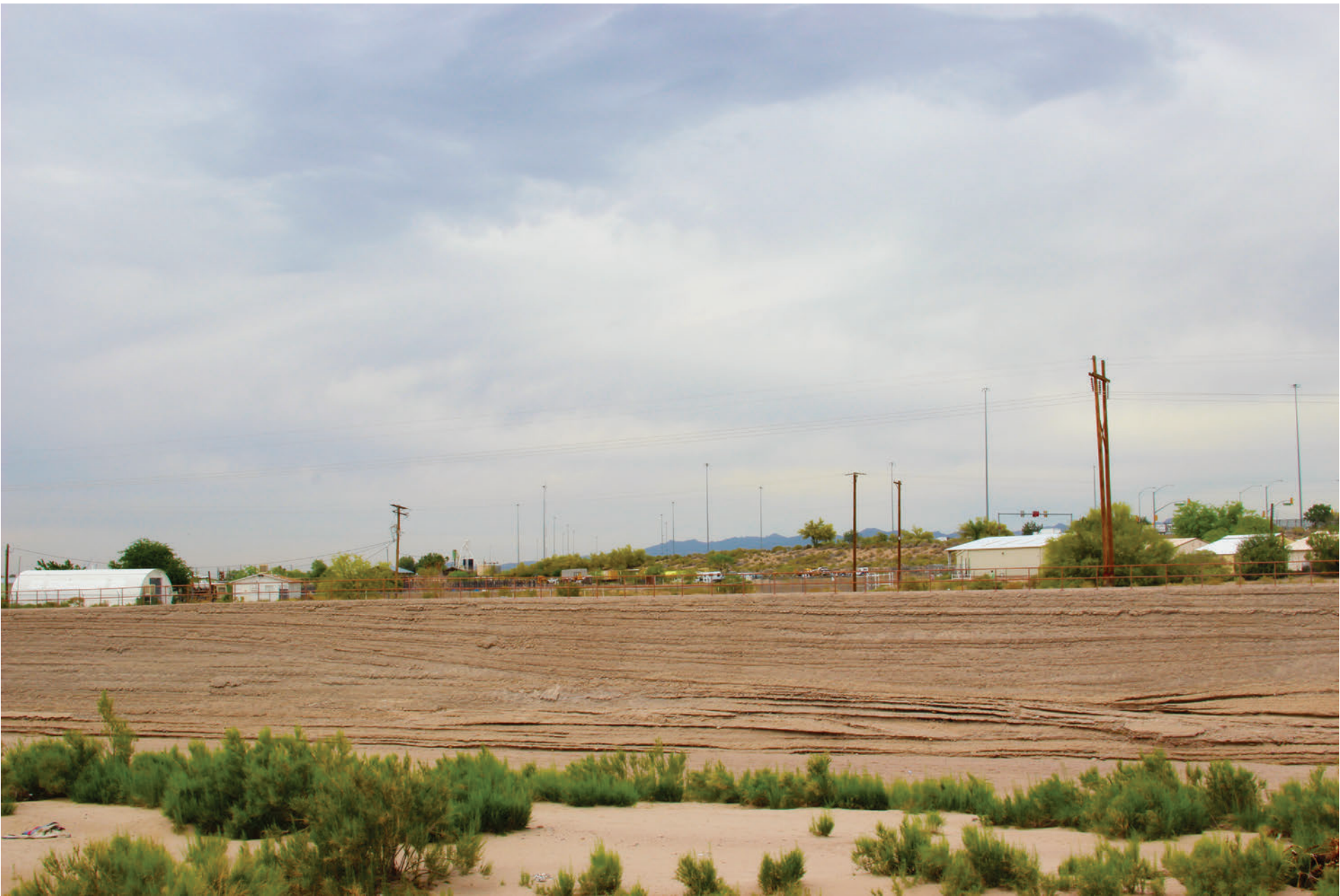
KOP U3-15. Existing view toward the representative ROW from the river crossing along the trail near Juhan Park, a Tucson City park.