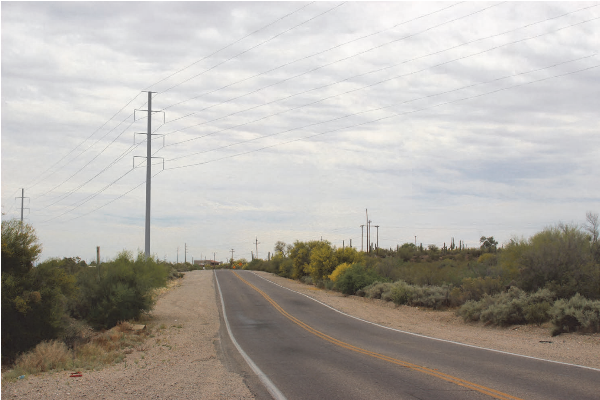
B. KOP U3-18. Simulated view toward the representative ROW (Segment U3i) from Juan Bautista de Anza National Historic Trail along North Silverbell Road near North Abington Road.