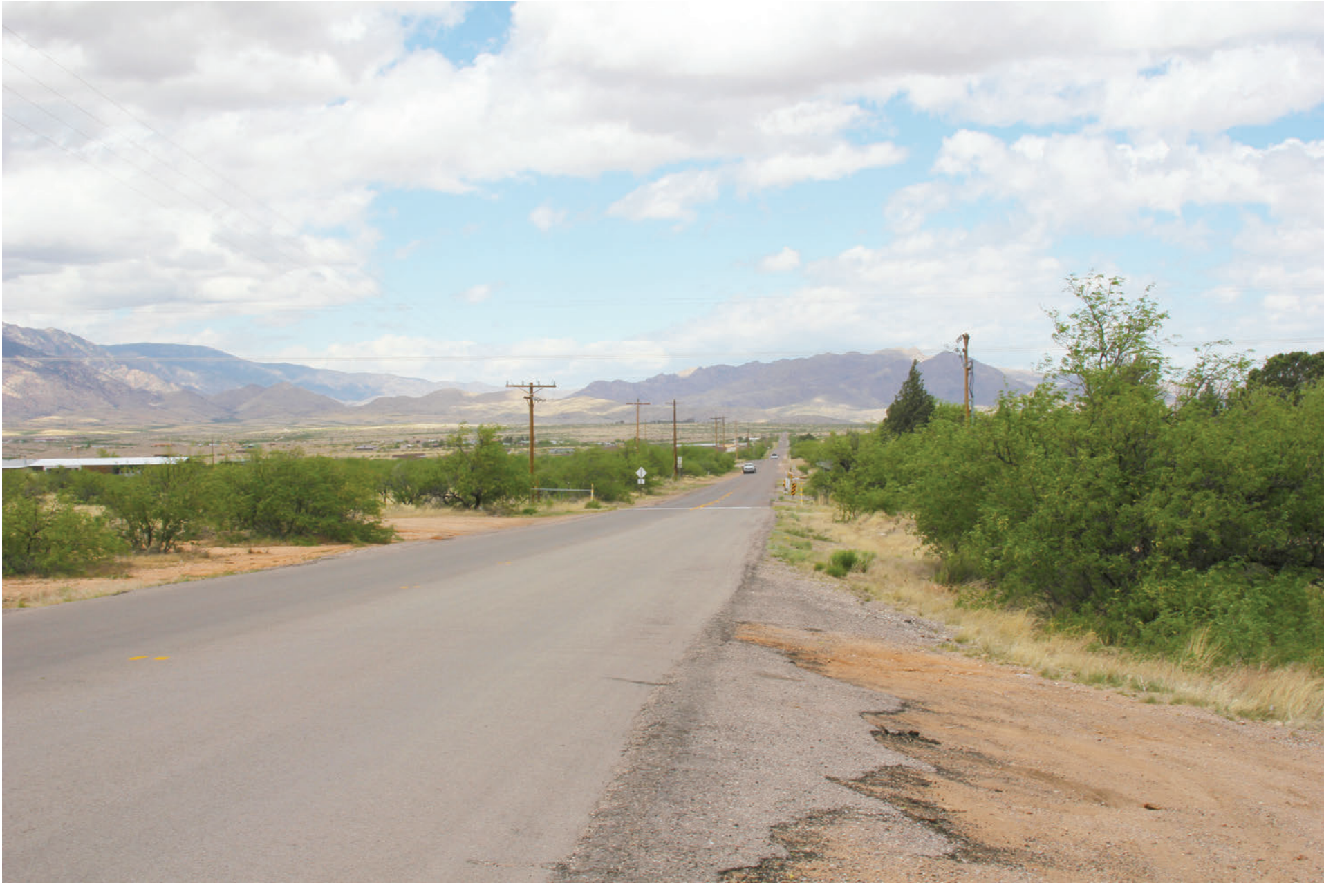
A. KOP U2-03. Existing view toward the representative ROW from the community of Mescal along North Mescal Road.