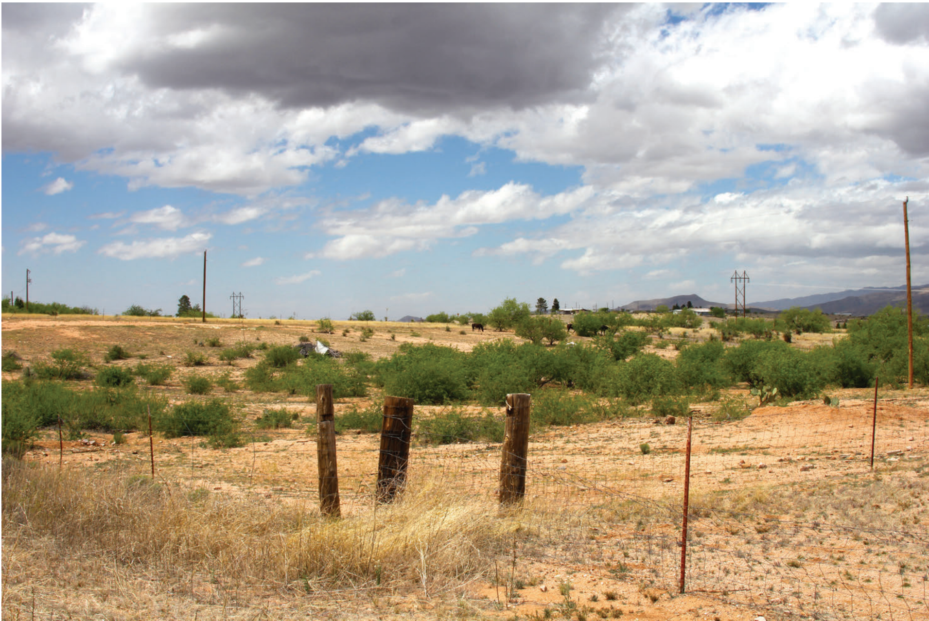
KOP U2-04. Existing view toward the representative ROW line within the community of Mescal.