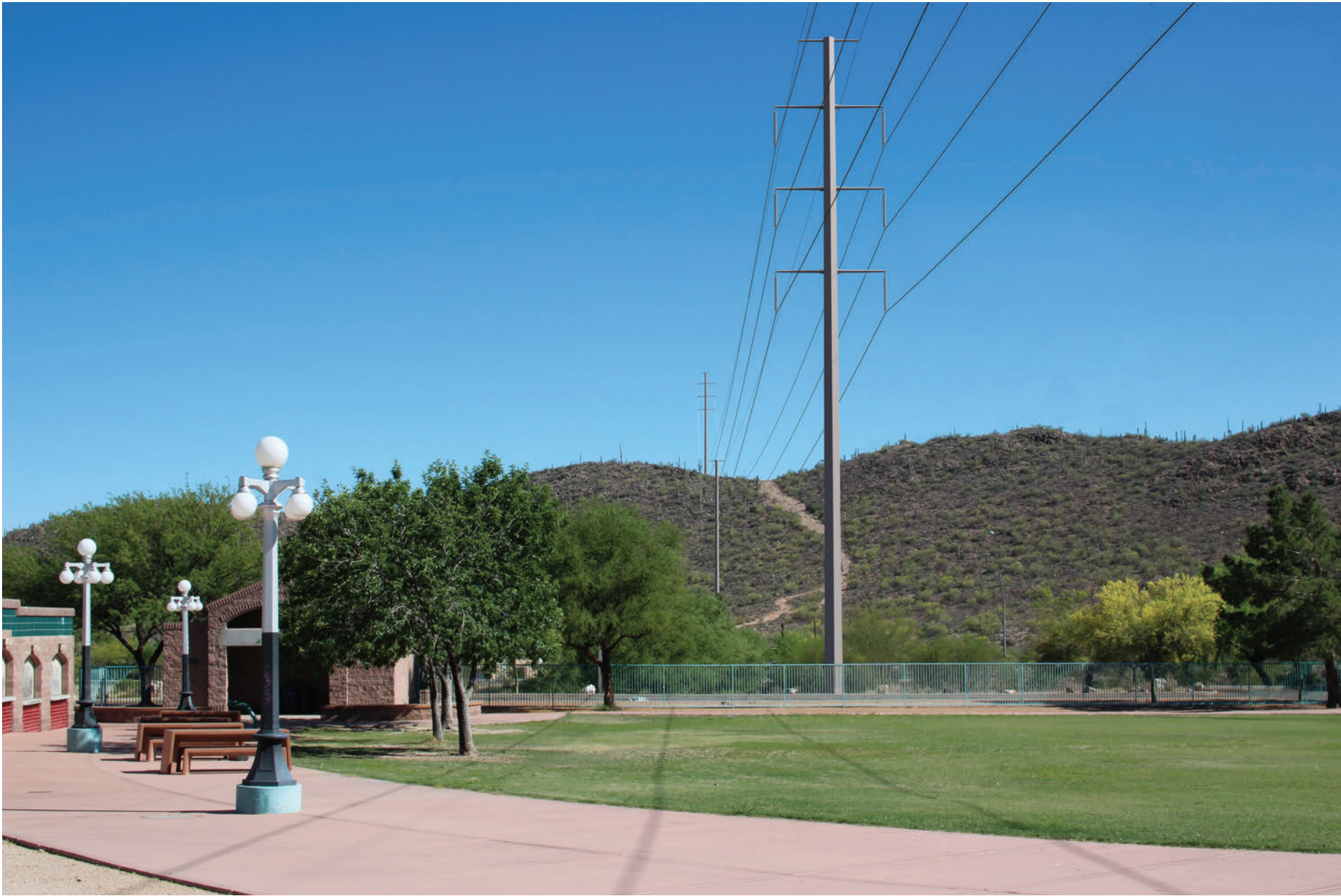
B. KOP U3-10. Simulated view toward the representative ROW from an outdoor amphitheatre within Kennedy Park Fiesta Area, a Tucson City park.