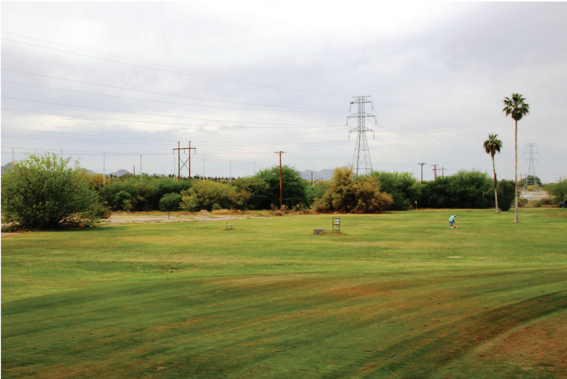
KOP U3-16. Existing view toward the representative ROW from Silverbell Golf Course, a Tucson City public golf course.