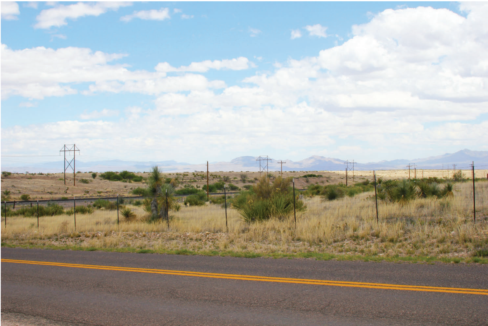
KOP H-02. Existing view toward the representative ROW from a rural residential area north of Mescal.