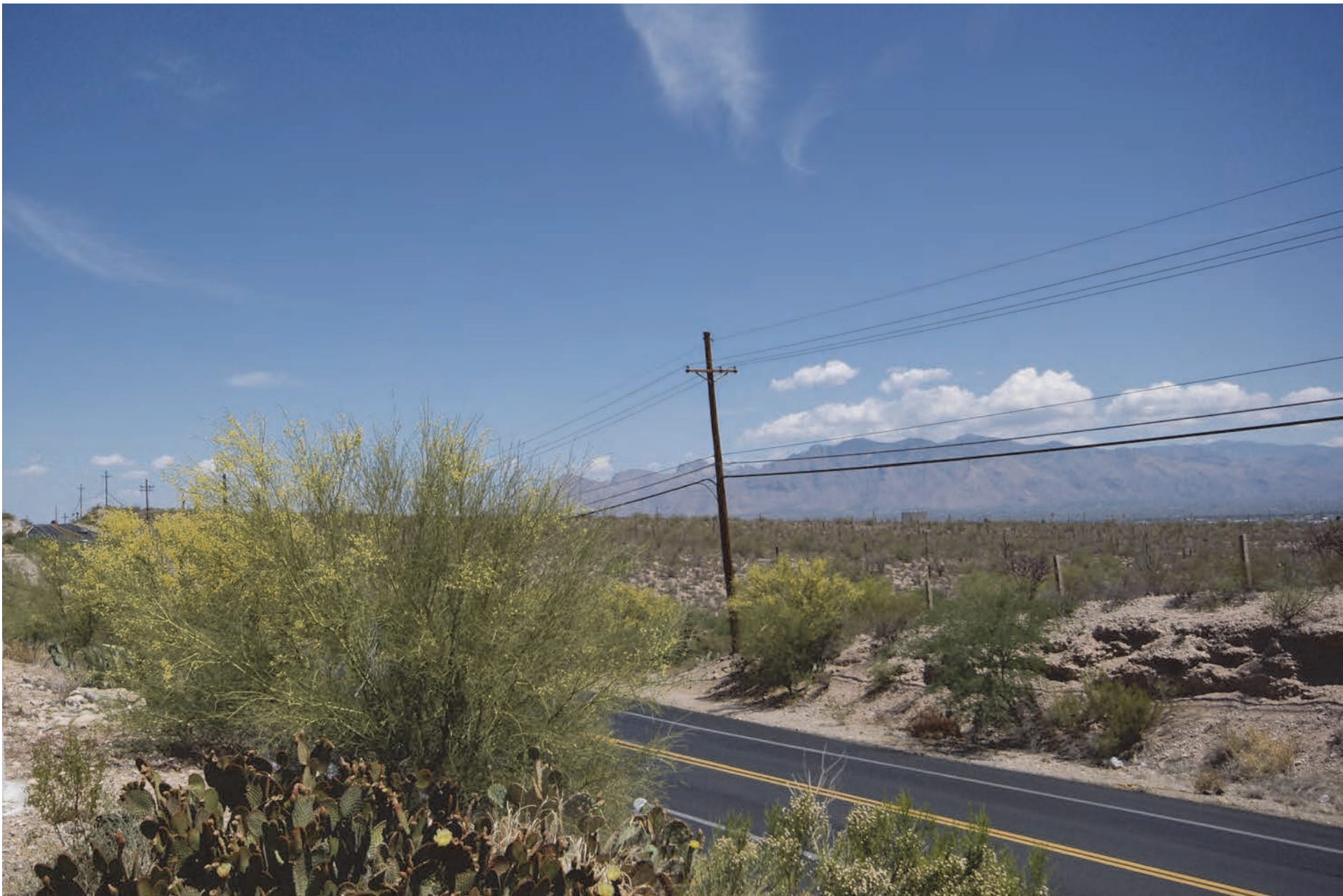
A. KOP TH1-S6. Existing view facing north toward the representative ROW (Segment TH1a) from North Greasewood Boulevard at West Broadway.