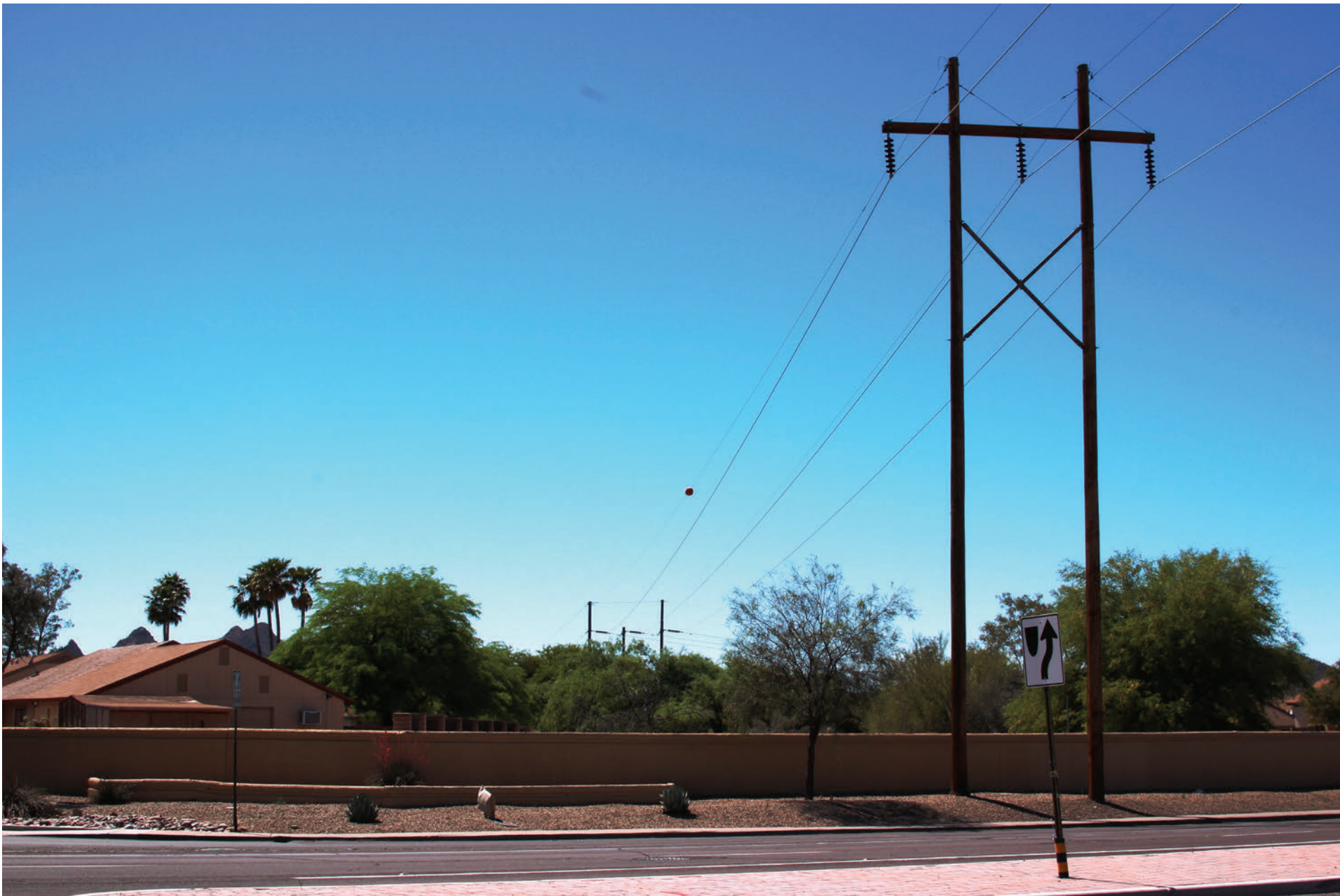
KOP U3-09. Existing view toward the representative ROW from a residential area along South Newcastle Court.