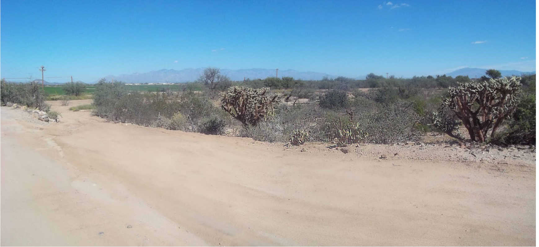
A. KOP U3-07a. Existing view from San Xavier Mission oriented toward subroute U3a in the Upgrade Section.