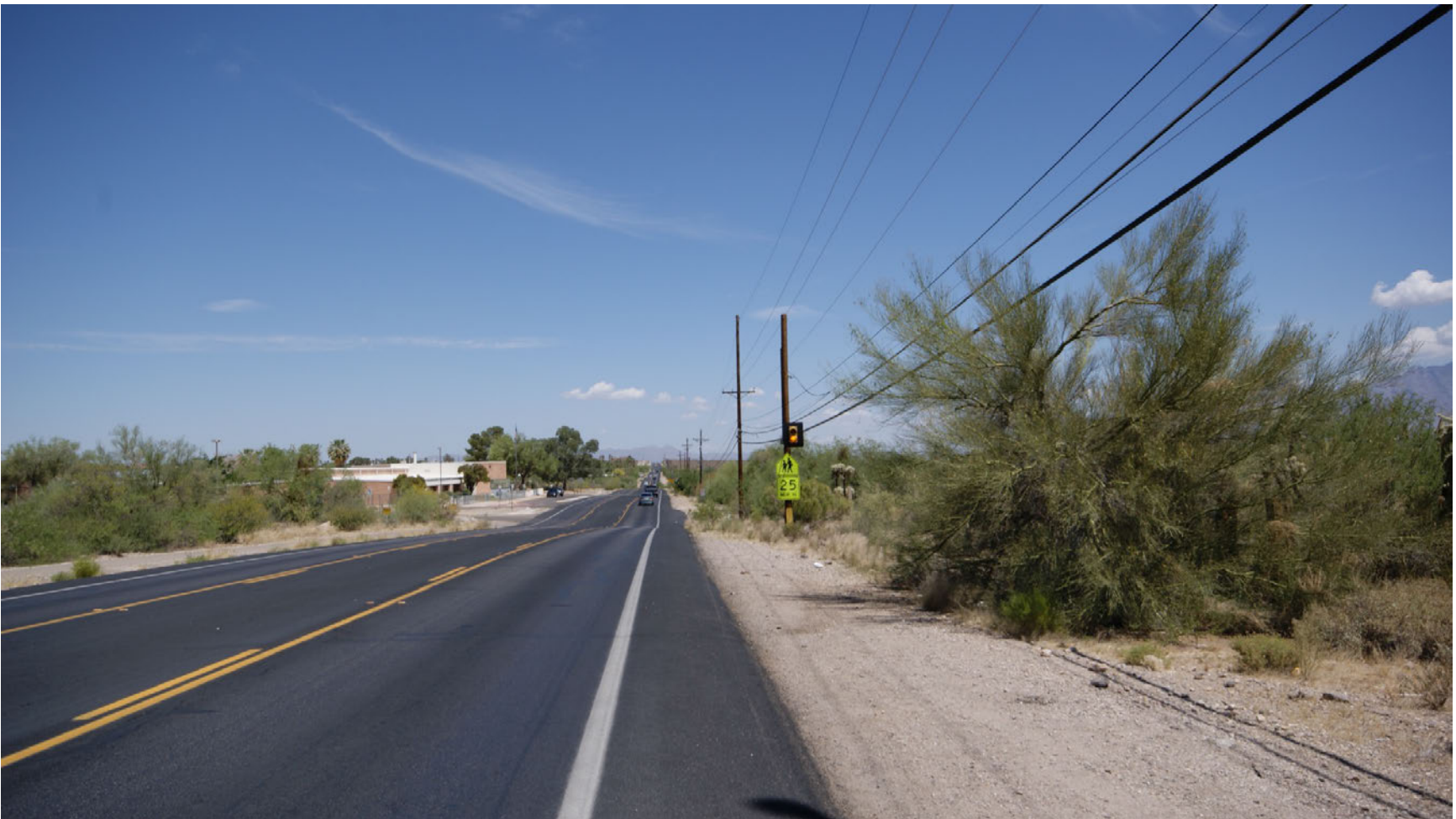
KOP TH1-S4. Existing view along Greasewood Road just south of the Tolson Elementary School, providing view of local alternative that would run along Greasewood Road to avoid the Tumamoc Hill area.