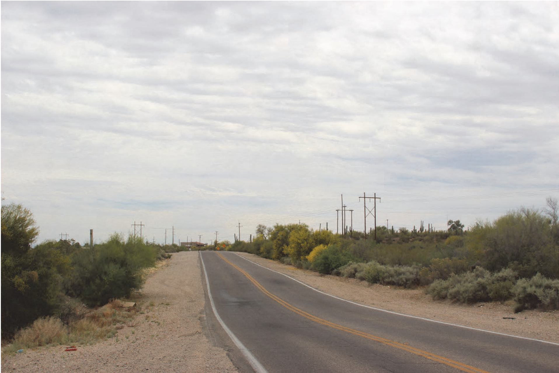
A. KOP U3-18. Existing view toward the representative ROW (Segment U3i) from Juan Bautista de Anza National Historic Trail along North Silverbell Road near North Abington Road.