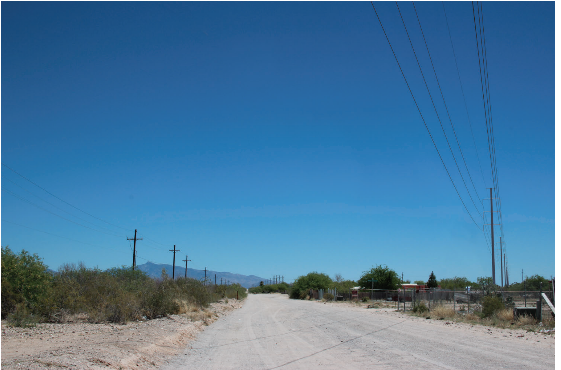
B. KOP U3-06. Simulated view toward the representative ROW from a residential area near the intersection of East Old Vail Highway and South Broken Cactus Way.