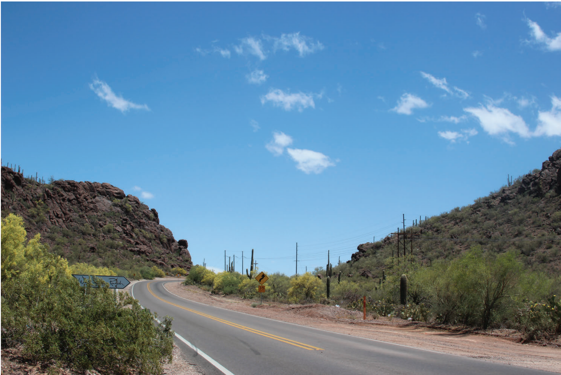
A. KOP U3-22. Existing sensitive view toward the representative ROW along West Twin Peaks Road, northwest of Rattlesnake Ridge.