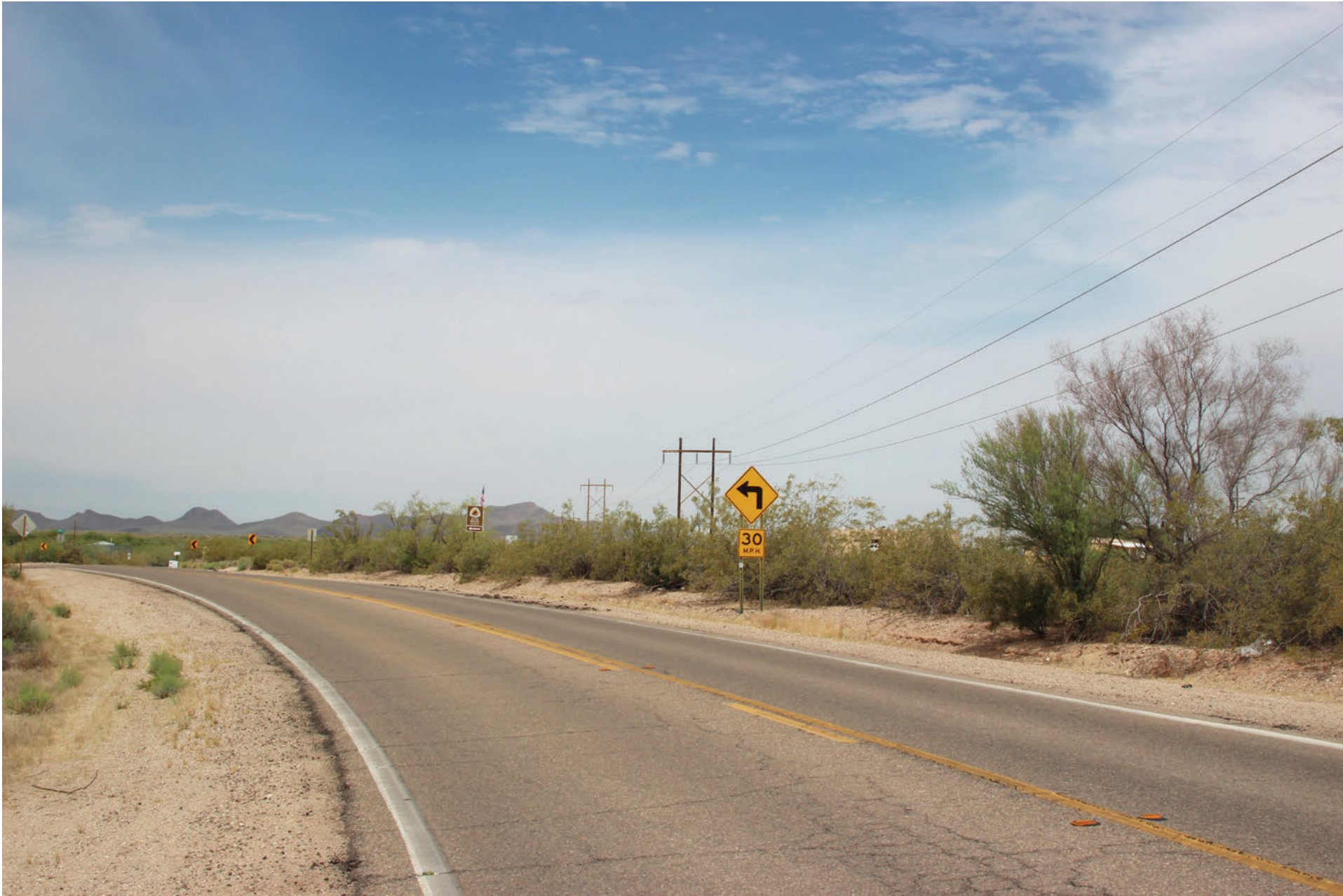
A. KOP U3-23. Existing view toward the representative ROW from a rural residential area along Silverbell Road historic auto route.