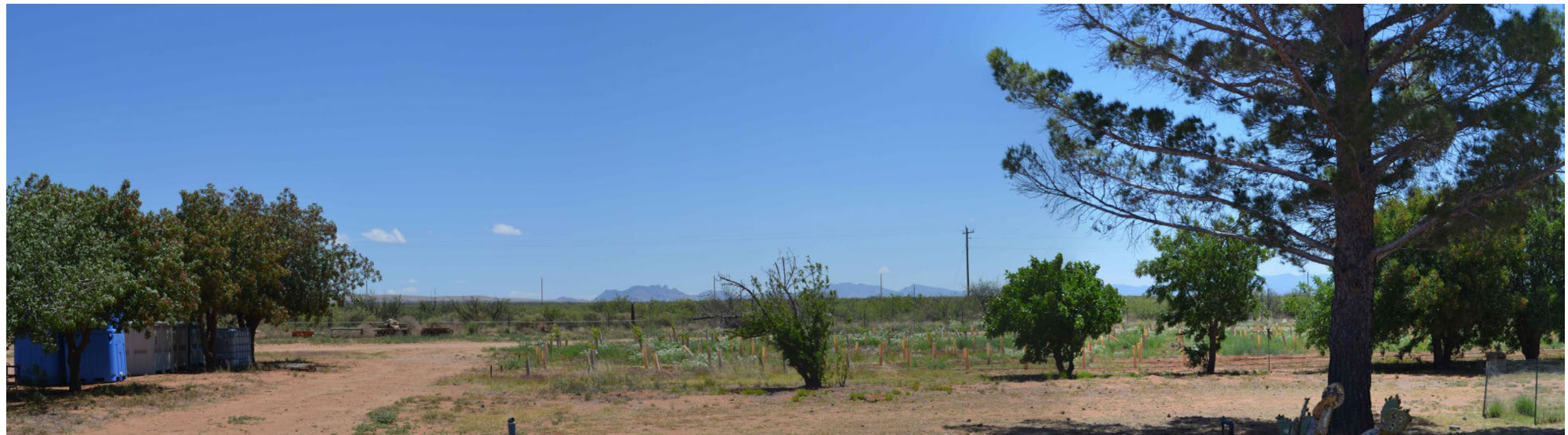
B. KOP WB-02. Simulated view toward route variation P7a from grounds of the Pillsbury Winery Tasting Room