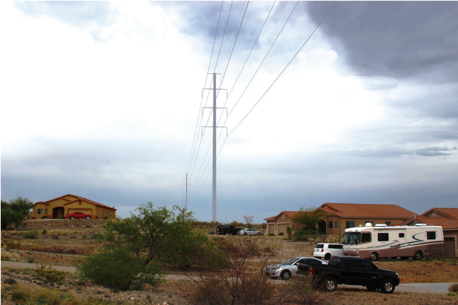
B. KOP U3-04. Simulated view toward the representative ROW from New Tucson area near south Sonoita Ranch Circle residential area.