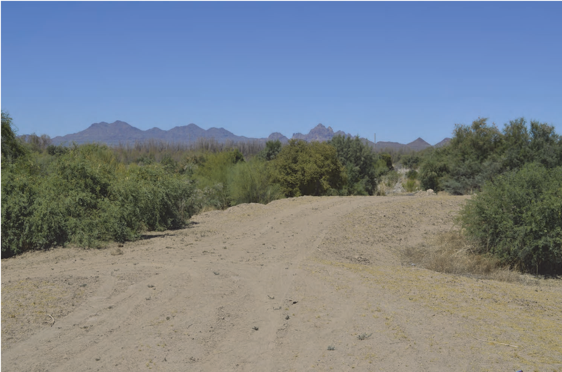
B. KOP AN-12. Simulated view toward the representative ROW (Segment U3k) from North Aguirre Road west of Pinal Airpark along a portion of a planned recreational trail.