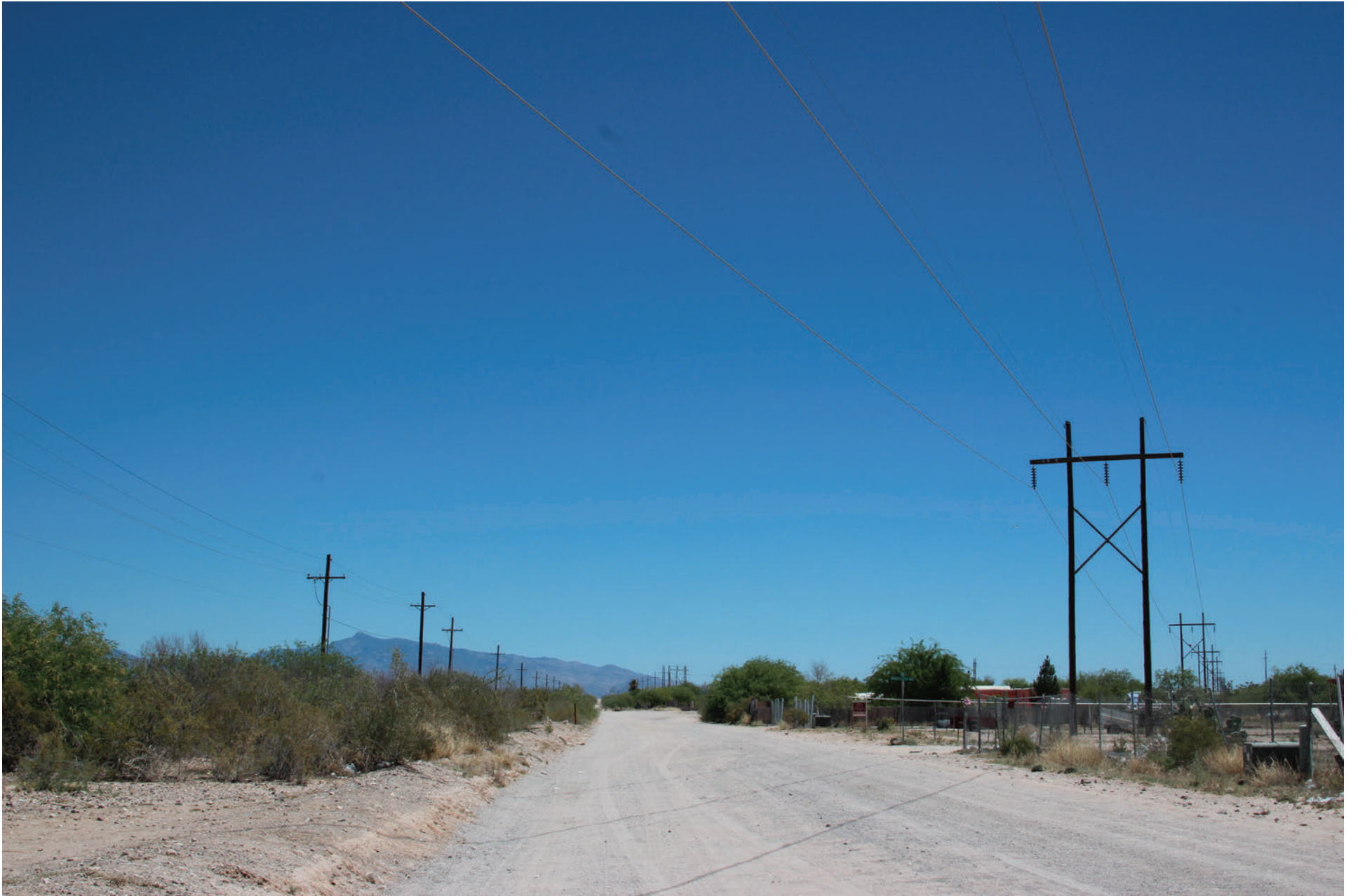
A. KOP U3-06. Existing view toward the representative ROW from a residential area near the intersection of East Old Vail Highway and South Broken Cactus Way.