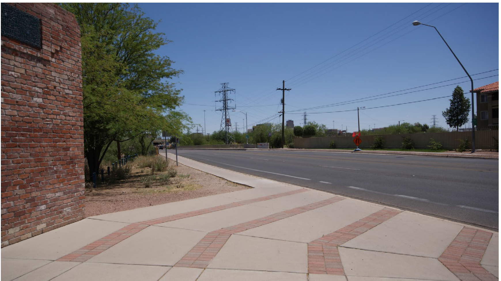
KOP TH3-R2. Existing view toward the representative ROW from the Loop on the Santa Cruz River Bikeway.