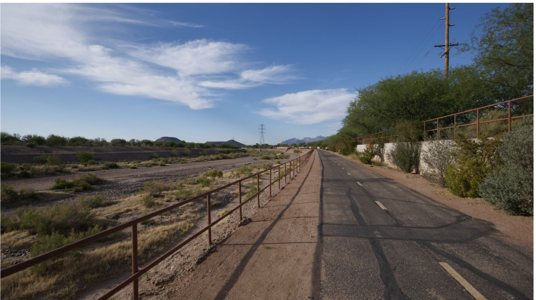
KOP TH3-R4. Existing view toward the representative ROW from the Loop on the Santa Cruz River Bikeway.