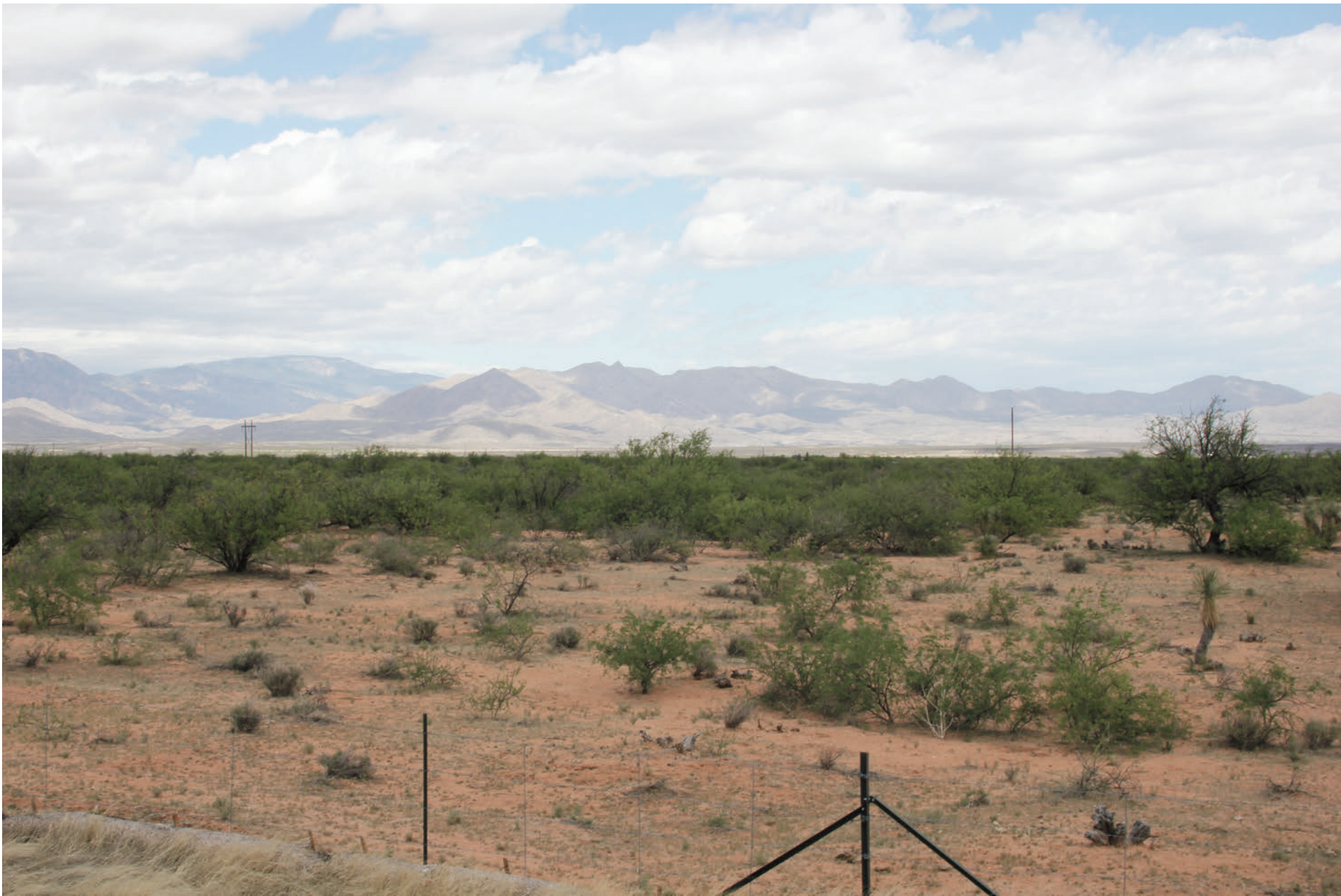
KOP U2-02. Existing unobstructed view toward the representative ROW from a future residential development, taken from a newly constructed roadway.