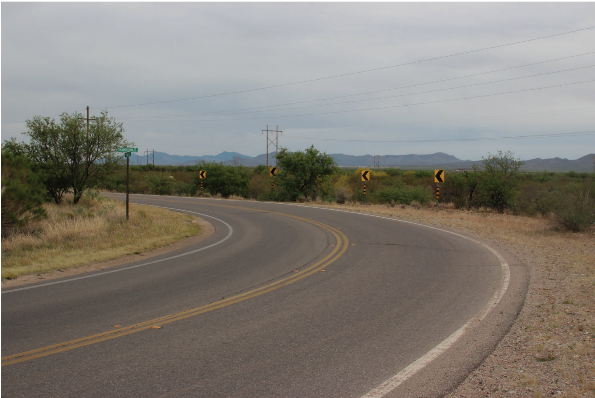
KOP U3-05. Existing view toward the representative ROW from the southwest corner of the Pima County Fairground complex.