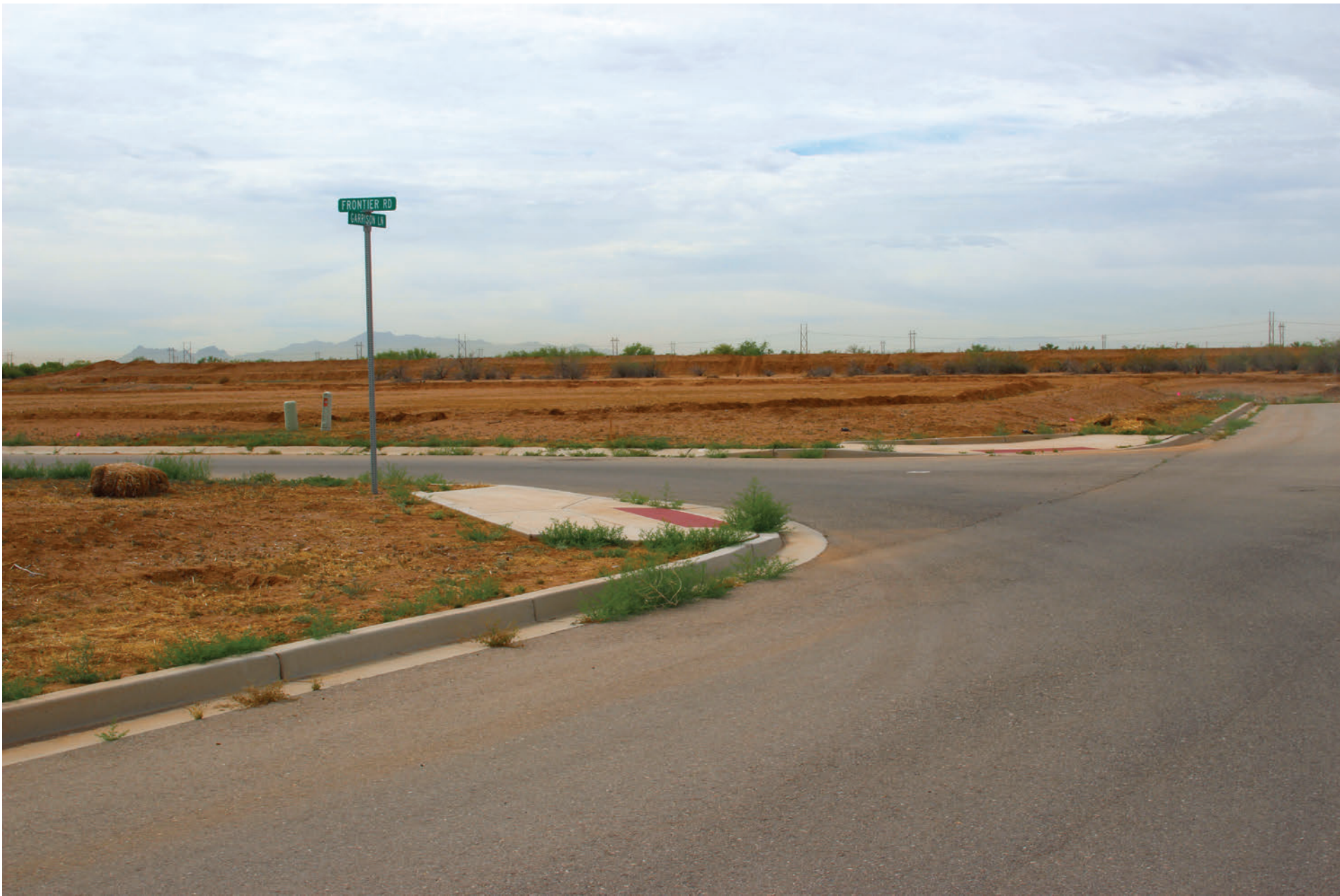
KOP U3-24. Existing view toward the representative ROW from Red Rock residential area in Pima County.