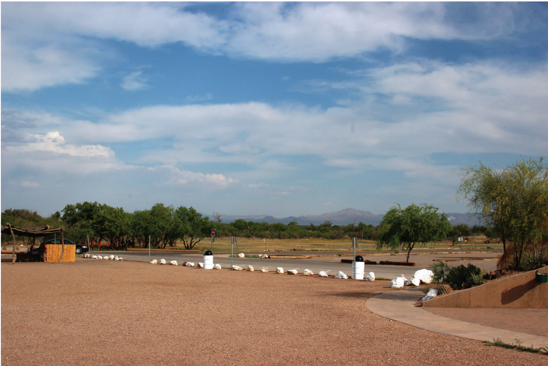
KOP U3-07. Existing view toward the representative ROW from tribal land near San Xavier Mission.