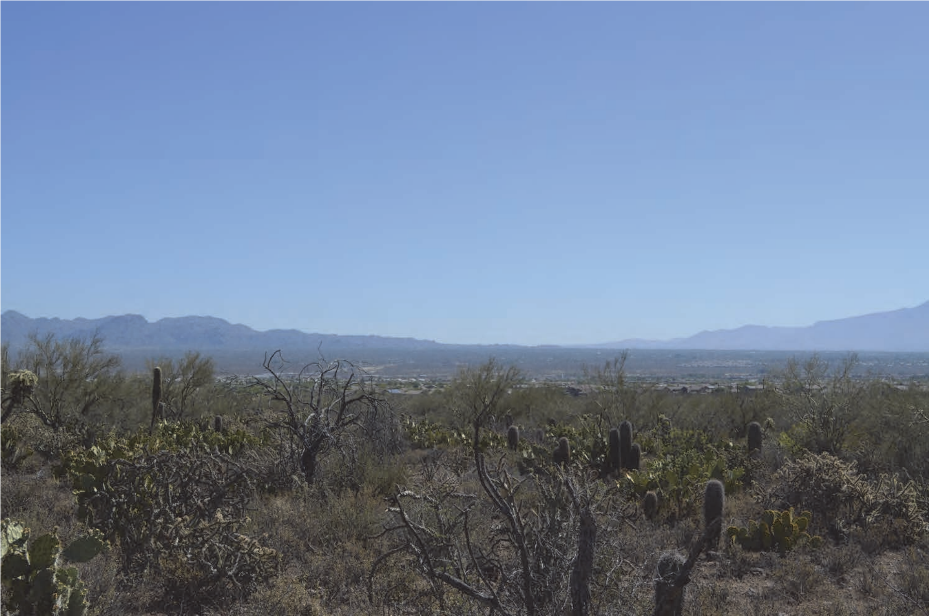
A. KOP SA-01. Existing view toward the representative ROW (Segment U3i) from the western portion of Saguaro National Park.