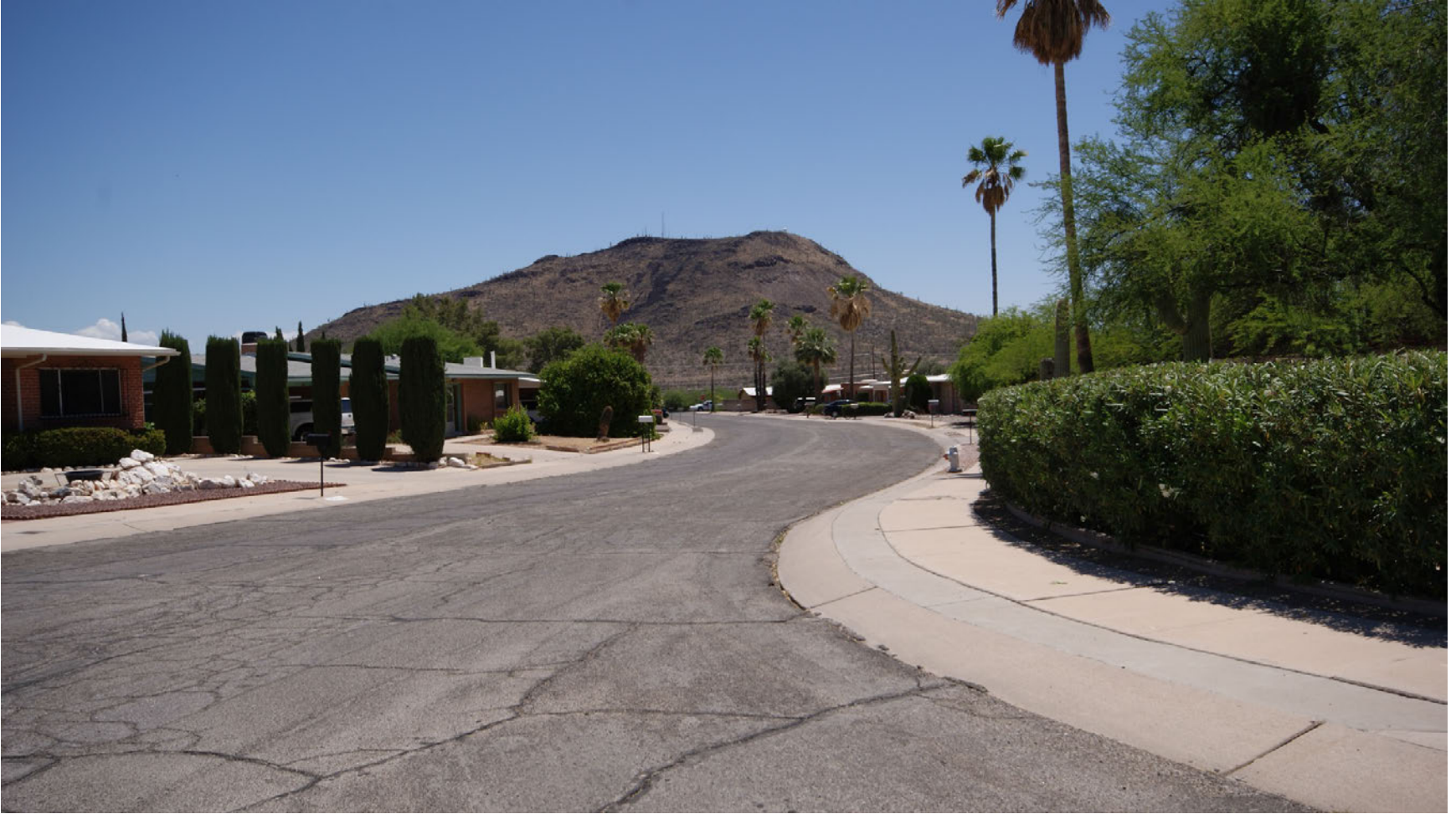
KOP TH1-S5. Existing view from residential area (West Calle Tonalá) just west of Greasewood Road toward Tumamoc Hill and the local alternative that would avoid Tumamoc Hill.