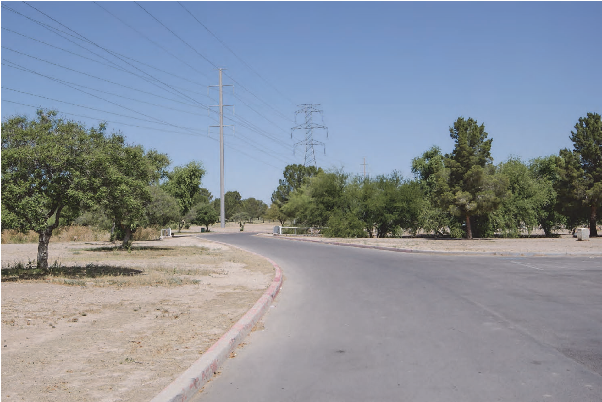
B. KOP AN-04. Simulated view toward the representative ROW (Segment U3i) from Christopher Columbus Park.