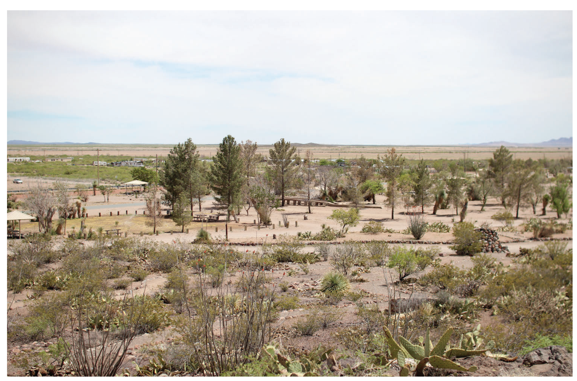
A. KOP S5-02. Existing view toward the representative ROW from an elevated view within Pancho Villa State Park near Columbus.