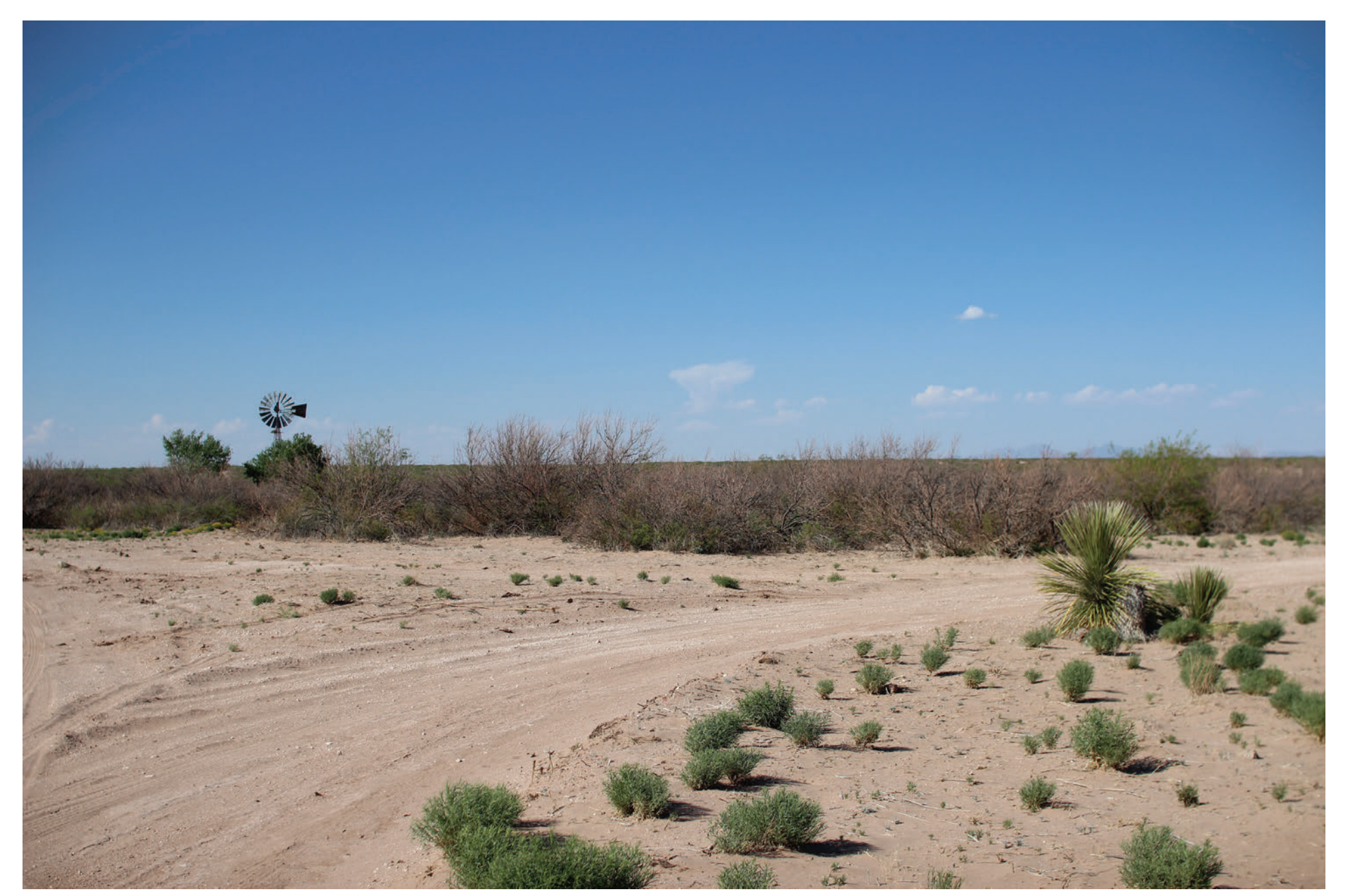
KOP A-01. Existing view toward the representative ROW crossing from County Road A15, within Phillips Hole.

FIGURE B-17 KOP A-01. View from County Road A15 Southline Transmission Project