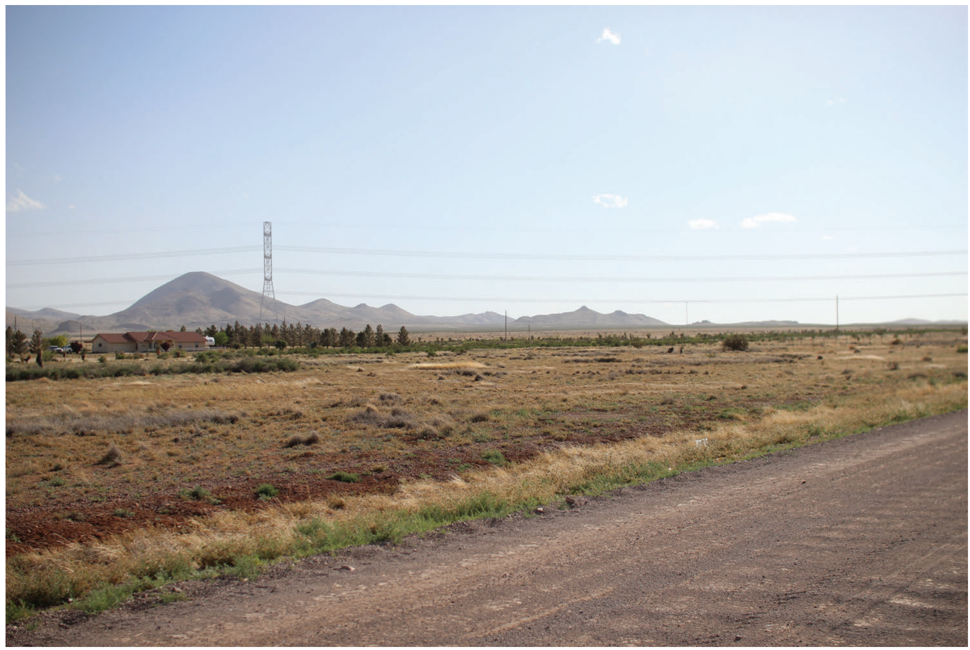
B. KOP D-02. Simulated view toward the representative ROW looking toward Pyramid Mountains from a rural residential area near Lordsburg.

FIGURE B-34 KOP D-02. View from Eastern Outskirts of Lordsburg Southline Transmission Project