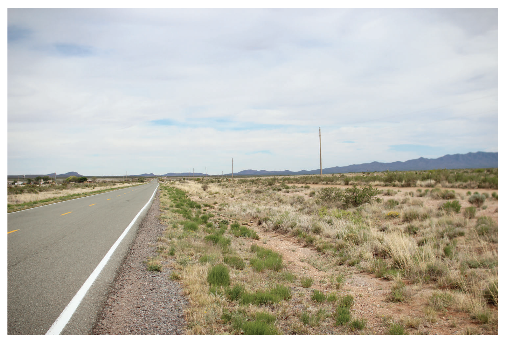
KOP S7-01. Existing view toward the representative ROW paralleling Highway 9 within Hachita Valley.

FIGURE B-26 KOP S7-01. View from Hachita Valley Southline Transmission Project