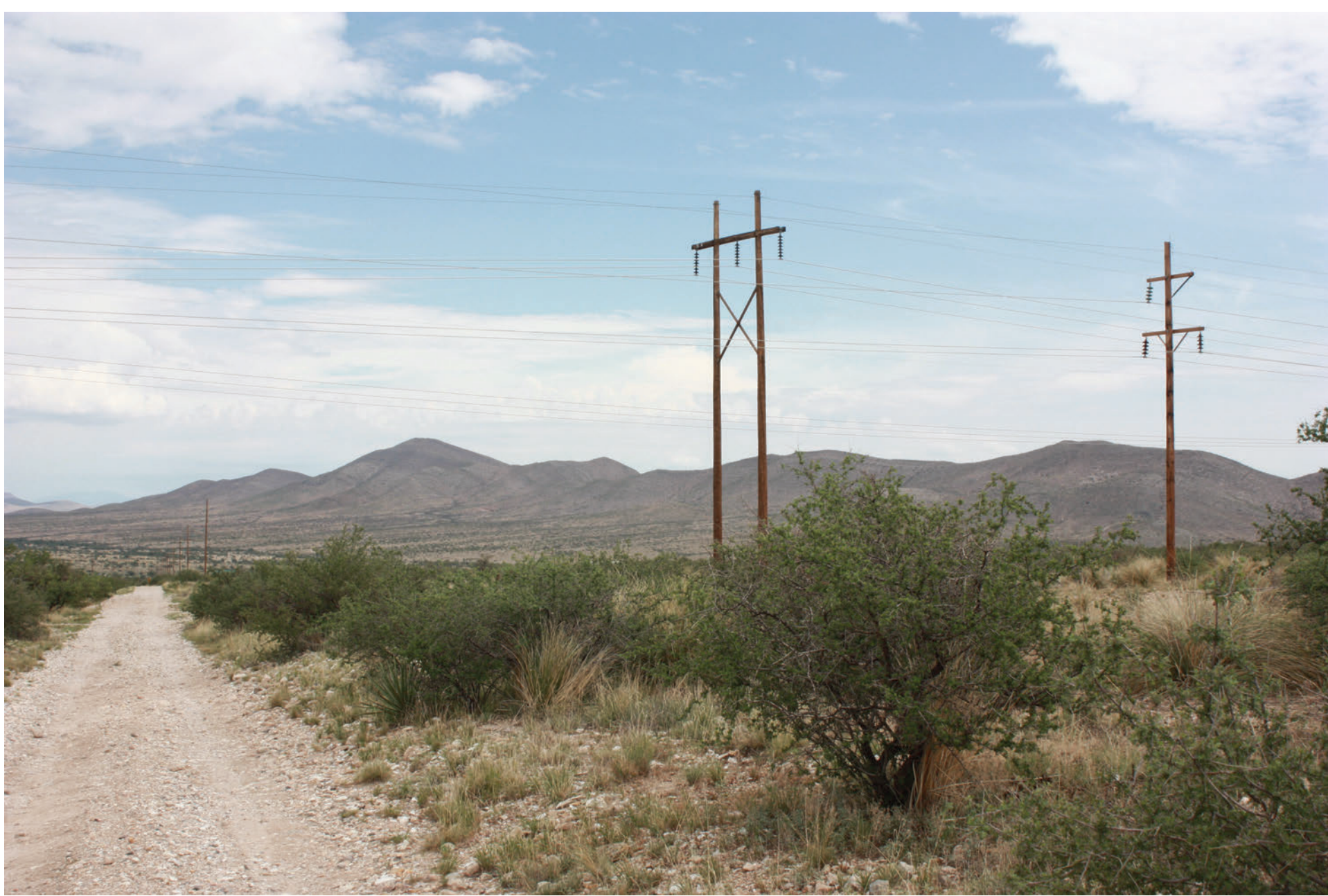
A. KOP U1-01. Existing view toward the representative ROW from the northwest corner of Coronado National Forest.