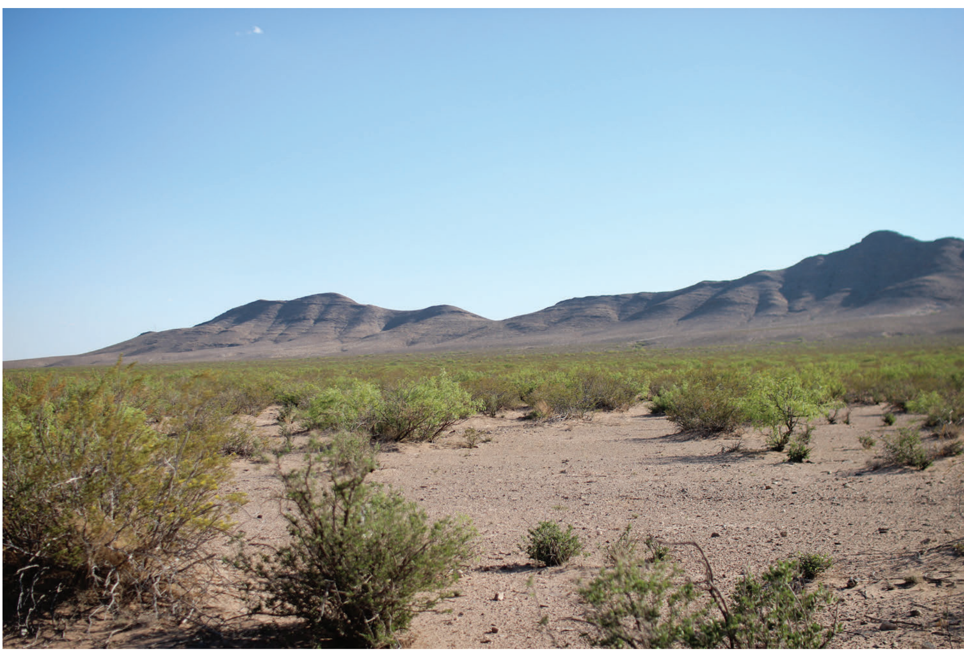
A. KOP S2-01. Existing view toward the representative ROW from County Road A16.