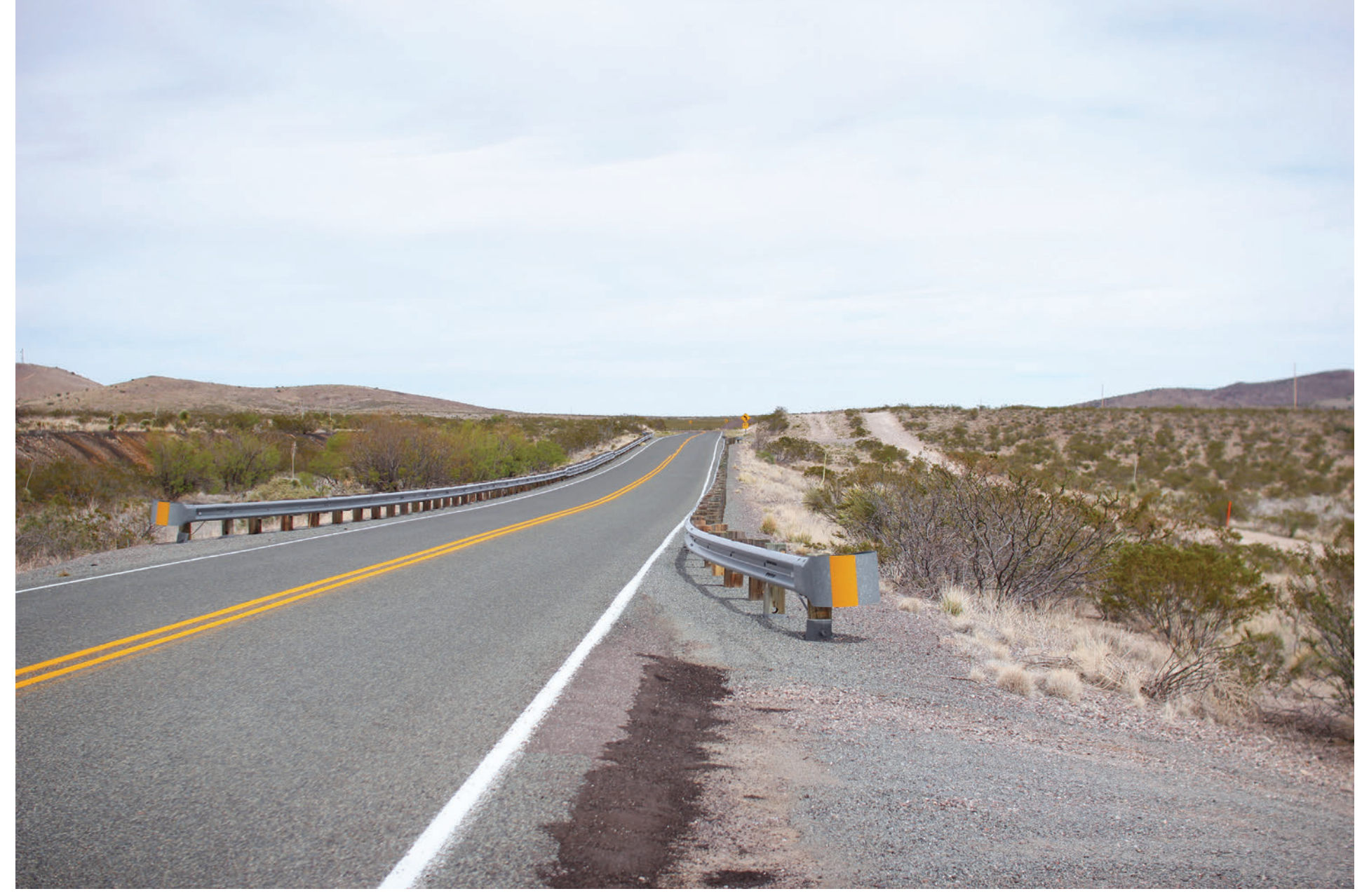
KOP C-01. Existing view toward the representative ROW from eastern Hachita Valley toward the southern extent of the Cedar Mountains.

FIGURE B-25 KOP C-01. View from Hachita Valley Southline Transmission Project