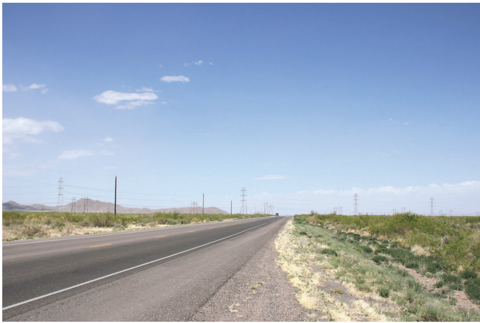
B. KOP P2-05. Simulated view toward the representative ROW traveling northeast on Highway 26.

FIGURE B-6 KOP P2-05. View from Highway 26 Southline Transmission Project