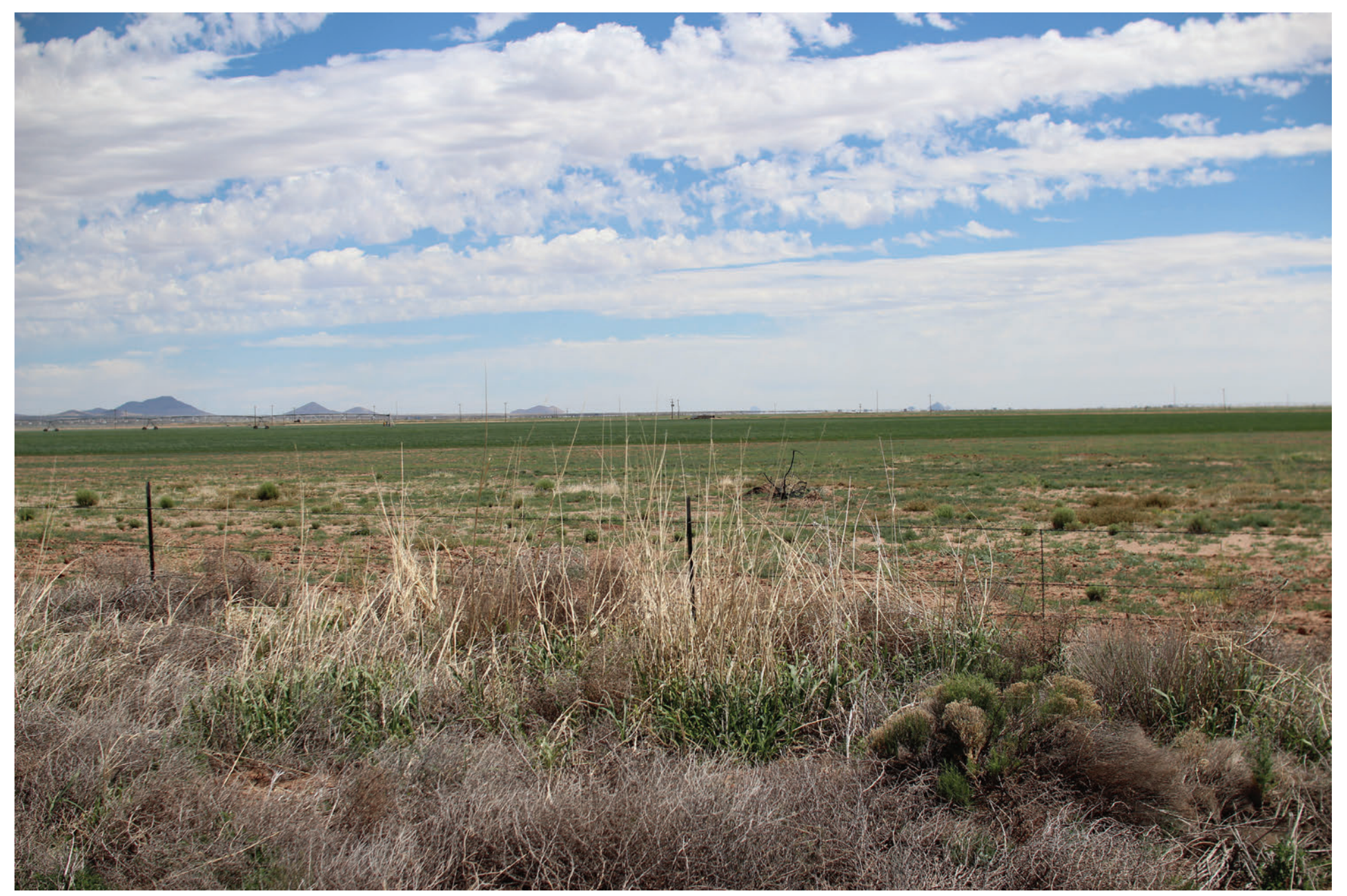
KOP S8-02. Existing view toward the representative ROW from farmlands within Lordsburg Valley.

FIGURE B-32 KOP S8-02. View from Lordsburg Valley Farmland Southline Transmission Project