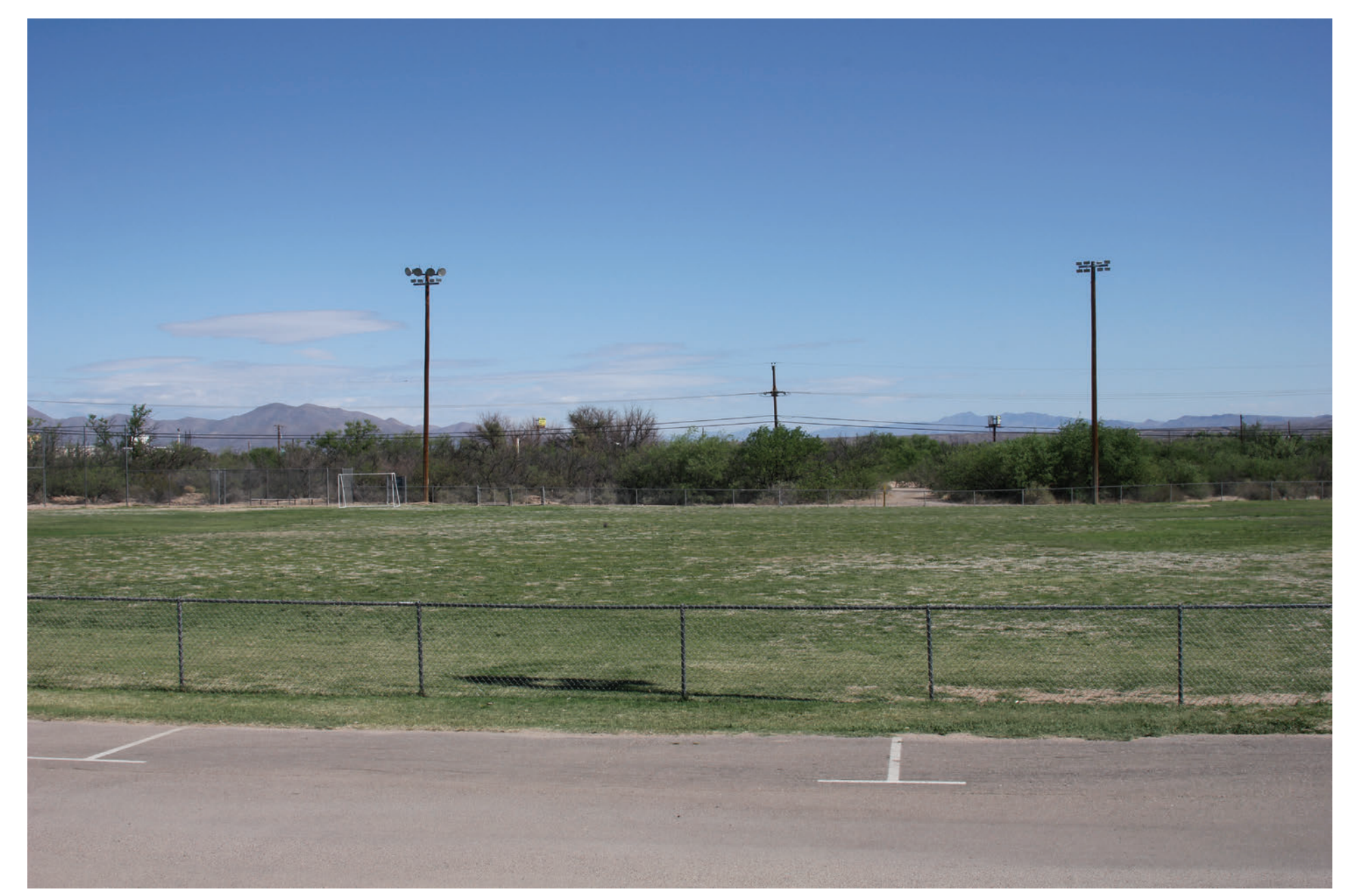
KOP U2-01. Existing view toward the representative ROW from multi-use recreational fields in the City of Benson.

FIGURE B-51 KOP U2-01. View from City of Benson Park Southline Transmission Project