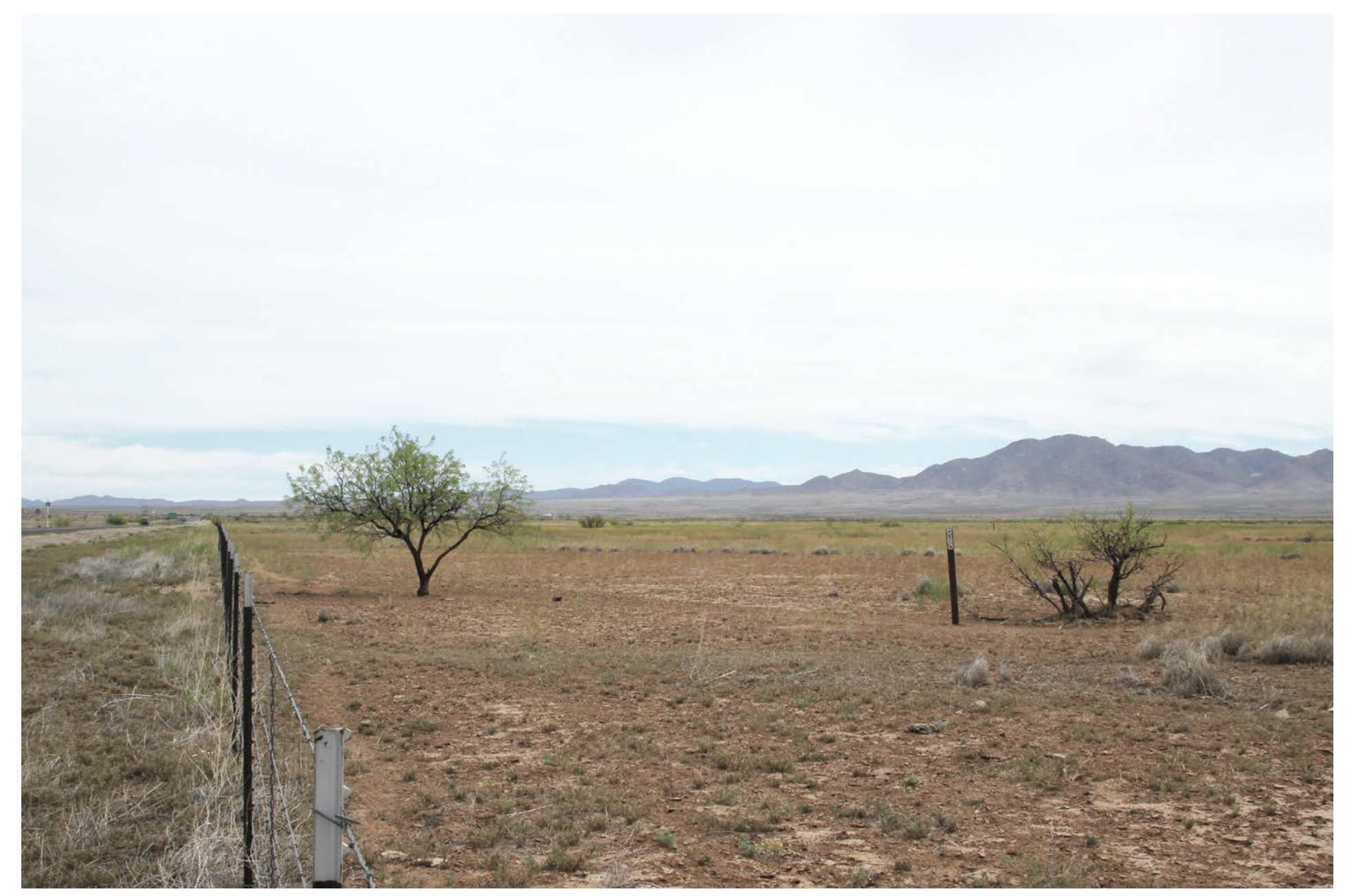
KOP P4-01. Existing view toward the representative ROW from the Continental Divide Trail along Highway 90.

FIGURE B-12 KOP P4-01. View from Continental Divide Trail Southline Transmission Project