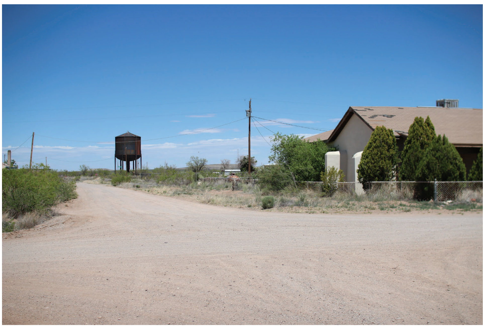
A. KOP S7-02. Existing view toward the representative ROW from within the community of Hachita.