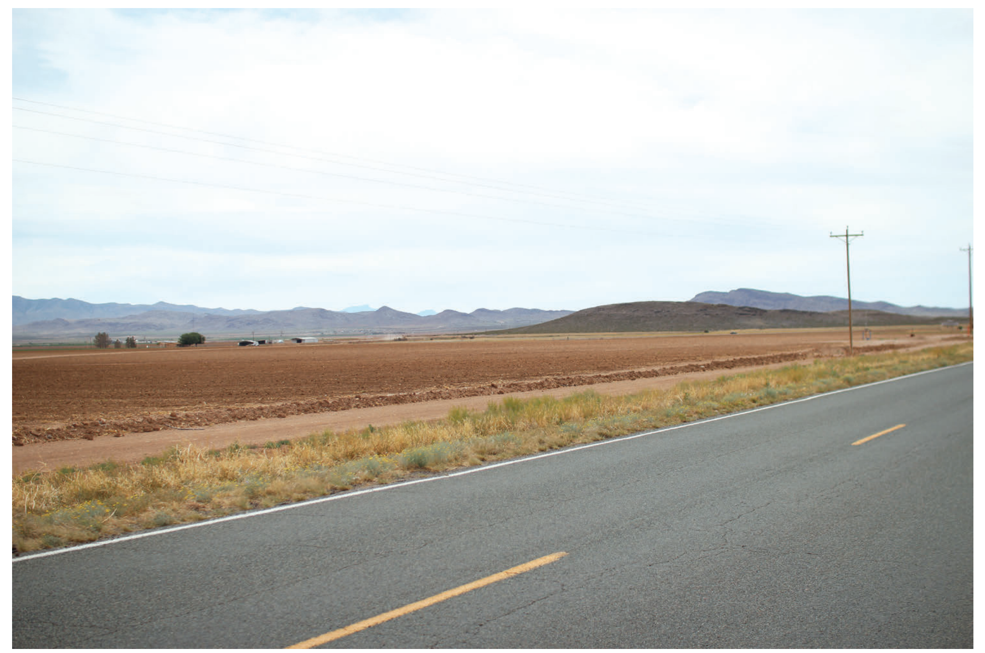
KOP S5-03. Existing view toward the representative ROW traveling along Highway 9.

FIGURE B-23 KOP S5-03. View from Highway 9 Southline Transmission Project