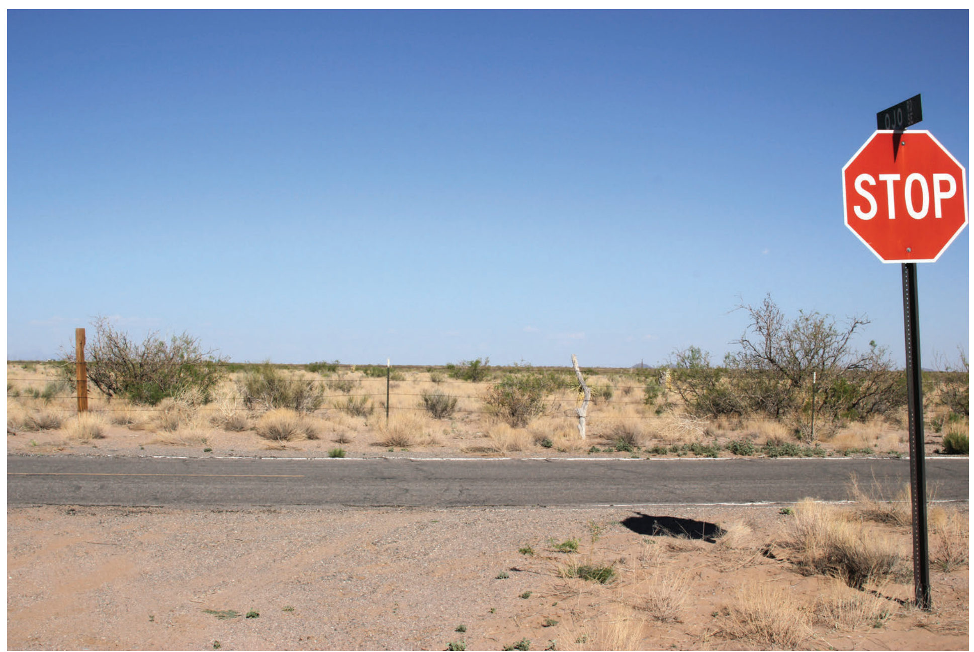
A. KOP P3-01. Existing view toward the representative ROW from rural residences along Ojo Road.