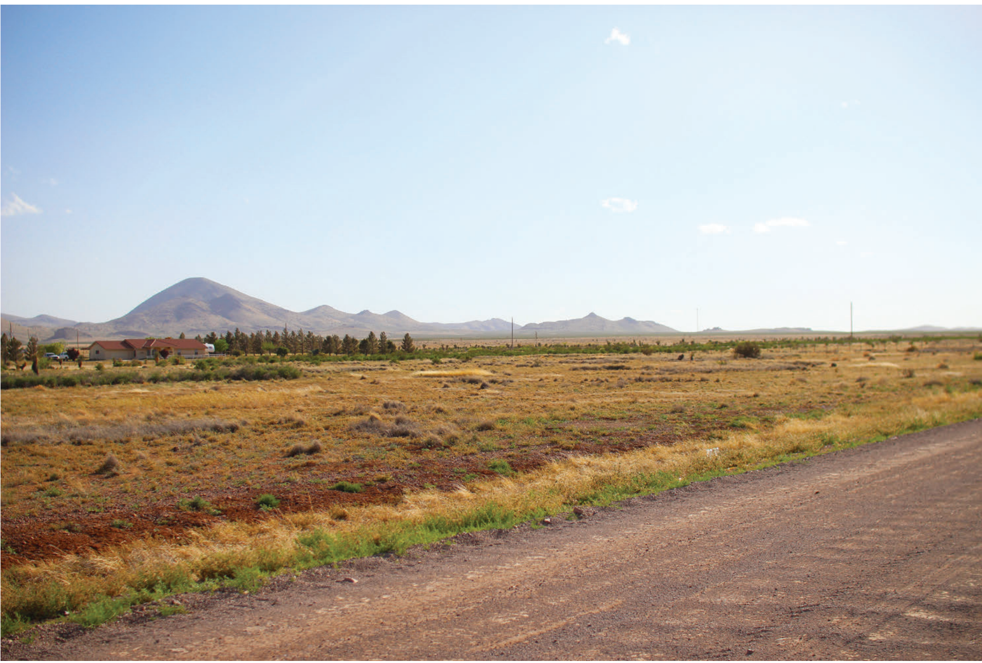
A. KOP D-02. Existing view toward the representative ROW looking toward Pyramid Mountains from a rural residential area near Lordsburg.