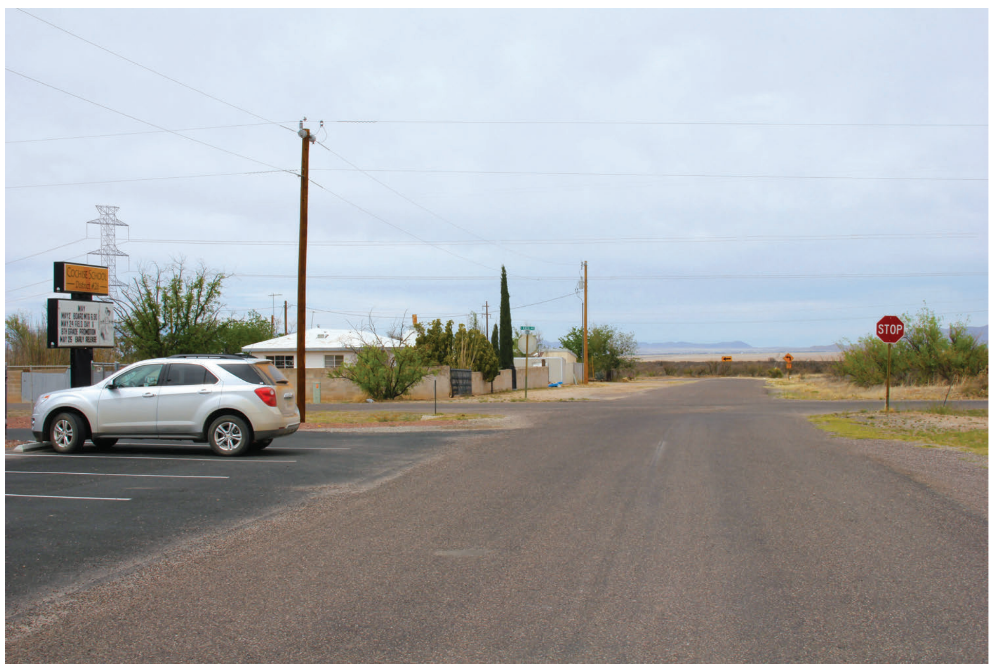
B. KOP G-03. Simulated view toward representative ROW from within the community of Cochise.

FIGURE B-49 KOP G-03. View from Community of Cochise Southline Transmission Project