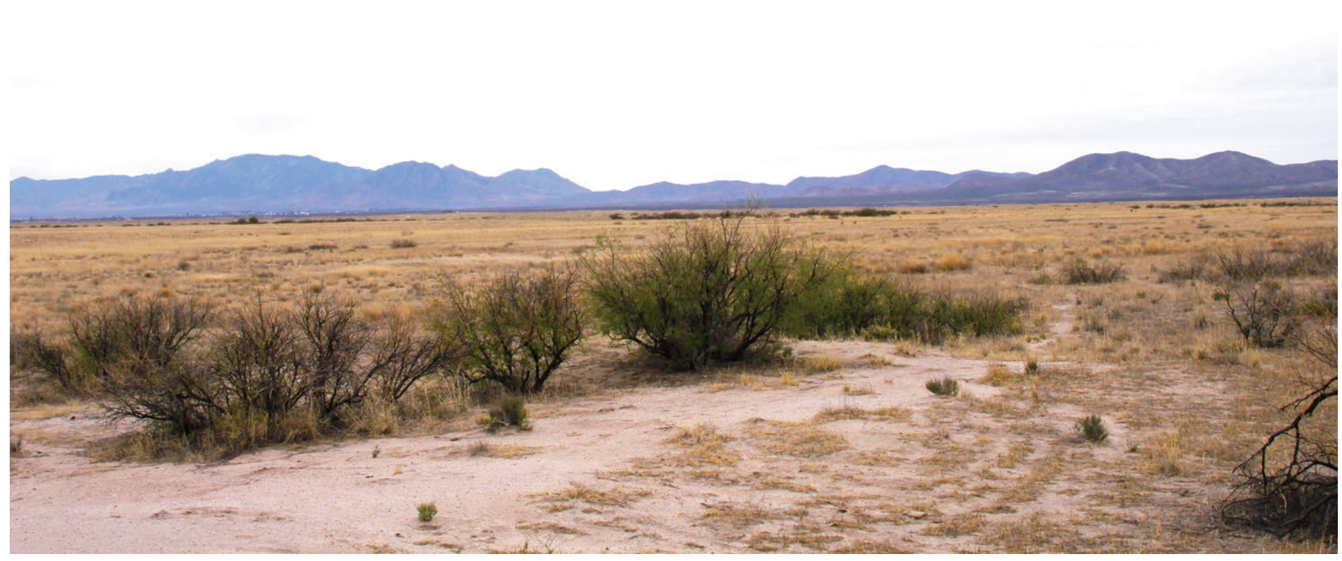
KOP G-02. Existing view toward the representative ROW from within Willcox Wildlife Area, at the gathering area for the Wings over Willcox bird-watching festival.

FIGURE B-48 KOP G-02. View from Willcox Playa Southline Transmission Project