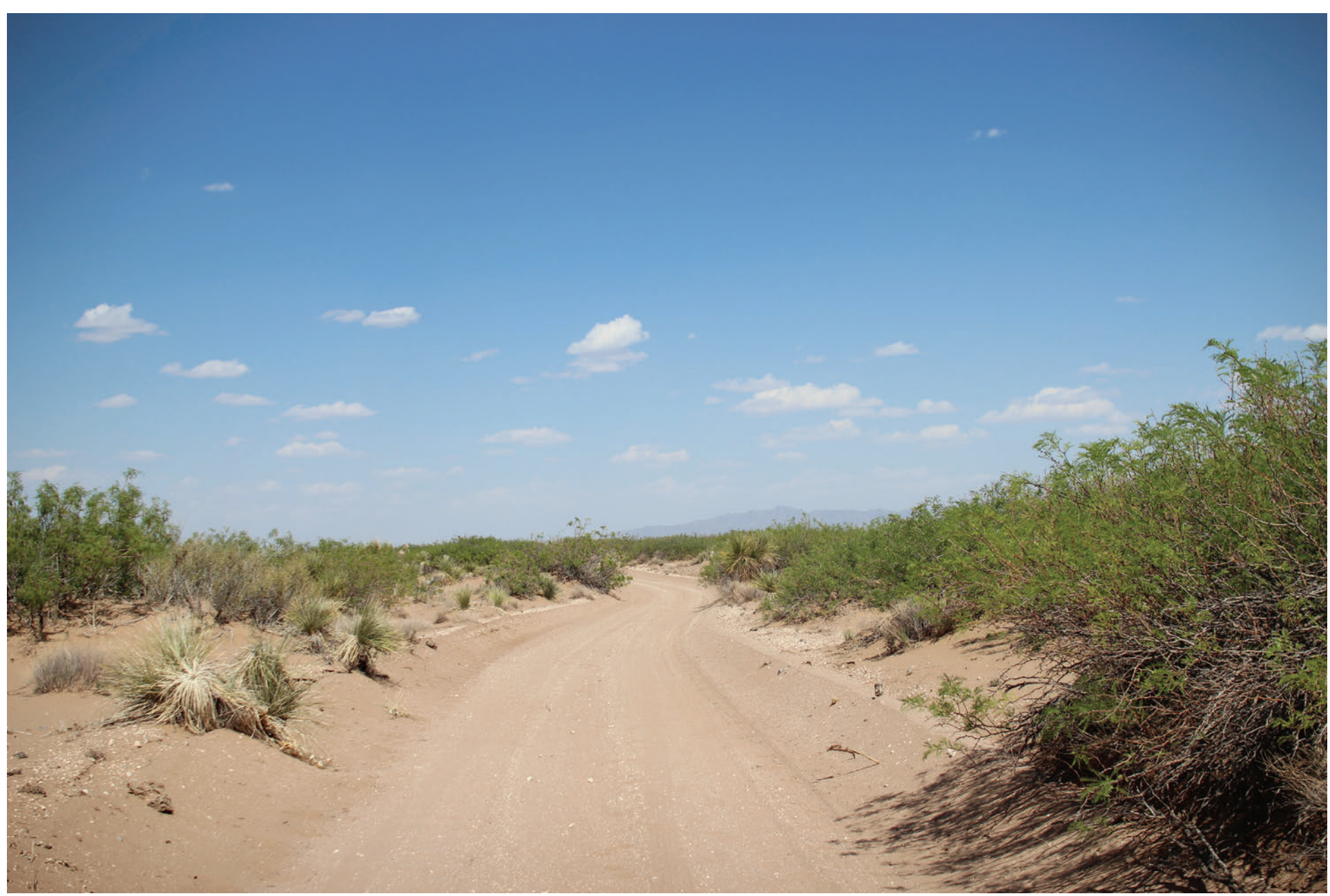
A. KOP S1-01. Existing view toward the representative ROW from County Road A11.