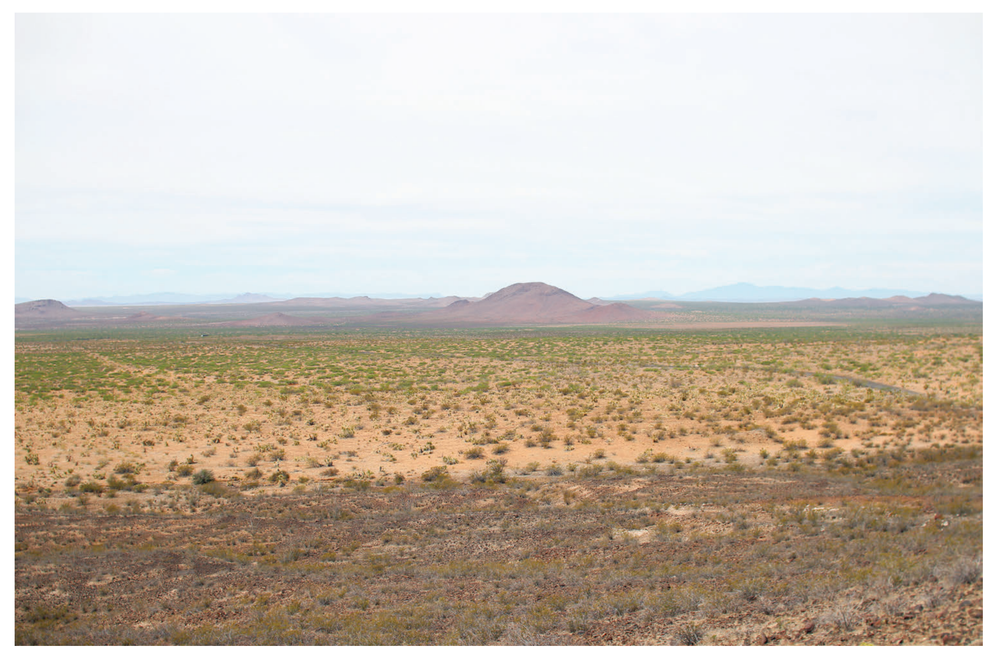
KOP B-01. Existing view toward the representative ROW from an elevated view along the international border.

FIGURE B-20 KOP B-01. View from Guzman's Lookout Southline Transmission Project