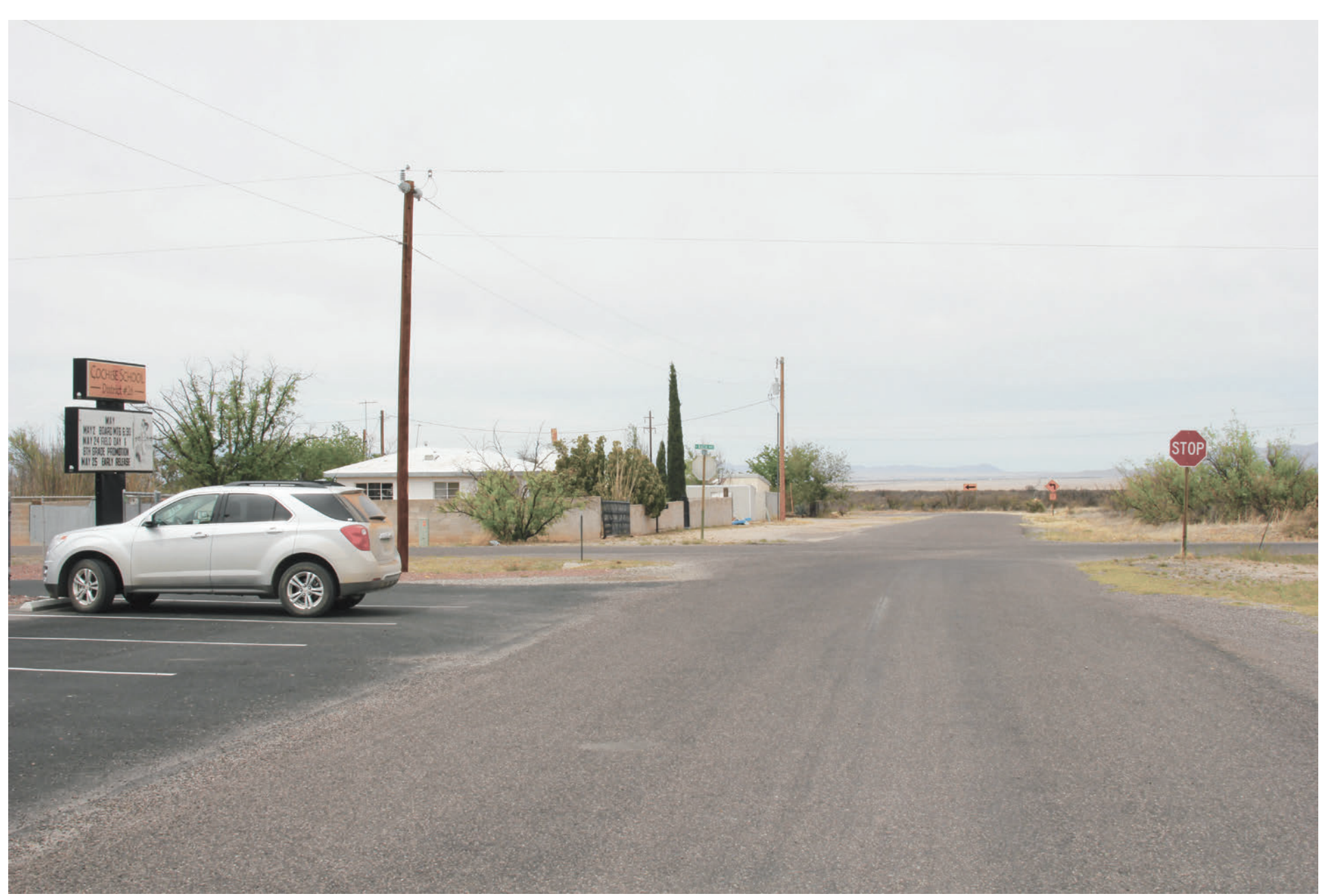
A. KOP G-03. Existing view toward representative ROW from within the community of Cochise.