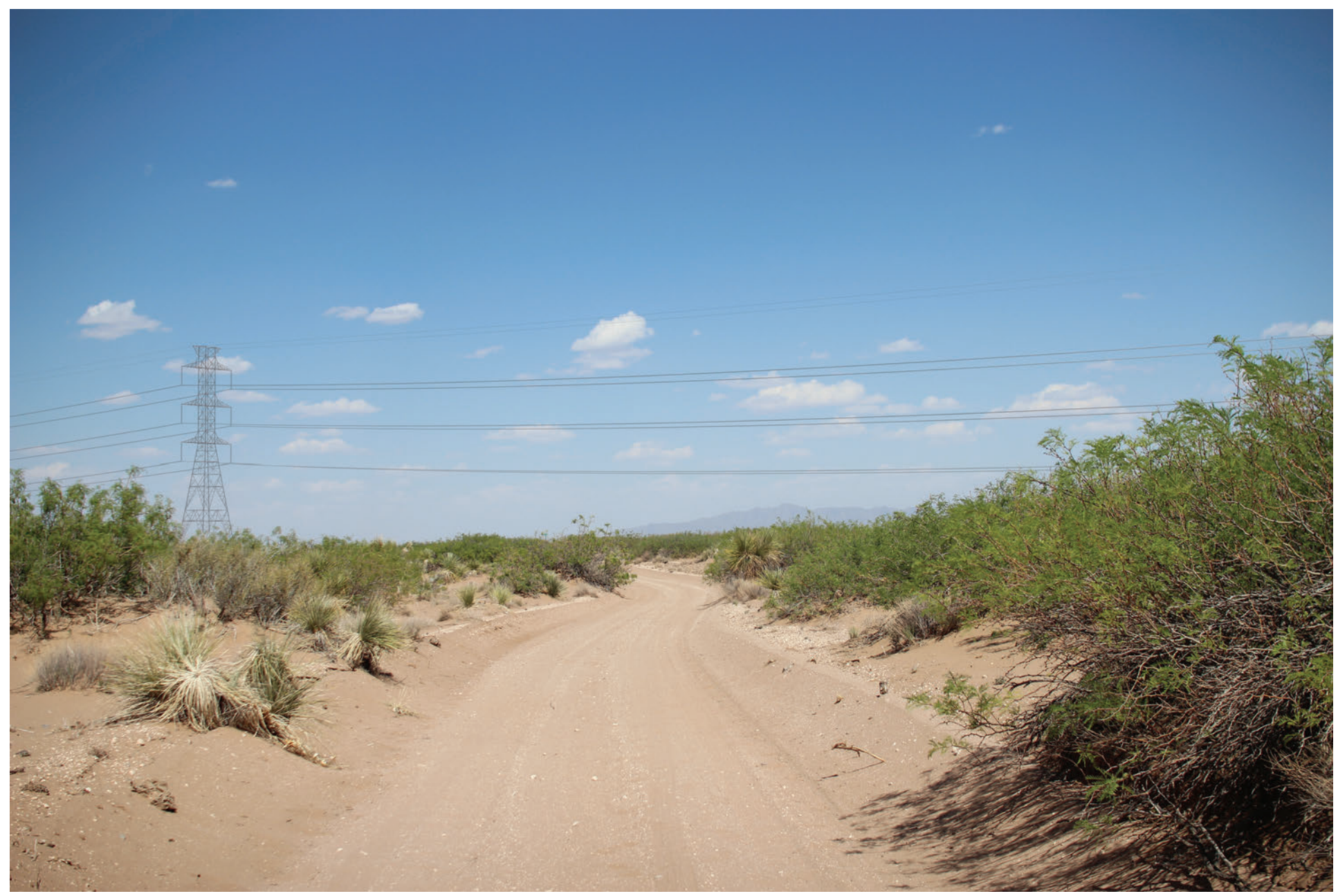
B. KOP S1-01. Simulated view toward the representative ROW from County Road A11.

FIGURE B-14 KOP S1-01. View from County Road A11 Southline Transmission Project