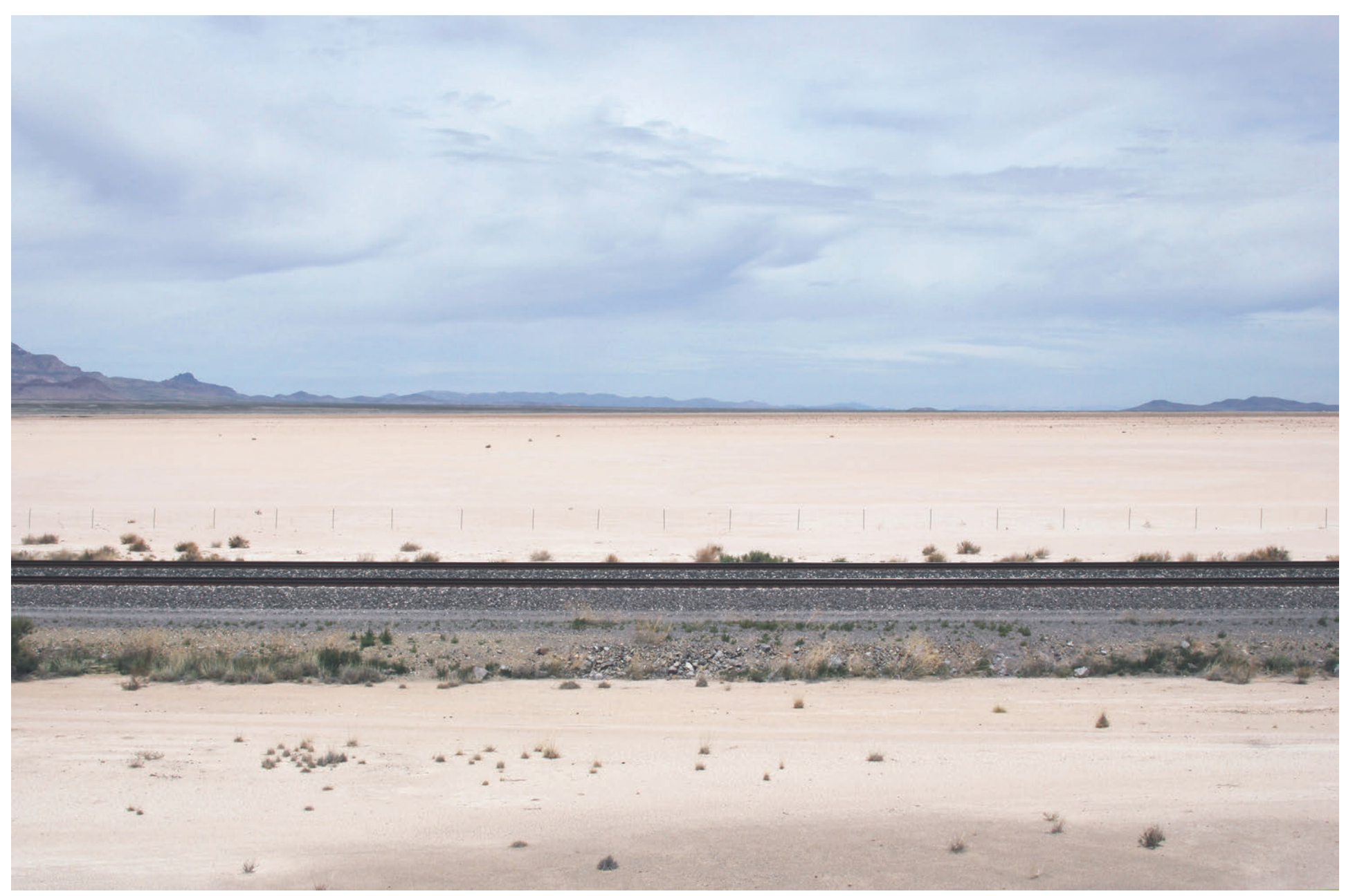
A. KOP P5-01. Existing view toward the representative ROW from I-10, across Alkali Flat, toward Peloncillo Mountains.