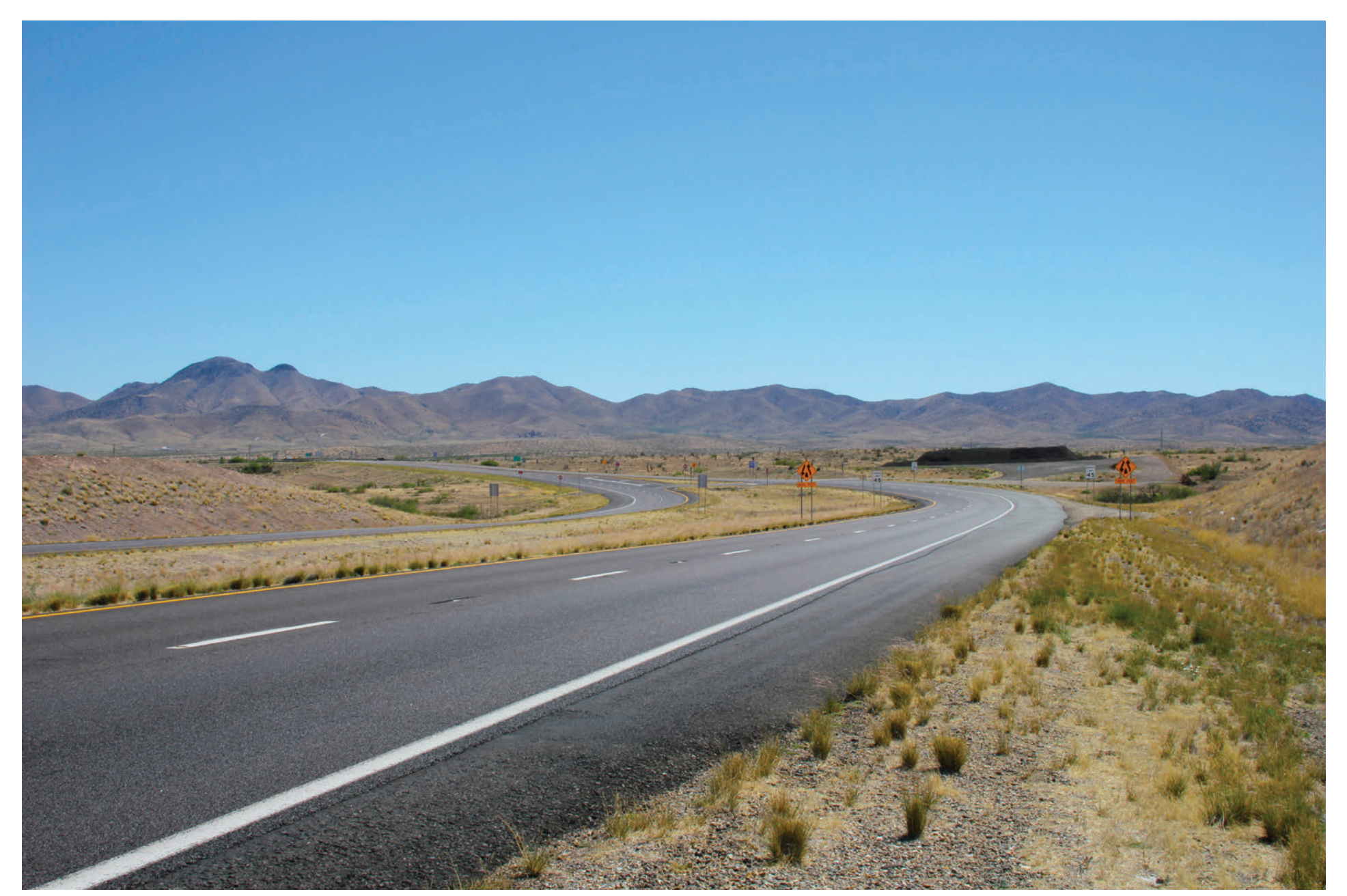
KOP F-02. Existing view toward the representative ROW from State Route 191, which provides access points north, including to Safford.

FIGURE B-43 KOP F-02. View from Arizona SR 191 Southline Transmission Project