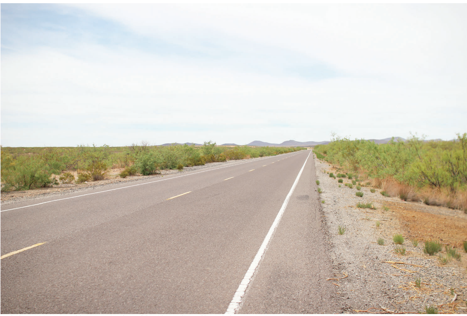
A. KOP S3-01. Existing view toward the representative ROW paralleling Highway 9, skirting Wilderness Study Area.