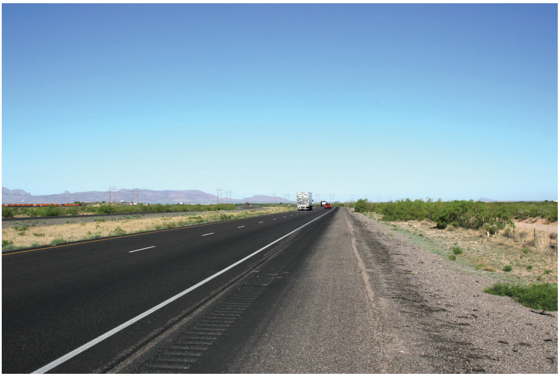
A. KOP P2-04. Existing view toward the representative ROW traveling west on I-10.