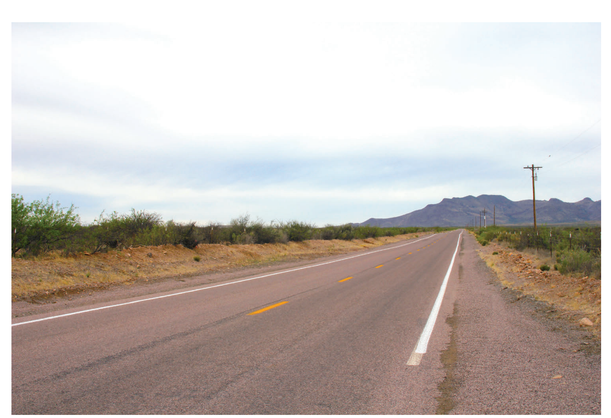
KOP G-01. Existing view toward the representative ROW from the western boundary of the Willcox developed area.

FIGURE B-47 KOP G-01. View from City of Willcox Southline Transmission Project