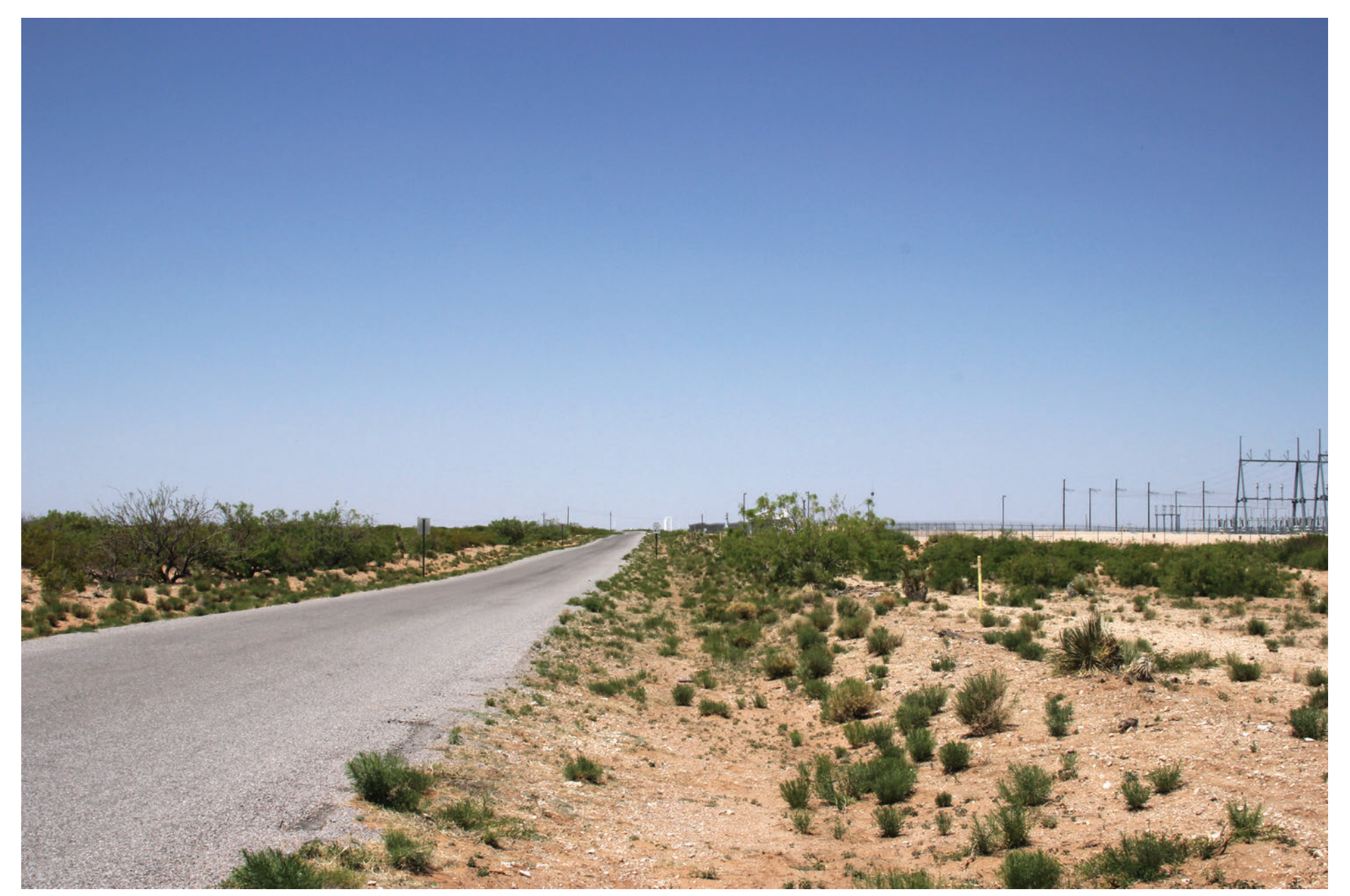
KOP P1-01. Existing view toward the representative ROW east of Afton substation along Afton Road.

FIGURE B-1 KOP P1-01. View from Afton Substation Southline Transmission Project