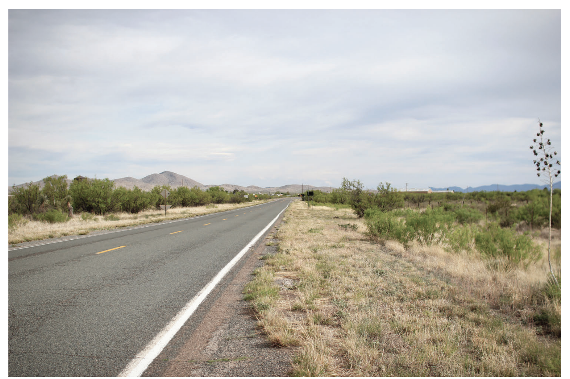
KOP S7-03. Existing view toward the representative ROW crossing at State Route 146, north of Hachita.

FIGURE B-28 KOP S7-03. View from North of Community of Hachita Southline Transmission Project