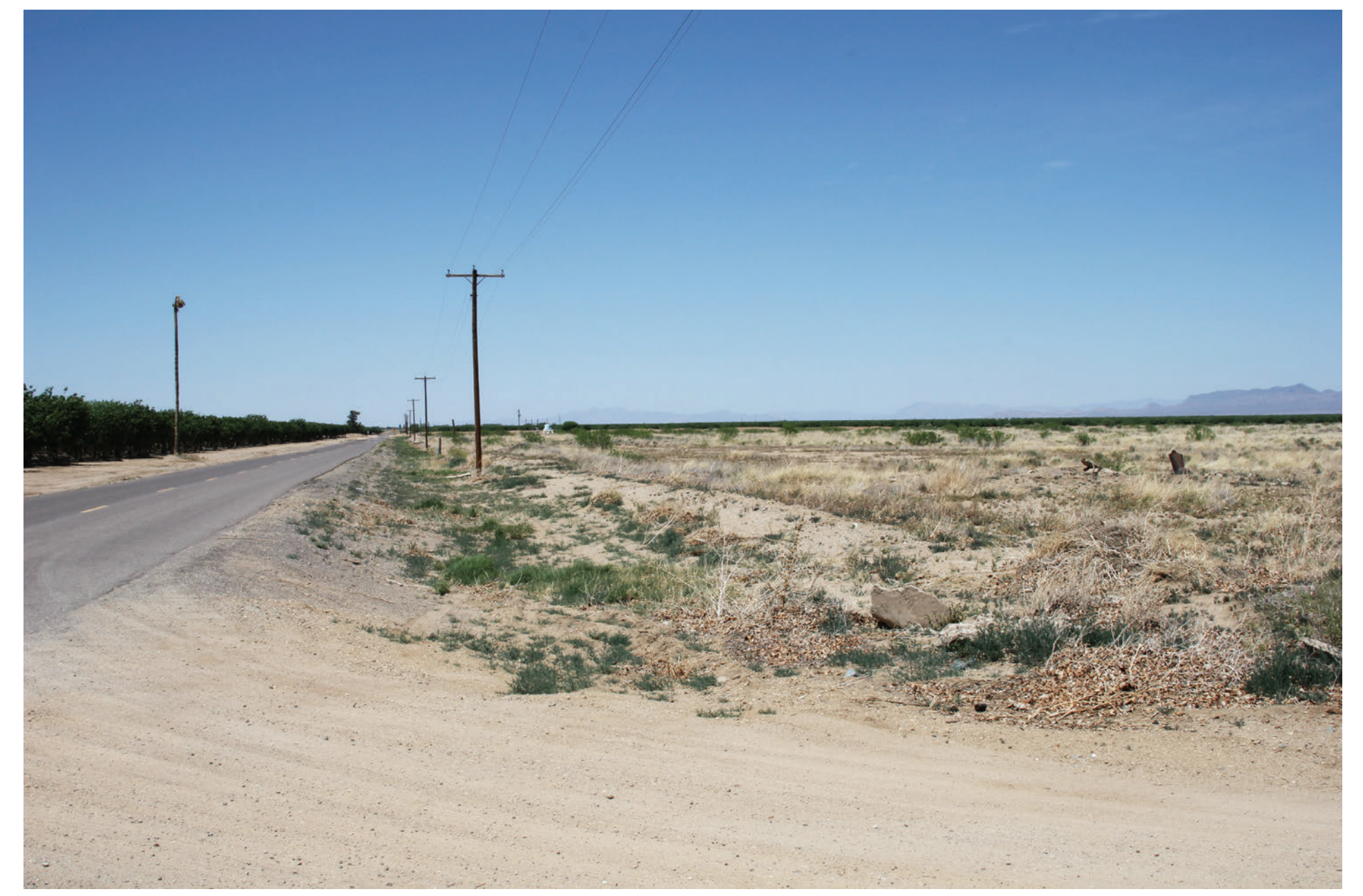
KOP P6-02. Existing view toward the representative ROW from the main access road to Ft. Bowie Scenic ACEC and wilderness area.

FIGURE B-40 KOP P6-02. View from South Apache Pass Road Southline Transmission Project