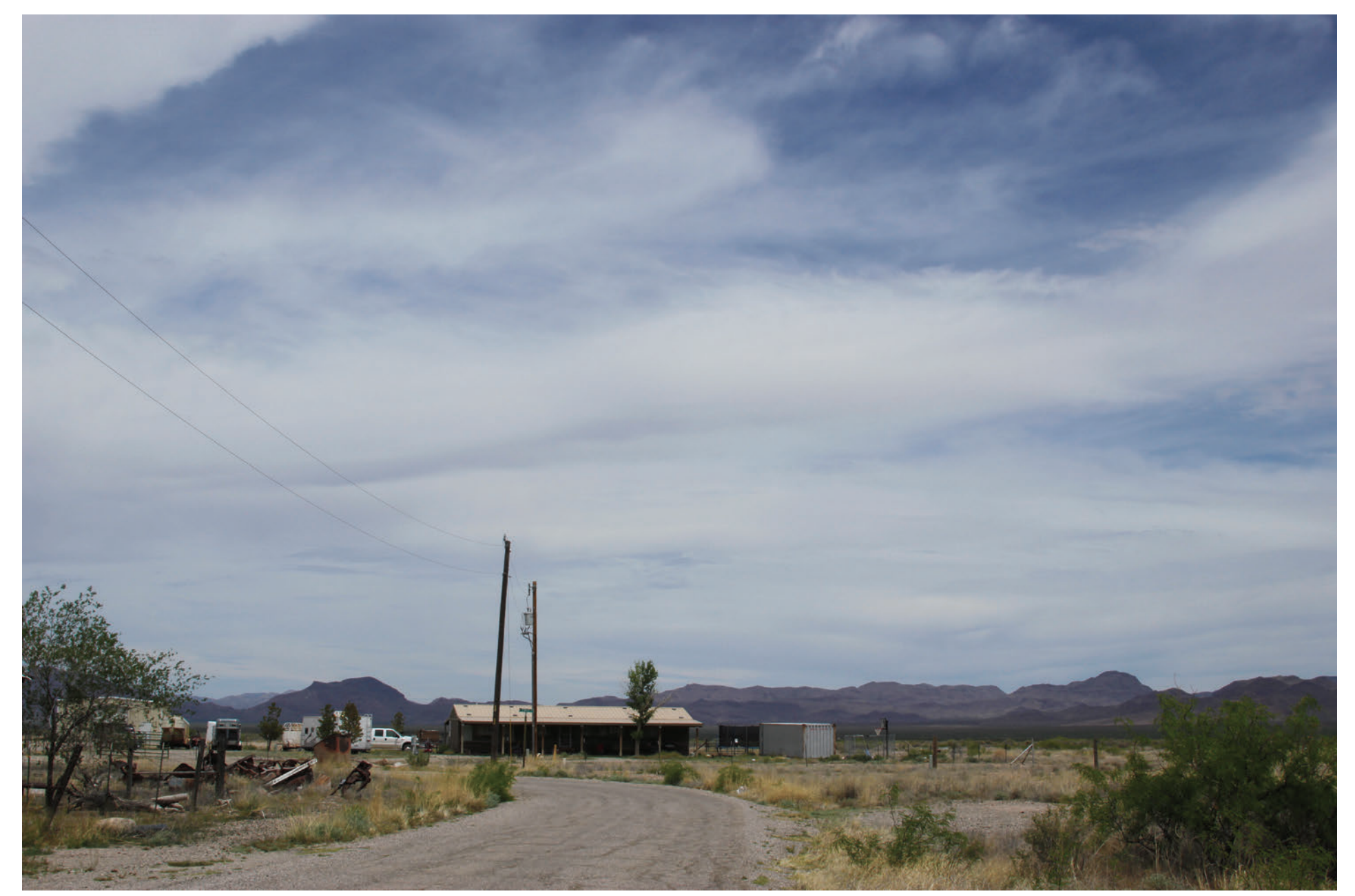
KOP E-02. Existing view toward the representative ROW from the community of San Simon.

FIGURE B-38 KOP E-02. View from Community of San Simon Southline Transmission Project