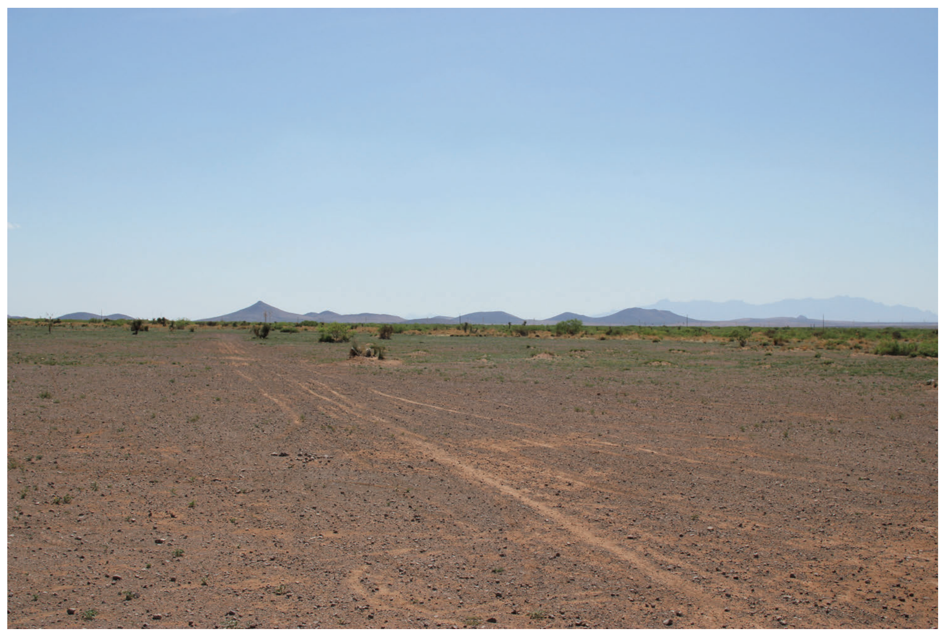
B. KOP P2-01. Simulated view toward the representative ROW from Aden Hills OHV trail.

FIGURE B-2 KOP P2-01. View from Aden Hills OHV Southline Transmission Project