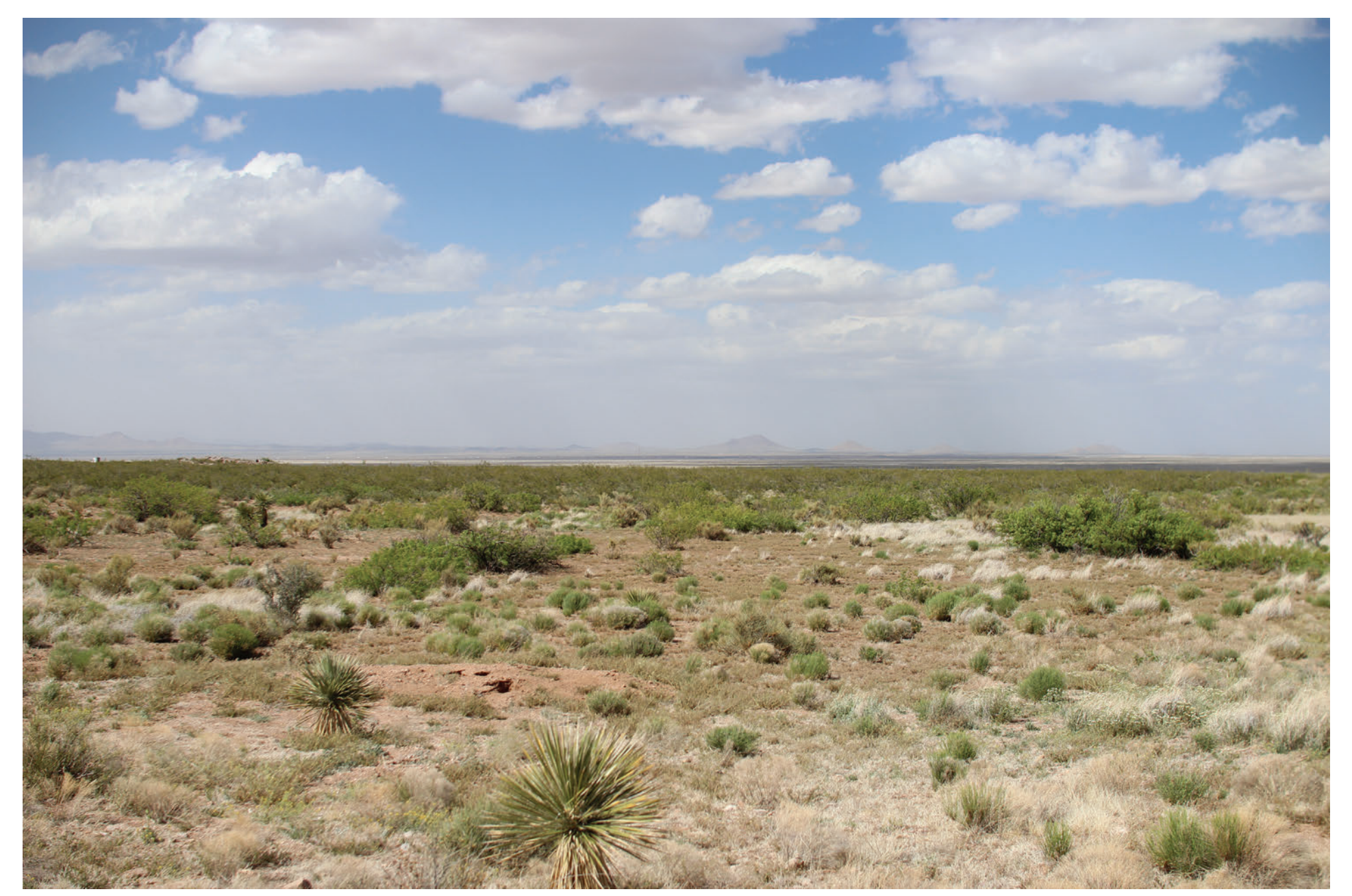
KOP S7-05. Existing view toward the representative ROW and open Lordsburg Valley near Brockman Hills.

FIGURE B-30 KOP S7-05. View near Brockman Hills Southline Transmission Project