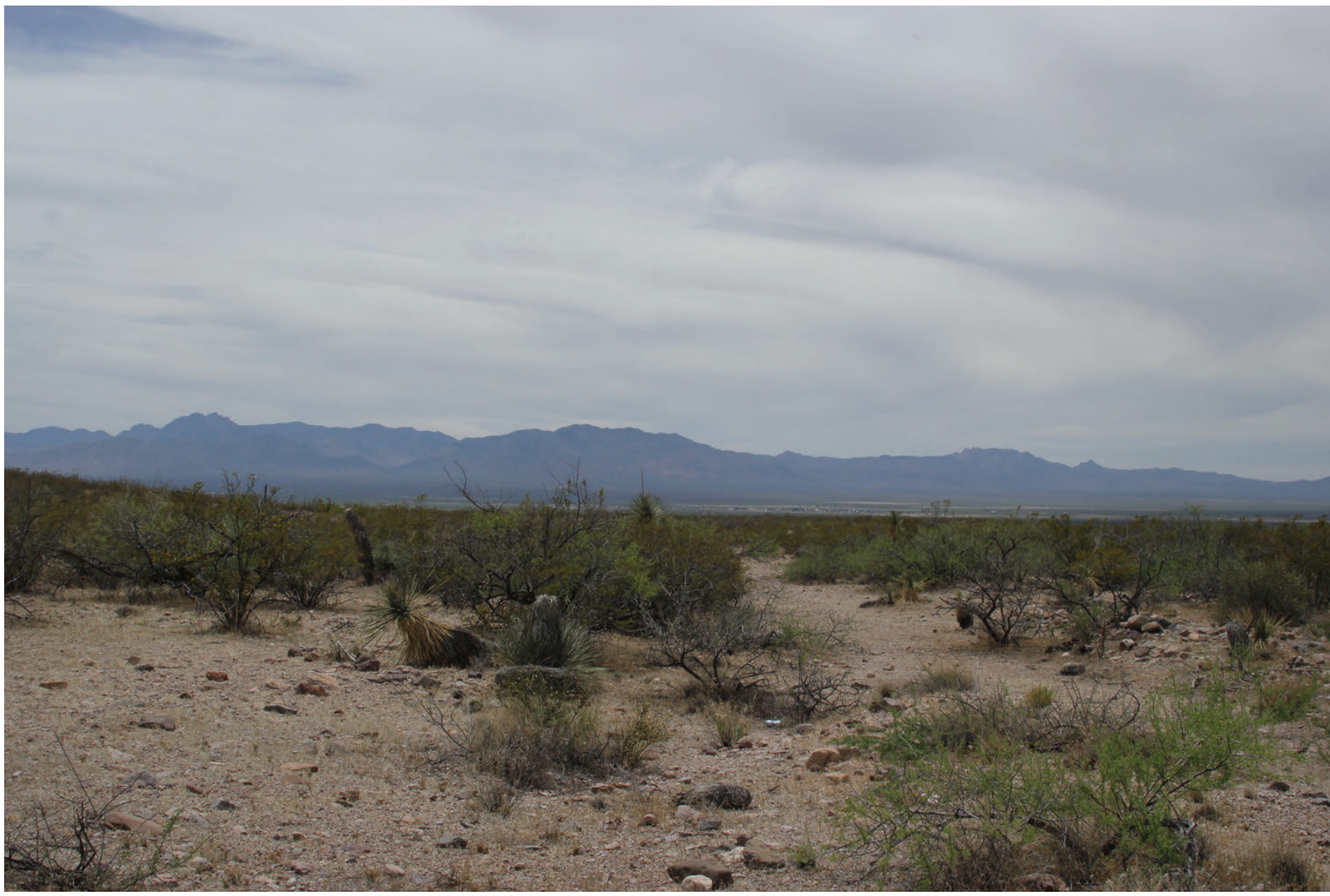
A. KOP P5-02. Existing view toward the representative ROW from roadway providing access to VRM Class I & II lands.