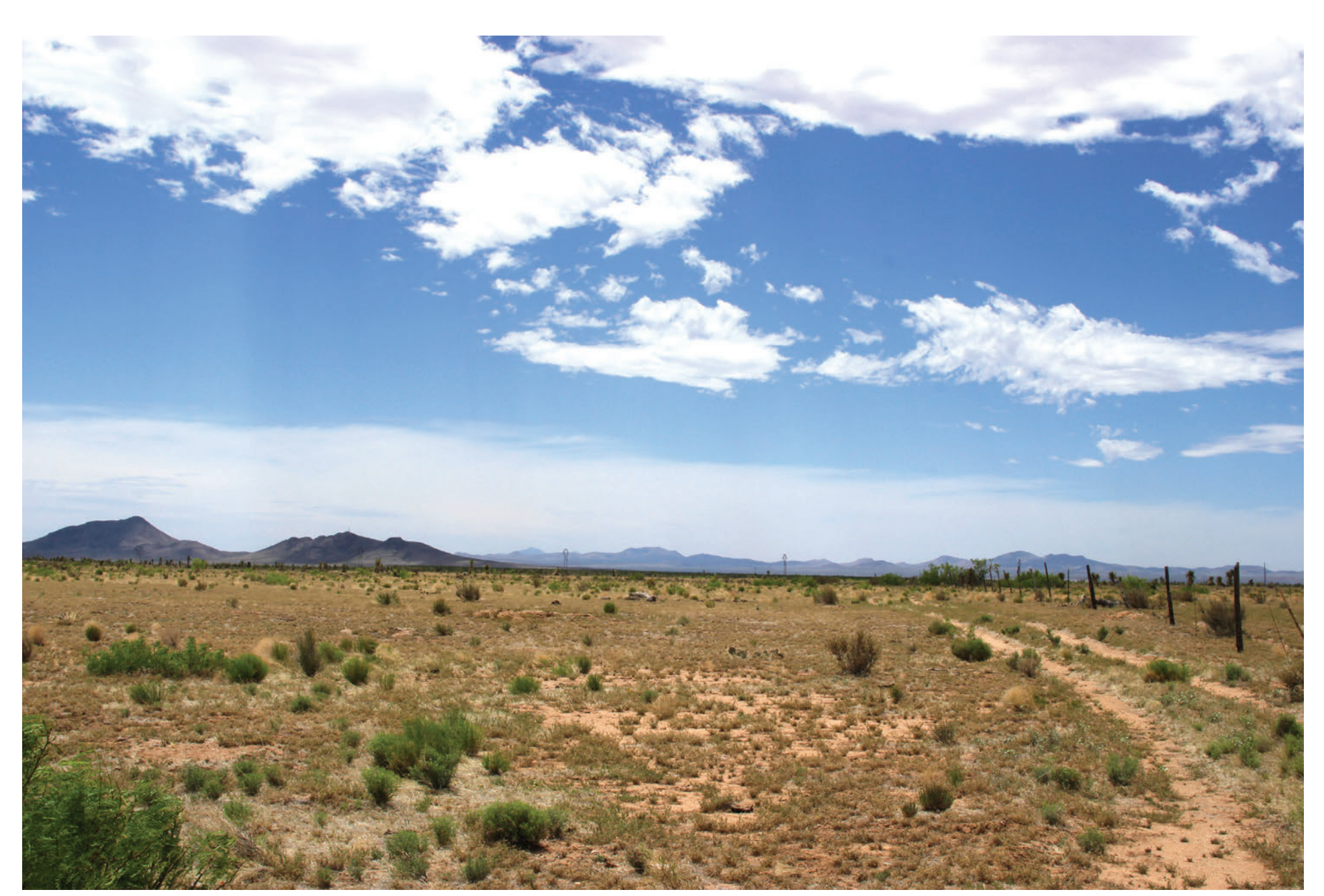
KOP P2-07. Existing view toward the representative ROW from the Grandmother Victoria Mountains.

FIGURE B-8 KOP P2-07. View from Grandmother Victoria Mountains Southline Transmission Project