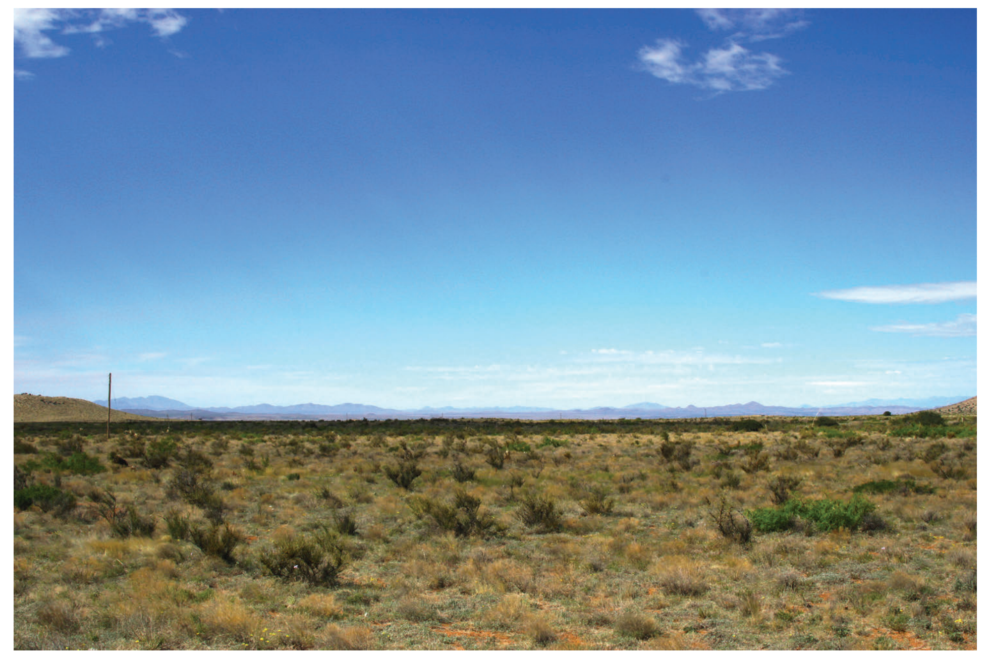
KOP P2-08. Existing view toward the representative ROW from rural residences near the Langford Mountains.

FIGURE B-9 KOP P2-08. View from Rural Residences near Langford Mountains Southline Transmission Project