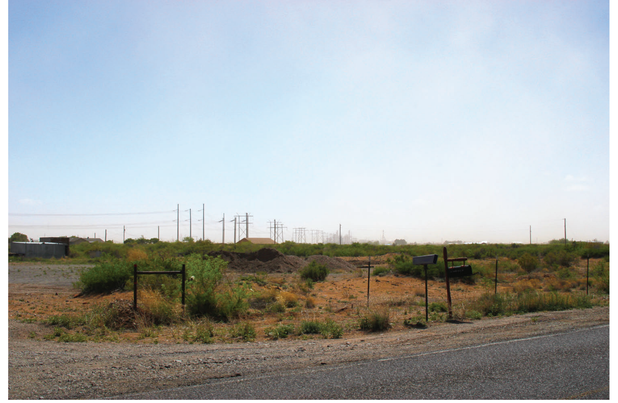
KOP P2-06. Existing view toward the representative ROW from the City of Deming.

FIGURE B-7 KOP P2-06. View from City of Deming Southline Transmission Project