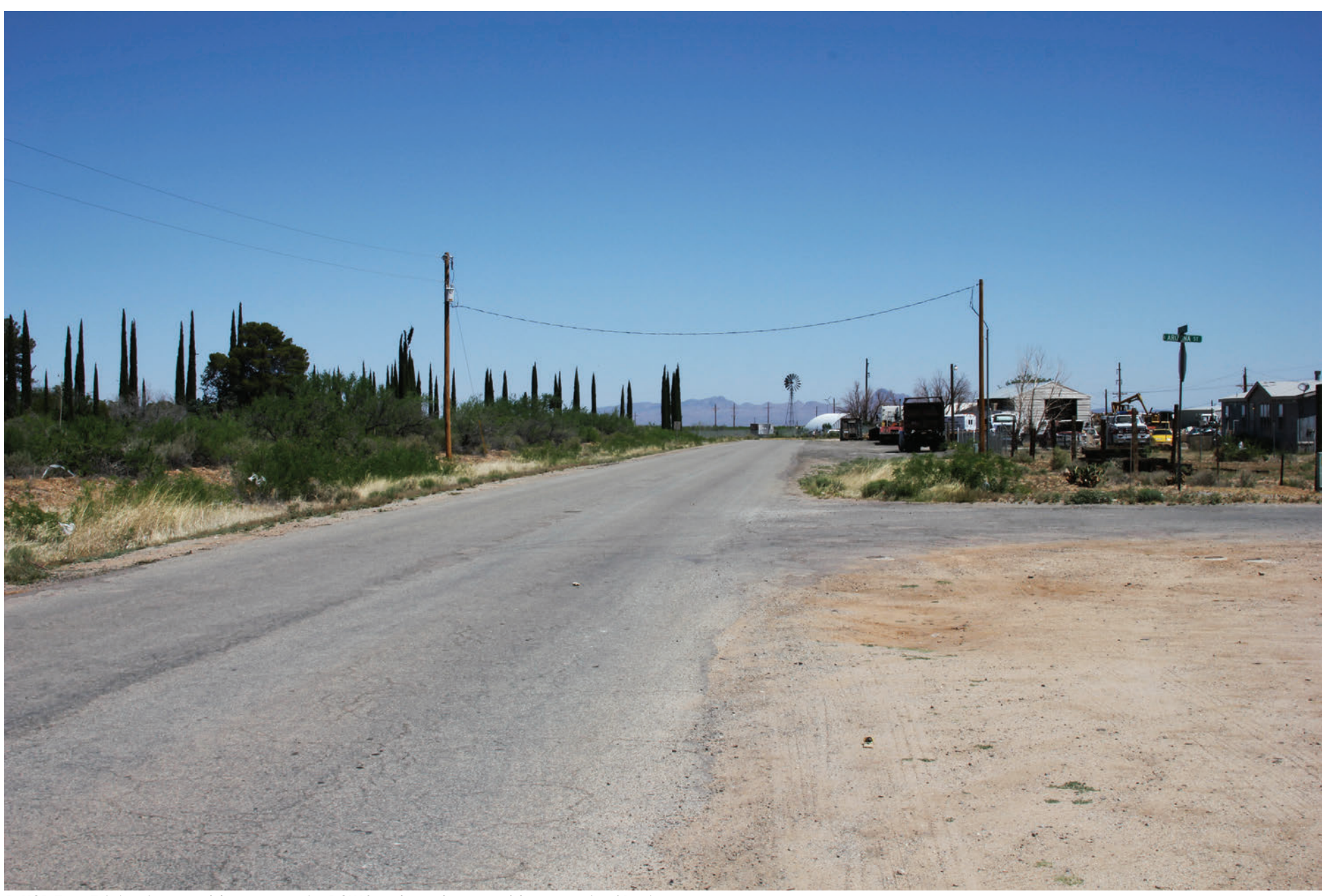
A. KOP F-01. Existing view toward the representative ROW from the northern part of the community of Bowie.