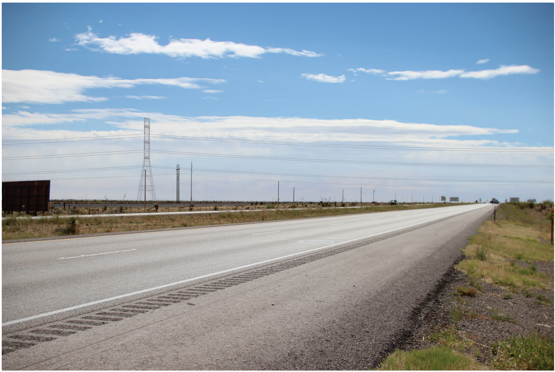
B. KOP S8-01. Simulated view toward the representative ROW crossing I-10 within Lordsburg Valley.

FIGURE B-31 KOP S8-01. View toward I-10 Crossing Southline Transmission Project