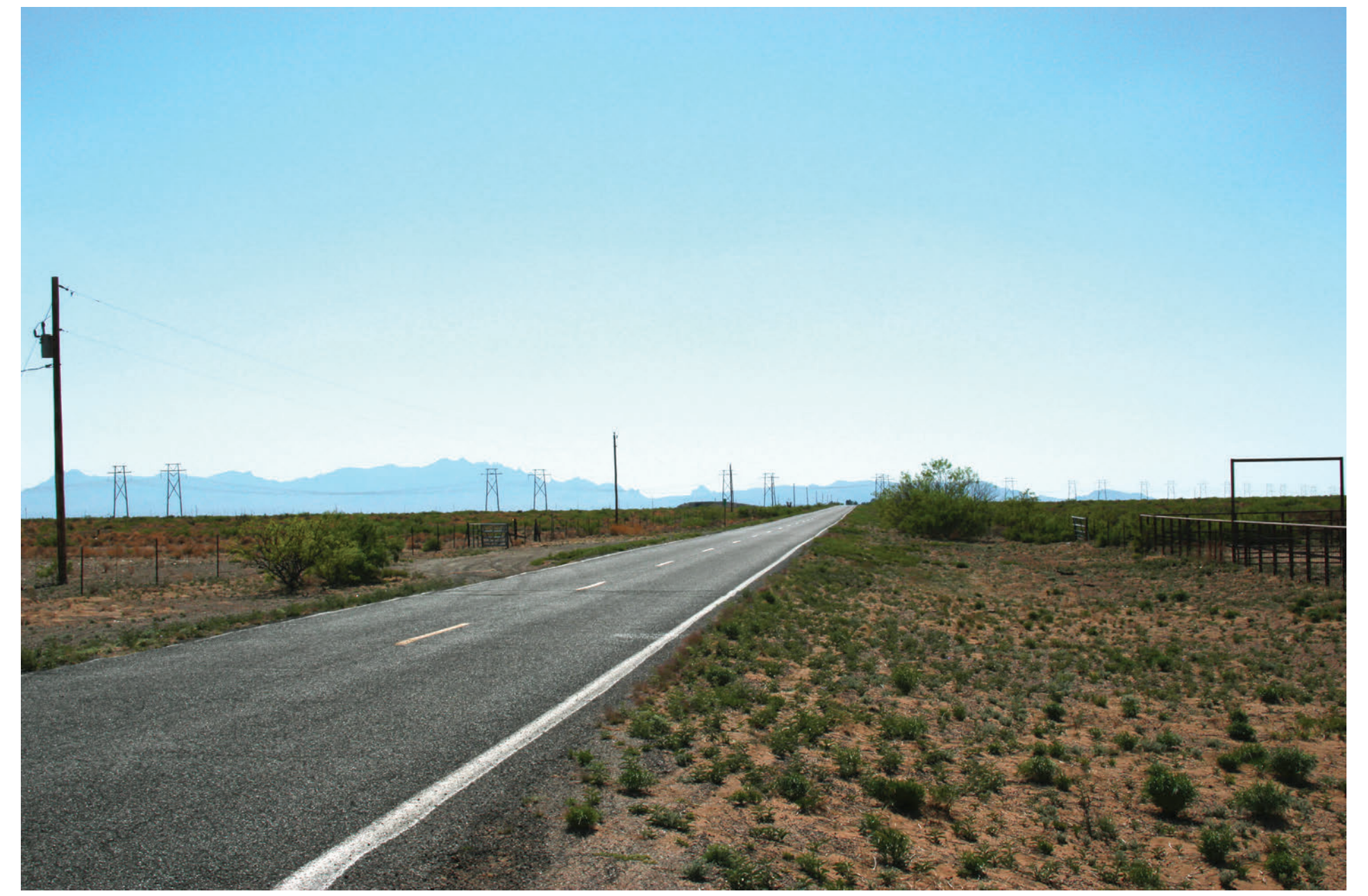
KOP P2-03. Existing view toward the representative ROW traveling west on Highway 549.

FIGURE B-4 KOP P2-03. View from Highway 549 Westbound Southline Transmission Project