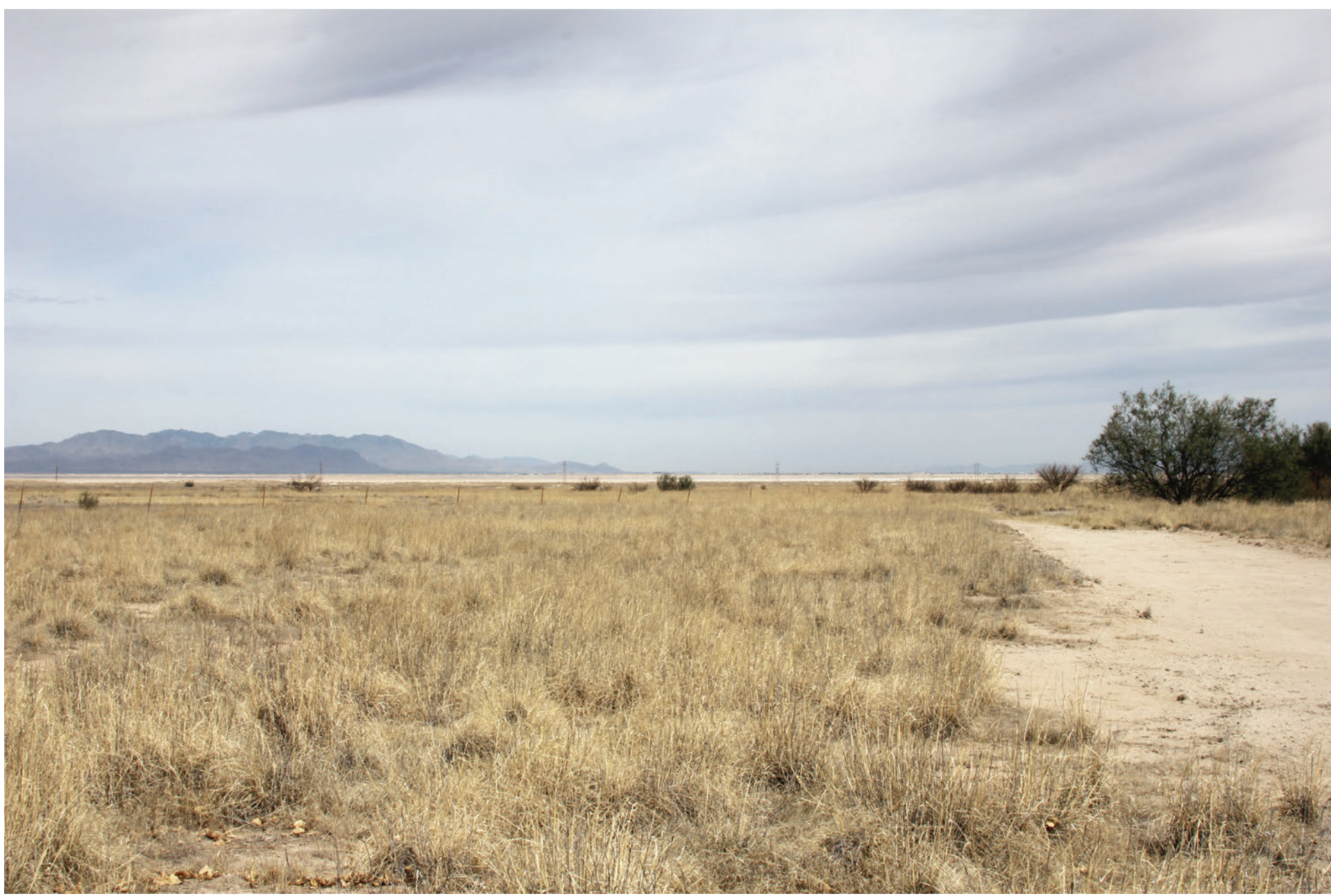
A. KOP P7-02. Existing view toward the representative ROW from the edge of Willcox Wildlife Area.