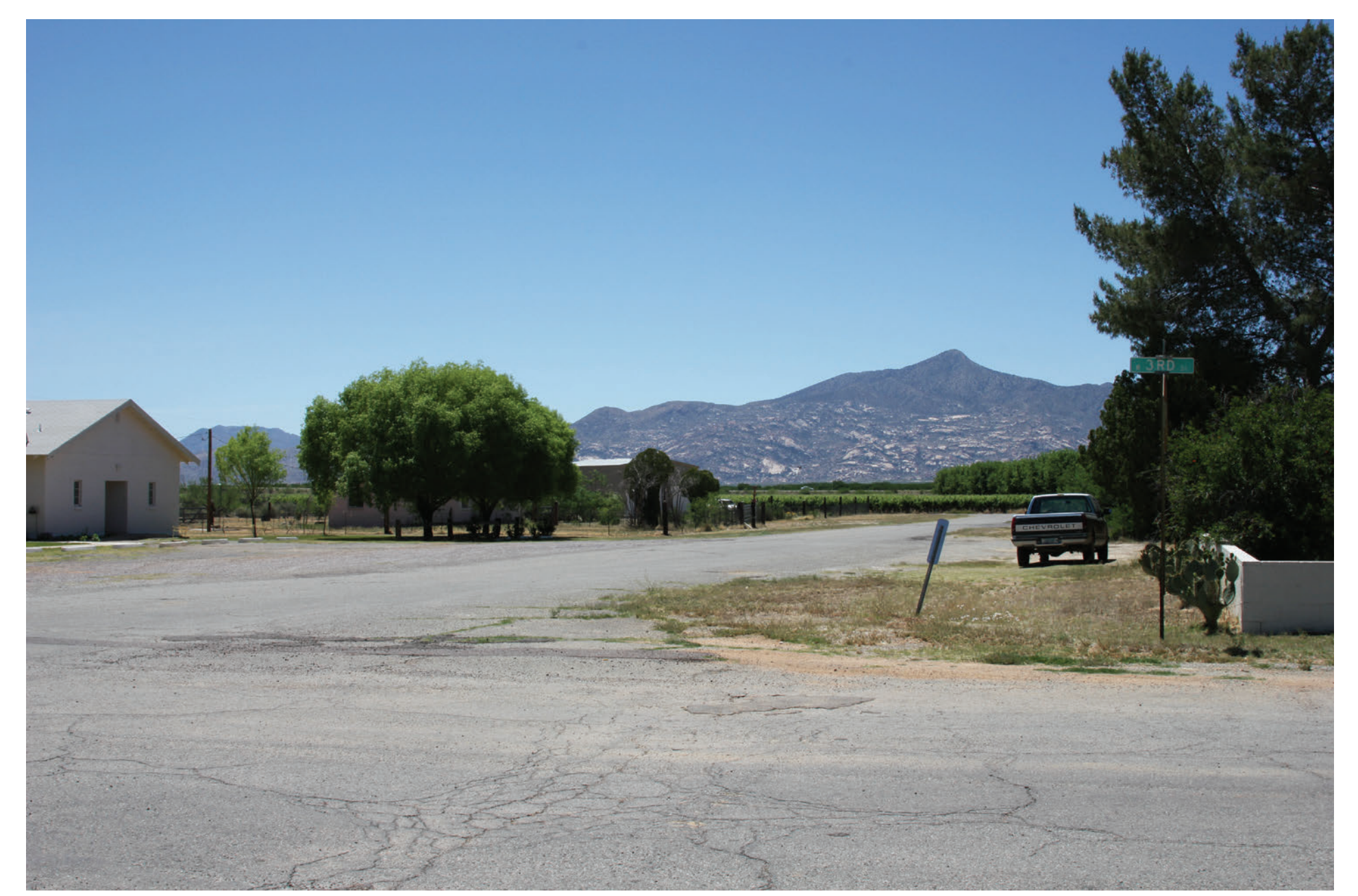
KOP P6-01. Existing view toward the representative ROW from the community of Bowie.

FIGURE B-39 KOP P6-01. View from Community of Bowie Southline Transmission Project