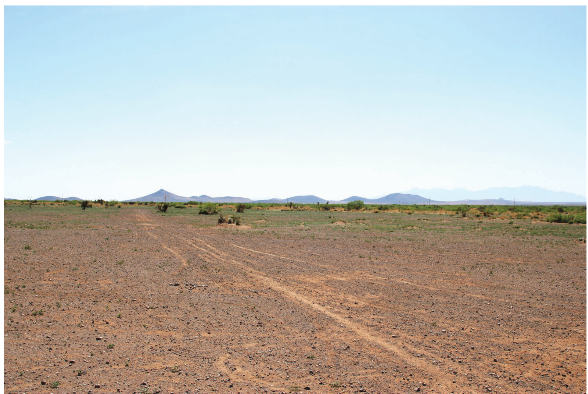
A. KOP P2-01. Existing view toward the representative ROW from Aden Hills OHV trail.