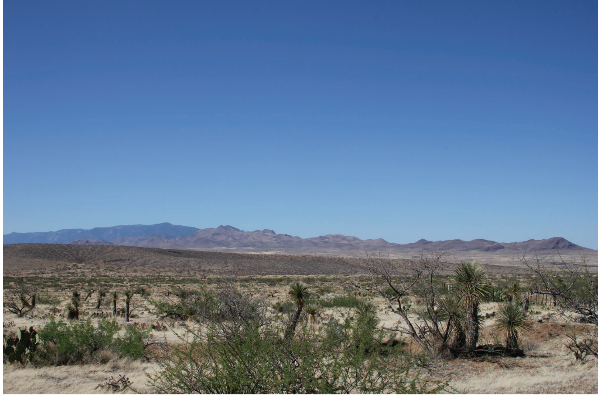
A. KOP P6-03. Existing view toward the representative ROW from representative BLM lands near Dos Cabezas Peak foothills.