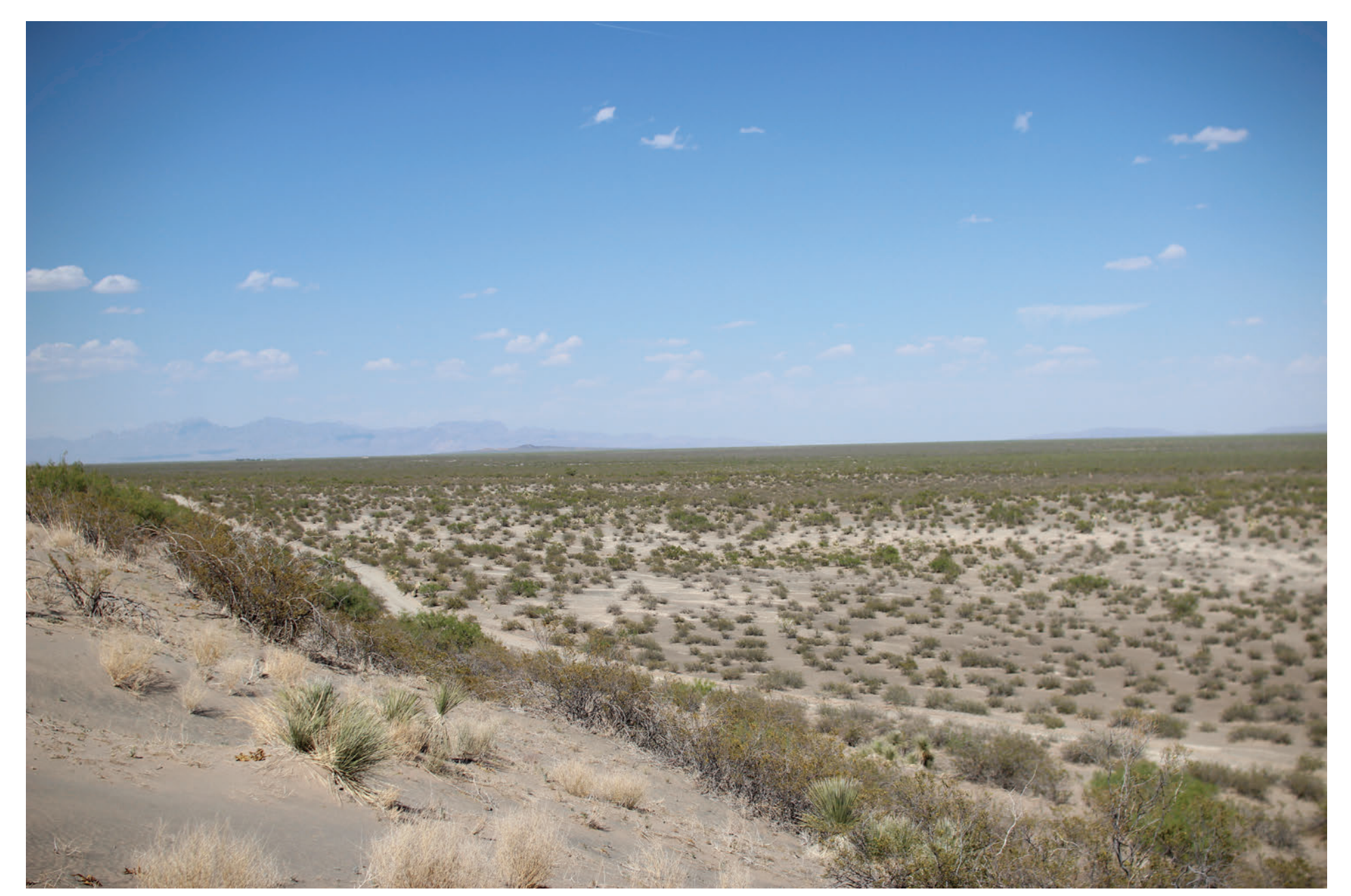
KOP S1-02. Existing view toward the representative ROW looking east from the eastern rim of Kilbourne Hole.

FIGURE B-15 KOP S1-02. View from Kilbourne Hole Southline Transmission Project