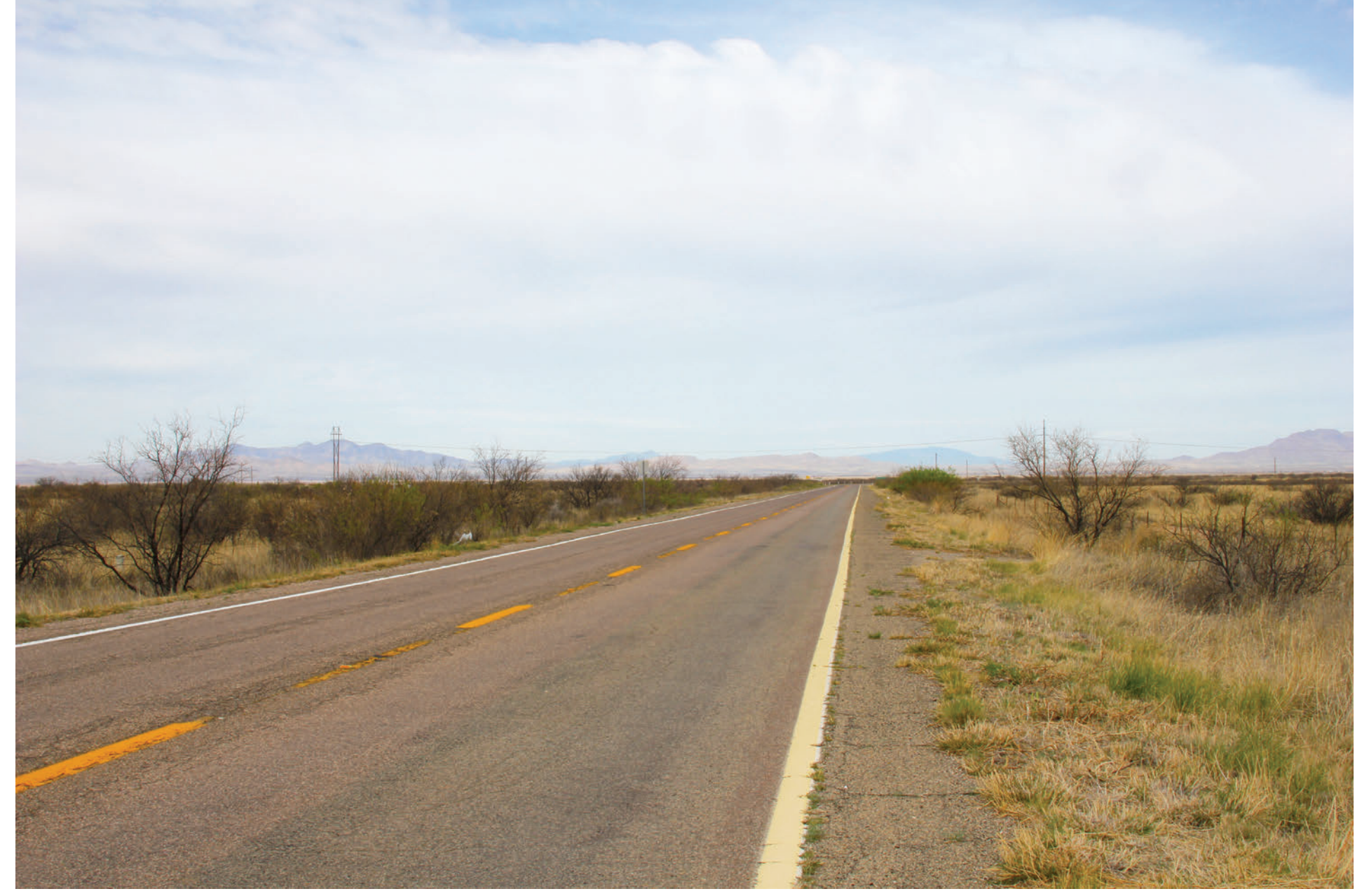
KOP P7-01. Existing view toward the representative ROW from State Route 186, which provides primary access into Dos Cabezas Peaks ACEC.

FIGURE B-44 KOP P7-01. View from Arizona SR 186 Southline Transmission Project