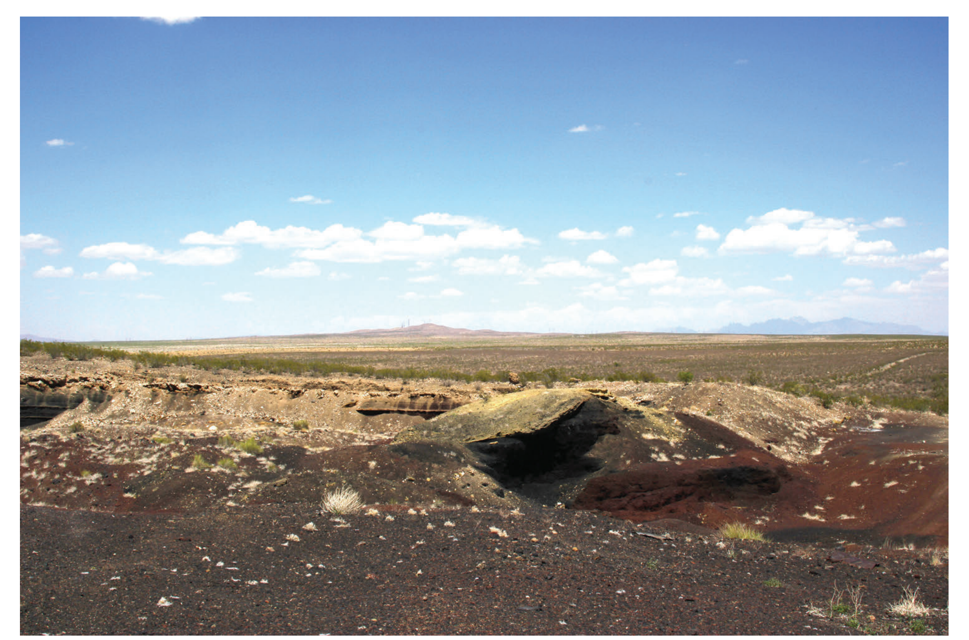
KOP P2-02. Existing view toward the representative ROW from West Potrillo Mountains.

FIGURE B-3 KOP P2-02. View from West Potrillo Mountains Southline Transmission Project