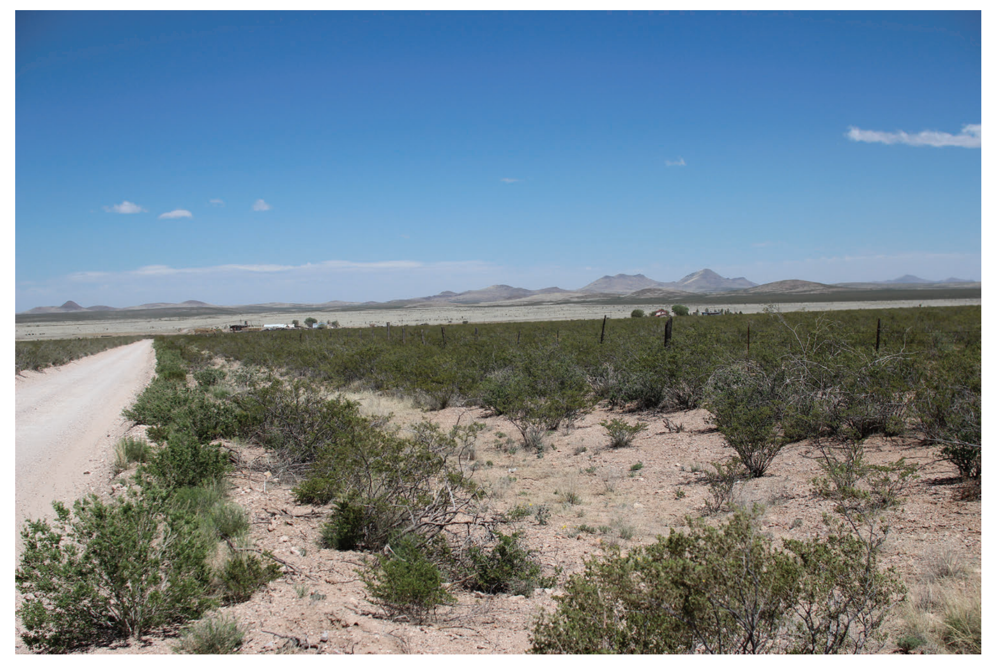
KOP S7-04. Existing view toward the representative ROW from rural residential area in Lordsburg Valley near the Continental Divide.

FIGURE B-29 KOP S7-04. View near Continental Divide Southline Transmission Project