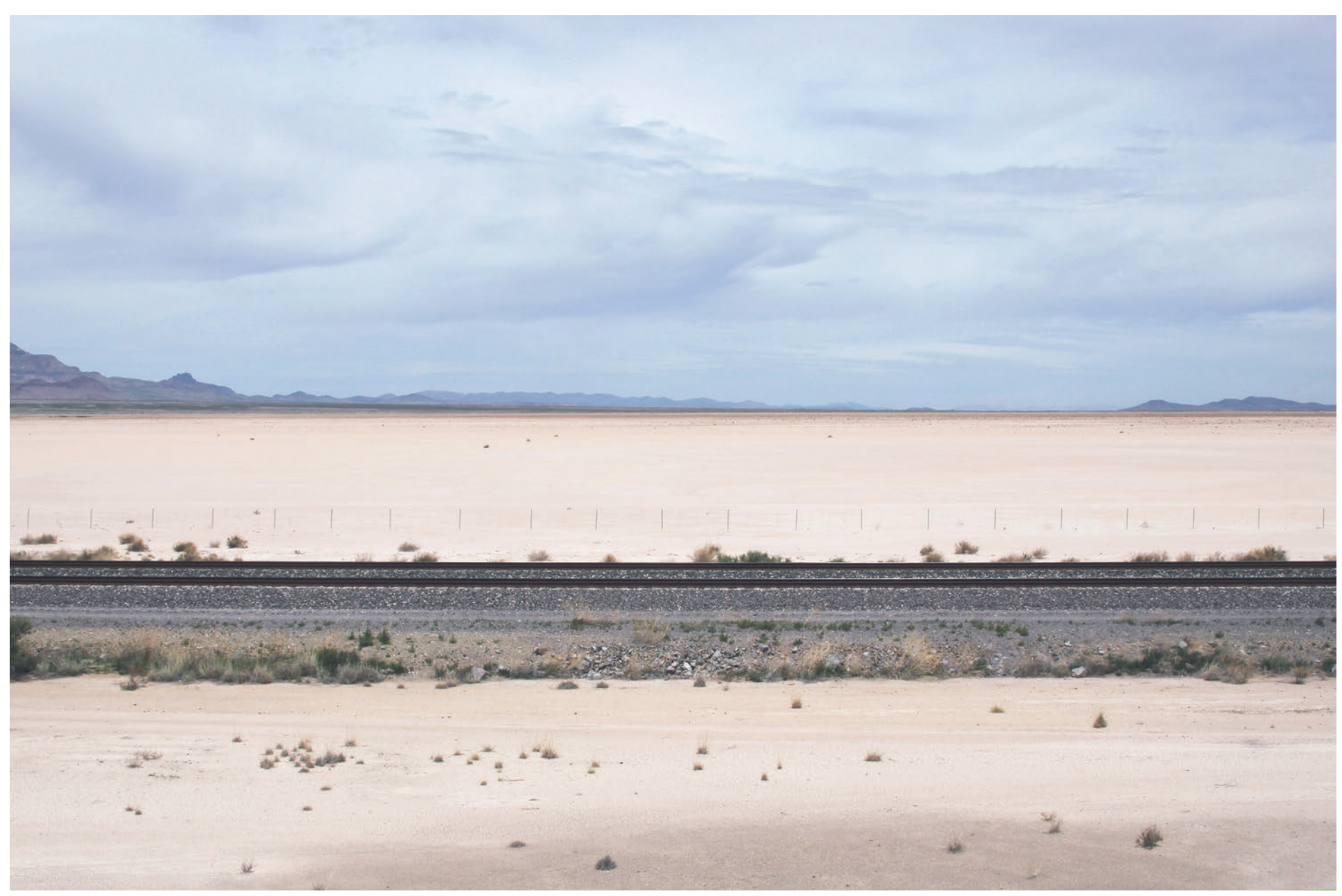
A. KOP E-01. Existing view toward the representative ROW from I-10, across Alkali Flat, toward Peloncillo Mountains.