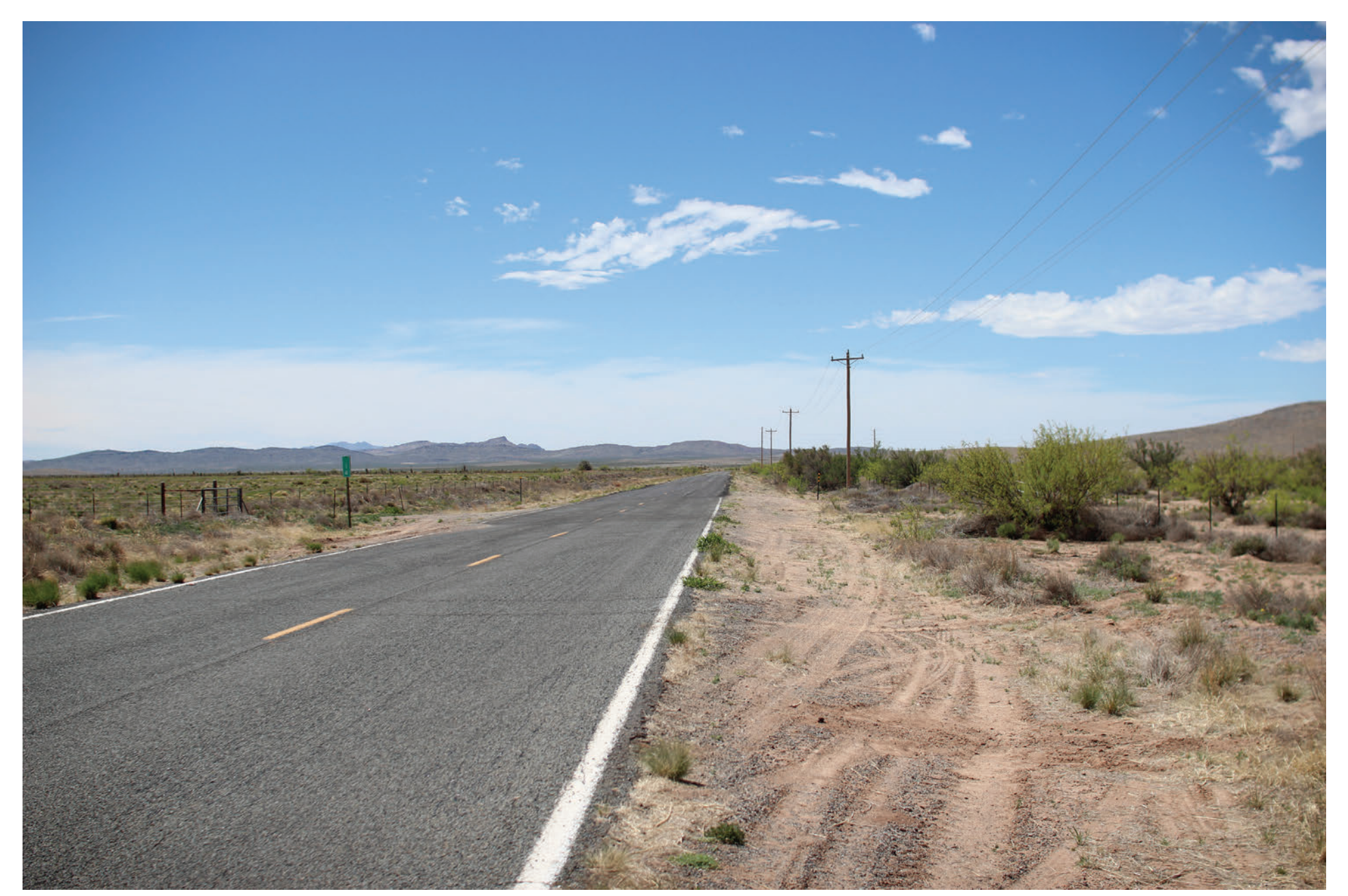
KOP D-01. Existing view toward the representative ROW from NM 113 crossing within Lordsburg Valley.

FIGURE B-33 KOP D-01. View from NM 113 Southline Transmission Project