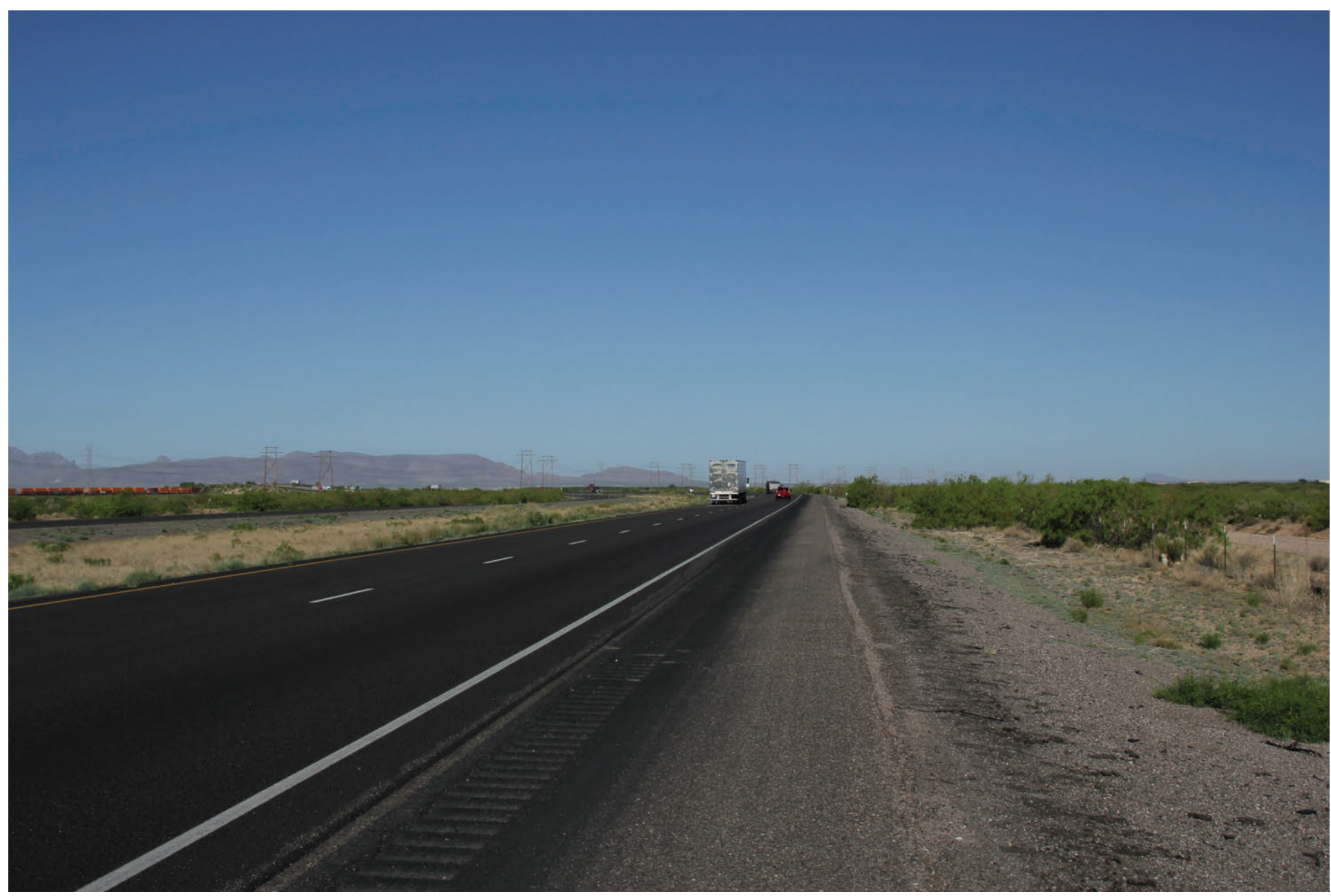
B. KOP P2-04. Simulated view toward the representative ROW traveling west on I-10.

FIGURE B-5 KOP P2-04. View from Interstate 10 Westbound Southline Transmission Project