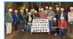
In November 2013 NNM CAB members toured the WIPP facility 2000' underground.

The NNM CAB's website contains: minutes from Board Meetings, recommendations submitted by the NNM CAB, a presentations archive, upcoming meeting agendas, calendar of activities, and links to additional information, sites, and educational tools. Visit the YouTube channel for videos and presentations; or the Facebook page to see: articles links to events, & photos.