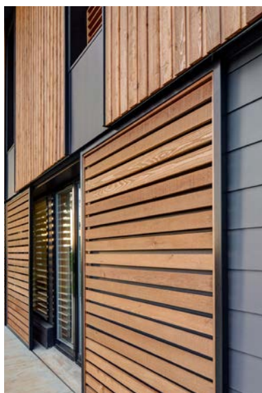
Sliding cedar shades block unwanted solar heat gain on hot summer afternoons.

One minisplit heat pump provides all of the heating and cooling the highly efficient home needs. While some homes are set up so that the HRV uses the central heating system's ducts to distribute air, in this home the heat pump uses the HRV's sheet metal ducts to distribute warm and cool air throughout the home. The inverter-driven system has a heating efficiency of 10 HSPF and a cooling efficiency of SEER 15.5.