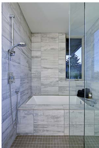
All of the home's plumbing fixtures are EPA WaterSense-labeled.

The home's heating system includes in-floor radiant heat with hot water provided by an on-demand gas-fired boiler. No air conditioner was installed because it will not likely be needed in the highly insulated home, which has windows and doors on all three levels for cross ventilation. However, conduit was roughed in for refrigerant should the home owners wish to install it in the future.