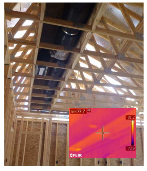
Attic chase and infrared image taken during a winter heating cycle

Though the team recommended creating duct chases by lowering ceilings, three of the participating builders chose to construct chases through the attics to house the ducts. All three builders cited concerns about market acceptance of lowered ceilings in hallways and other small spaces. The attic chases effectively increased the area of the homes' thermal barrier and proved to be costly to build, seal, and insulate. Measured seasonal design and DE ranged from 95%–99%, which was slightly lower than the 100% DE that is assumed for ducts in dropped ceilings.