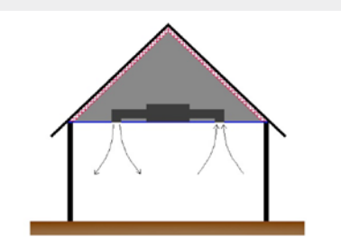
2. Nonvented attic

1. Ducts in conditioned space (attic chase)