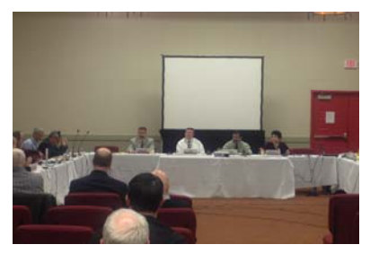
December 4th 2012 Board Meeting at Cities of Gold

The NNMCAB has six bimonthly meetings annually, each at a different venue in Northern New Mexico. The meetings are open to the public and feature public comcitizens to express their concerns or ask questions of the board and liaison members. Members of the public can