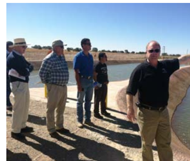
Members view the water holding ponds

The BDDP utilizes a one-megawatt solar generator, which on a sunny day supplies most of the power requirements for the BRWTP, and about 30% of its annual electric consumption. A second solar station is being built for Pump Station 2A. Though NNMCAB members were not able to tour the Solar facility during the May tour. They hope to be able