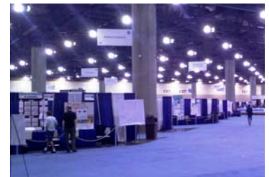
2013 ISEF Exhibit hall at the Phoenix Convention Center May 15, 2013

was well represented at the fair, with 6 of the students placing within their categories, and many of the students receiving special awards. The projects submitted and dedication of the students provide hope that science in New Mexico will stay strong as we move to the future.