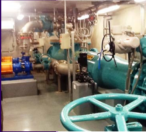
Buckman Direct Diversion water processing equipment

“The Solar generator at the BRWTP produces one-million watts of green power”