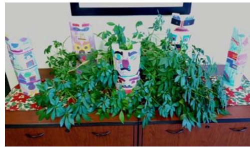
Totems Created by Pojoaque Valley Students, for the Art Show

board while supporting the creative ability of the local students. The art displays are planned to become a bi-annual event with new art displays occurring in the fall and spring of each year; expanding the number of students participating, and increasing the networking and community involvement of Northern New Mexico citizens in NNMCAB events.