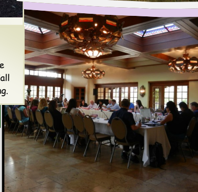
Meeting at La Fonda July 30, 2014.