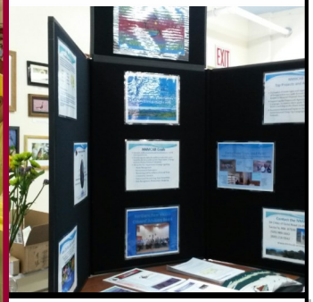
NNMCAB Booth at 2014 Earth Day Festival, Los Alamos