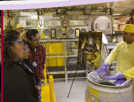
Members Tour the WCRF facility at LANL Oct. 8, 2014.