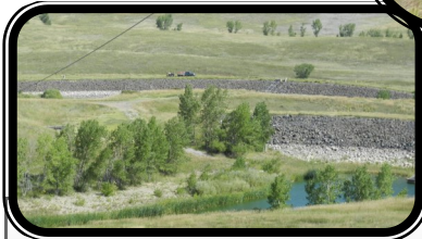
Water retention structures on the site. The structures are some of the measures used to slow drainage off the site and prevent erosion and flooding.