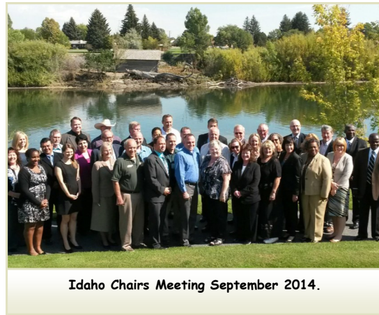
Idaho Chairs Meeting September 2014.

nuclear power plant. At the EBR-I Museum the members were also able to see two aircraft nuclear propulsion prototype engines.