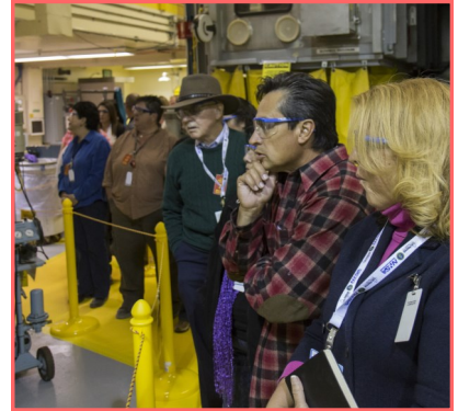
Members were able to see the inner workings of the WCCR facility, which is currently in a cold state