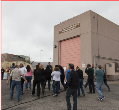
NNMCAB Members assemble outside the Waste Characterization Reduction and Repackaging Facility at LANL