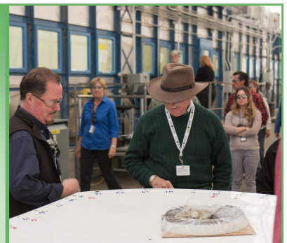
NNMCAB Members observe an over-pack container during the tour of the permacon at Disposal Area G