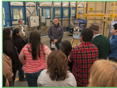
Members were able to see one of the permacons located at Material Disposal Area G