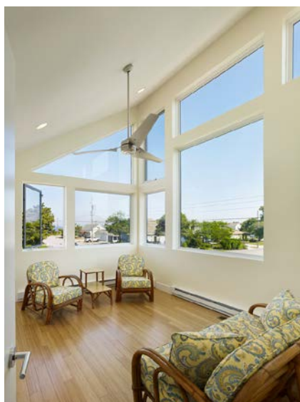
Large north-facing windows provide daylight and views without adding much solar heat gain.

The home successfully met the DOE Zero Energy Ready Home's stringent hot water delivery requirement to minimize hot water waste. All hot water supply lines utilize a home run line design. Additional water conservation features include water-saving plumbing fixtures that meet the EPA WaterSense criteria.