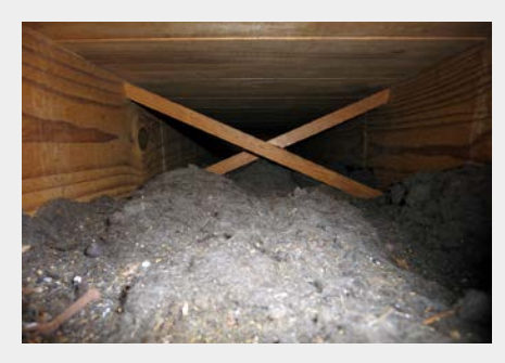
This image shows a floor cavity that is open to a vented attic on one end and has conditioned space above and below.