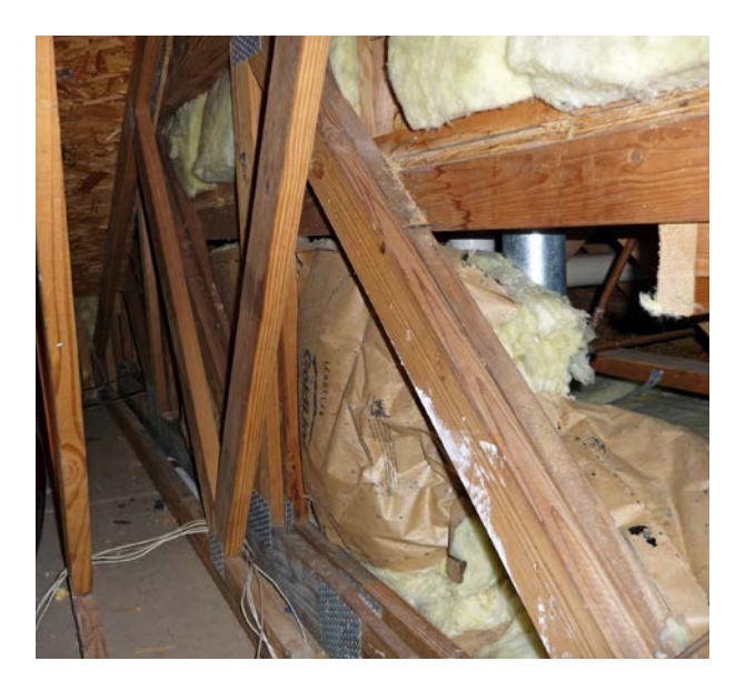
Figure 2. Visual inspection is important to determine the existence of wind washing, the resulting problems, repair strategies, and the potential benefit of the repair. The image on the left shows poorly installed batts and a pathway in a floor cavity open to the attic. Field tests can also be useful. These tests include infrared (IR) scans of house surfaces (see sidebar), house and duct leakage tests, and pressure mapping.