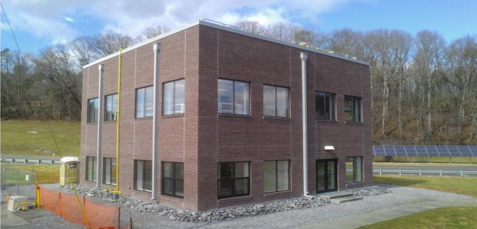
Flexible Research Platform (FRP) at Oak Ridge National Laboratory

2014 Building Technologies Office Peer Review