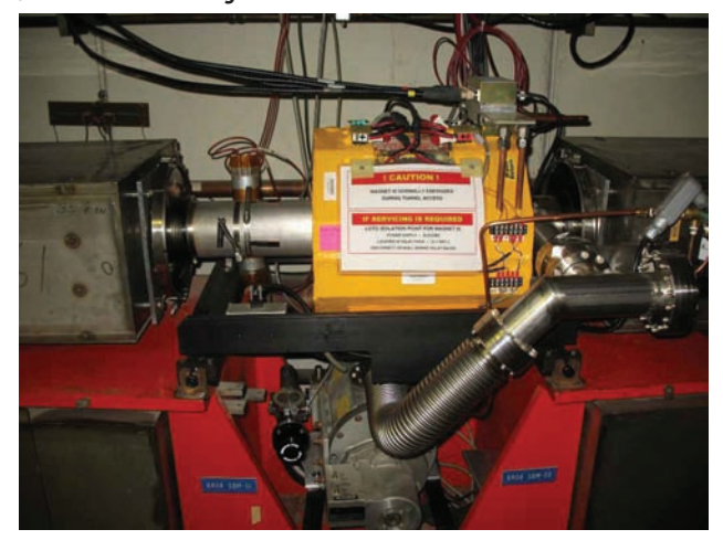
Exhibit 4-1: Booster Corrector Magnet.