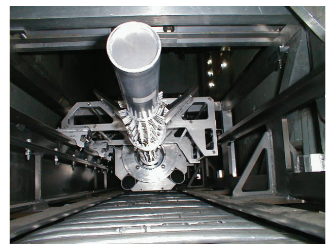
Exhibit 4-5: NuMI Target Module Being Removed from Chase.