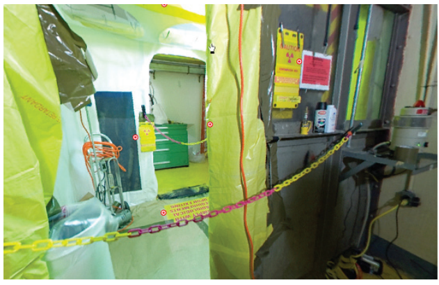
Exhibit 4-7: Additional airlock in the warm shop.

and the non-airborne contamination area. Real time air monitoring has been added in the Warm Shop and the Warm Gang Valve Corridor airlock. Lastly, a scoop/ventilation duct is used during the opening and resizing of the waste that is directed into the canyon exhaust.