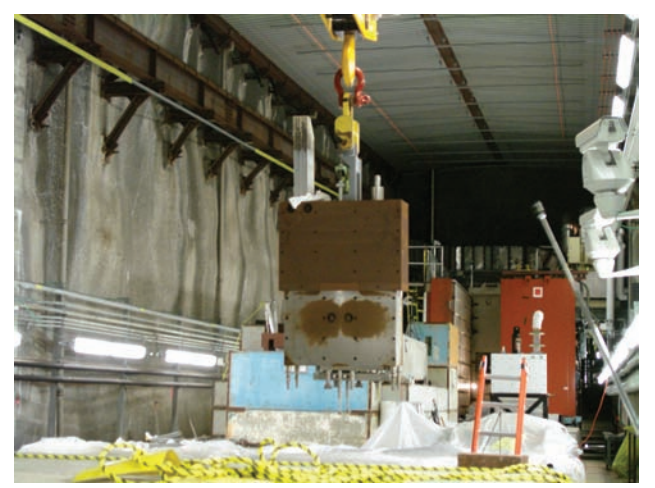
Exhibit 4-3: NuMI Power Stripline and Holder.

The purpose of NuMI (see Exhibit 4.3) is to send neutrinos to a near detector located at Fermilab and to another far detector located 450 miles away at the Soudan Underground Mine State Park in Tower-Soudan, Minnesota for the Main Injector Neutrino Oscillation Search (MINOS) Experiment. The MINOS Experiment is a long-baseline neutrino experiment designed to observe the phenomena of neutrino oscillations, an effect which is related to neutrino mass. The Fermilab NuMI beamline uses protons from the Main Injector to produce an intense beam of neutrinos. The NuMI horn is a focusing device. The NuMI horn steers neutrinos to the MINOS Experiment near and far detectors. One of the two NuMI horns indicated a power stripline failure/fracture. This failure was the result of using steel washers on the power stripline restraint bolts. After a few years, the steel washers failed due to corrosion. Additionally,