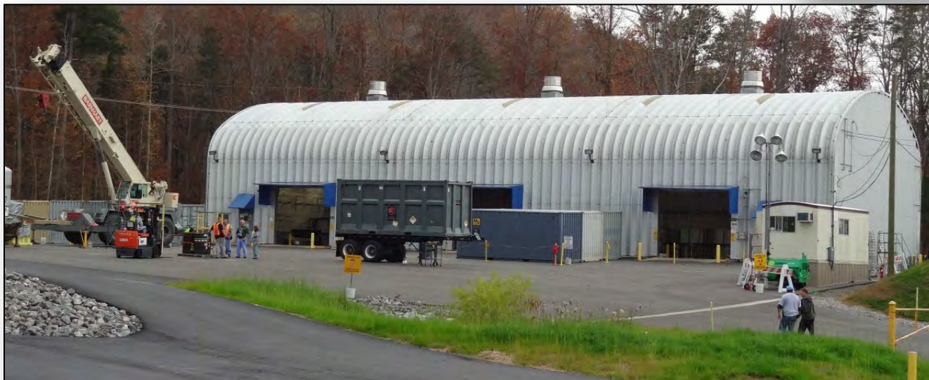
CH TRU Marshaling Building