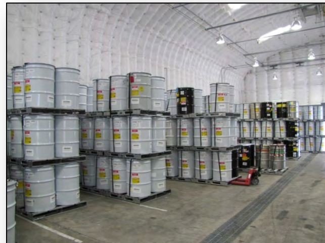
Staged CH Waste