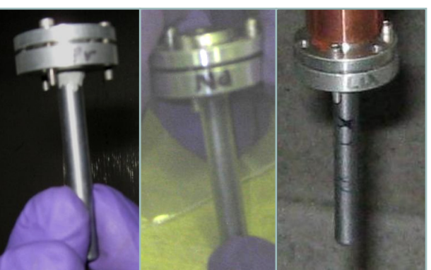
Figure 2-2. Sample canisters with handwritten labels

LANSCE had not performed a formal engineering analysis to determine specifications for how the canisters must be assembled and sealed to ensure that the canisters would provide confinement. In addition, LANSCE had