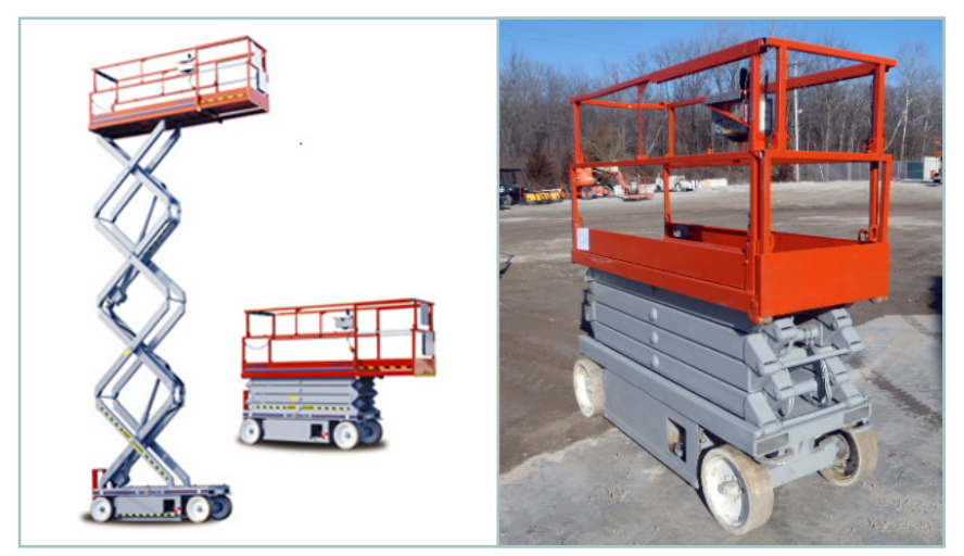
Figure 1-1. Examples of extended and unextended Skyjacks

D&D-1 raised the lift to working height and began the torchcutting operation; PE-1 monitored gas readings. The supervisor assisted the workers by attending to filters and hoses. Soon after they started cutting, the gas monitor showed rising levels of carbon monoxide. Thus they stopped and cut a