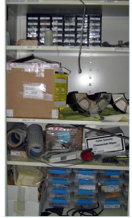
Figure 2-4. FP-04 radioactive material storage cabinet