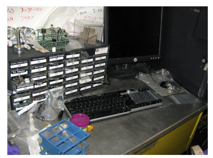
Figure 2-6. Work area/accident scene — Sample canisters are seen on top of supply cabinet and new sample canister/sample staged for preparation on desk.

Management processes tolerated deviations from expectations, both in terms of work expectations and control of materials and equipment. For example, violations of procedural requirements, even when recognized, were not effectively resolved to ensure personnel complied with safety requirements. In addition, irradiated canisters that the scientists thought (but did not verify) were non-hazardous were sometimes opened in the work area (Figure 2-6), even though multiple personnel agreed that the practice was contrary to requirements to use a glovebox when opening them.