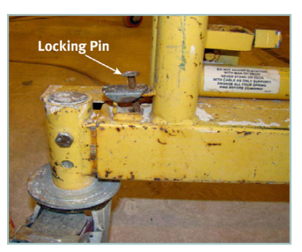
Figure 2-3. Example of locking pin not fully engaged

In addition, the Board learned that a chisel and other tools and debris were found on the injured worker's work platform, as well as on the other two Tele-Towers,<sup>®</sup> even though the manufacturer's instructions and the procedure that the workers used cautioned against obstructions and tripping hazards. During interviews, workers cited numerous instances where actions taken on the day of the accident deviated from prescribed hazard controls. The Board determined that ambiguities in procedures for the work allowed the workers to improvise new approaches to the task without re-evaluating