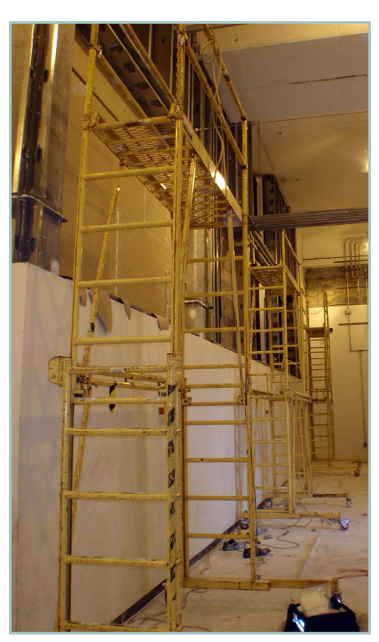
Figure 2-1. Scaffolding in use when accident occurred

The Department of Energy's Office of Environmental Management appointed an Accident Investigation Board to investigate this event, determine its causes, and identify Judgments of Need (JON) to reduce the potential for similar accidents. The Board's report is available at http://www.hss.doe.gov/sesa/corporate safety/aip/docs/accidents/typea/srs_fall_injury_report.pdf.