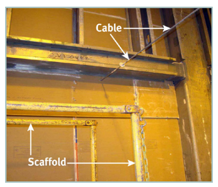
Figure 2-4. Cable near end of scaffold

potential hazards and implementing additional controls.