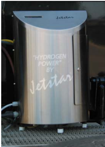
Jetstar Hydrogen Generator