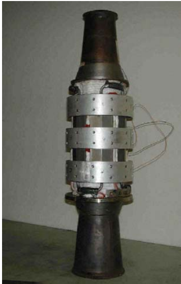
180 W generator