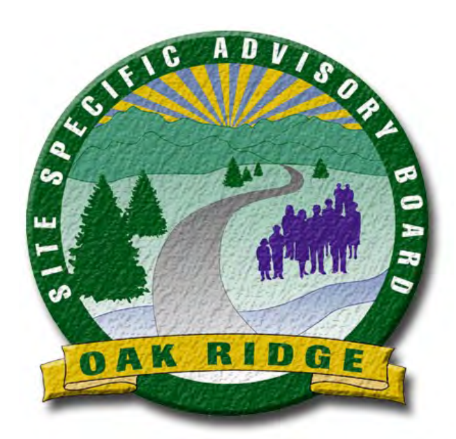
Wednesday, March 12, 2014 6 p.m., DOE Information Center 1 Science.gov Way Oak Ridge, Tennessee

The mission of the Oak Ridge Site Specific Advisory Board (ORSSAB) is to provide informed advice and recommendations concerning site specific issues related to the Department of Energy's (DOE's) Environmental Management (EM) Program at the Oak Ridge Reservation. In order to provide unbiased evaluation and recommendations on the cleanup efforts related to the Oak Ridge site, the Board seeks opportunities for input through collaborative dialogue with the communities surrounding the Oak Ridge Reservation, governmental regulators, and other stakeholders.