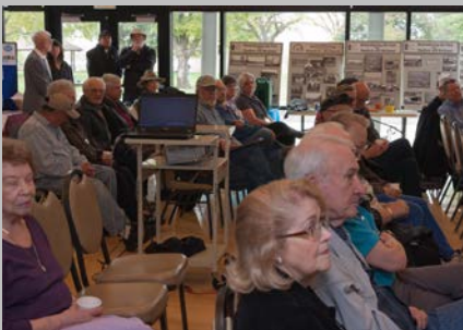
Participants at the Hanford event listened to remarks from Congressman Doc Hastings' District Representative followed by a reception, highlighting a historical Hanford display compliments of a local Hanford historian.