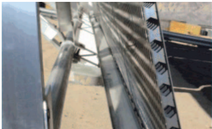
3M is producing high-flux, lightweight reflectors with lightweight, high-precision panels combined with unique multilayer optical film technology.