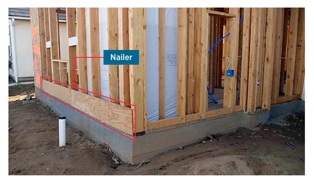
The slab edge of the test house prior to installation of the XPS rigid foam insulation, showing the nailer that supports the foam.

One challenge during installation of the system was the attachment of the butyl flashing to the open framing. To solve this constructability issue, the team added a nailer to the base of the wall to properly attach and lap the flashing. In this strategy, R-7.5, 1.5-in.-thick extruded polystyrene (XPS) was installed on the exterior of the slab for a modeled savings of 4,500 Btu/h on the heating load.