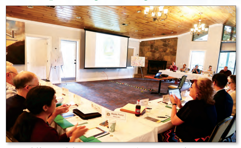
ORSSAB held its Annual Planning Meeting August 24, 2019 in Townsend, Tenn.

Each August, ORSSAB members gather with agency liaisons from the Department of Energy's (DOE) Oak Ridge Office of Environmental Management (OREM), EPA, and the Tennessee Department of Environment and Conservation (TDEC) to review the current year's progress and begin planning for the coming year.