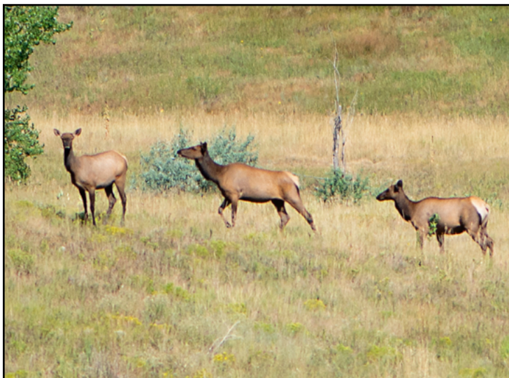
Wildlife at the Rocky Flats Site, Colorado.

At the Rocky Flats Site, LM is responsible for managing land retained by DOE and for compliance with the