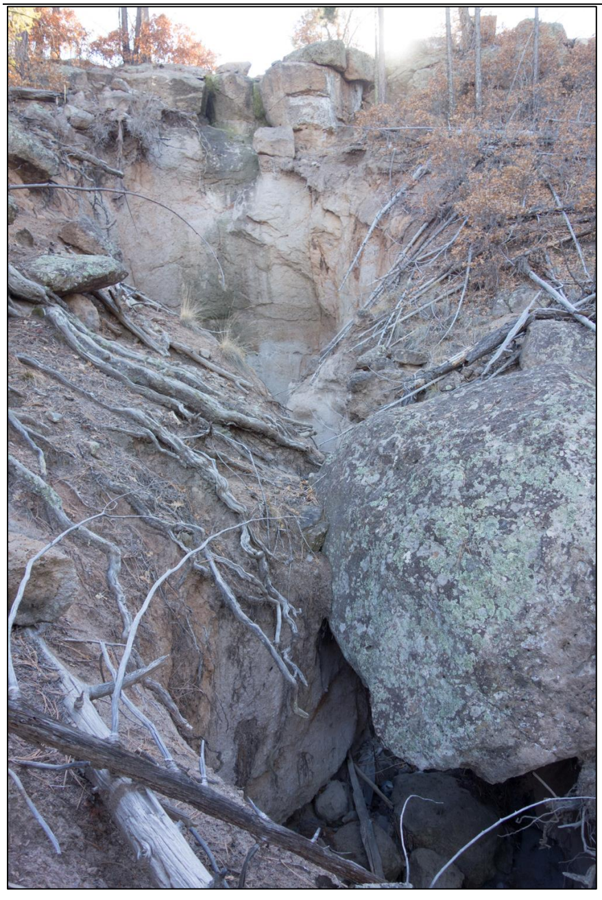
Photograph 1 . Active erosion from TA-55 discharge and the proposed location of the canyon edge section of the pipeline.