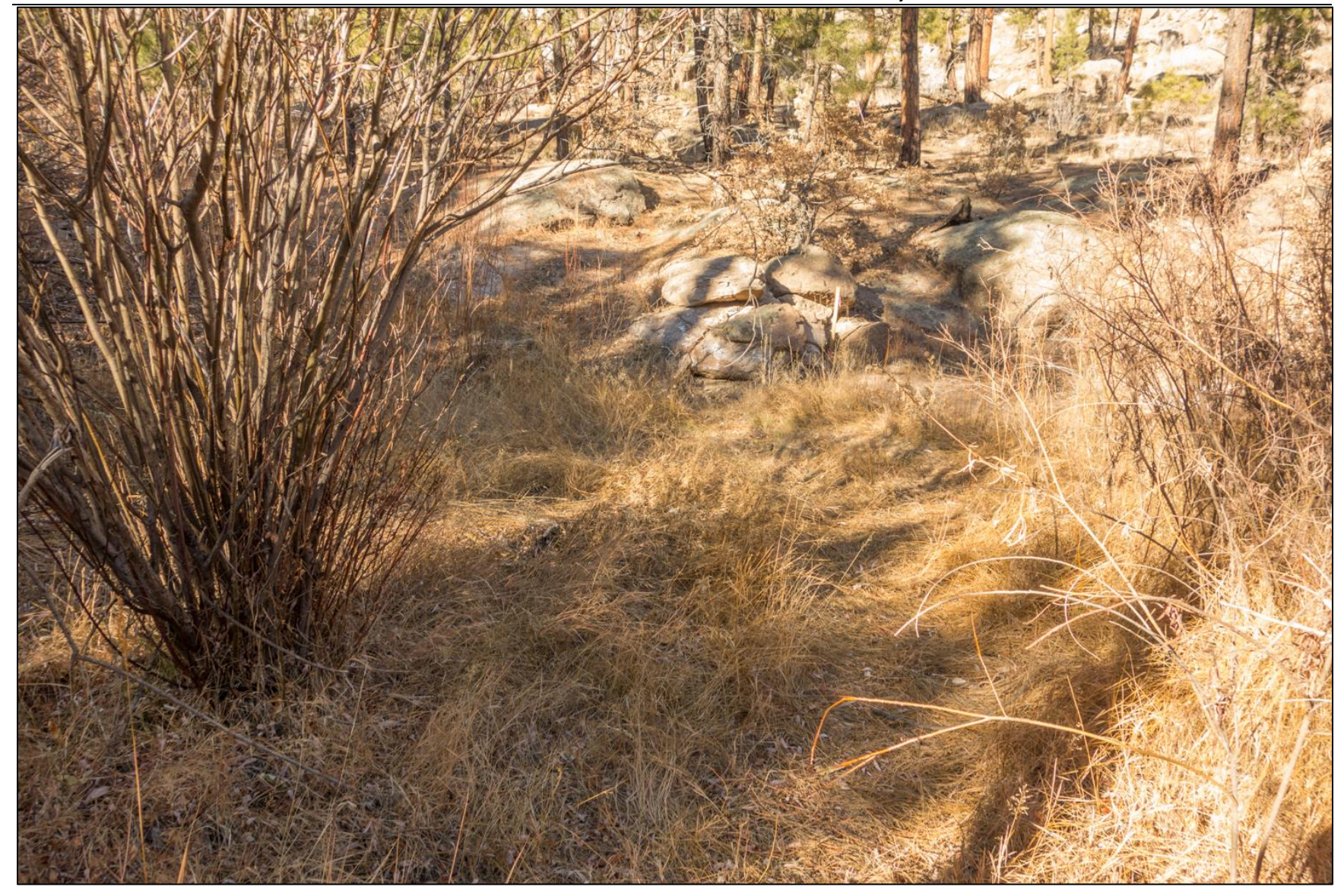
Photograph 3. Location of the gabion grade control structure facing north across the channel in the wetland.