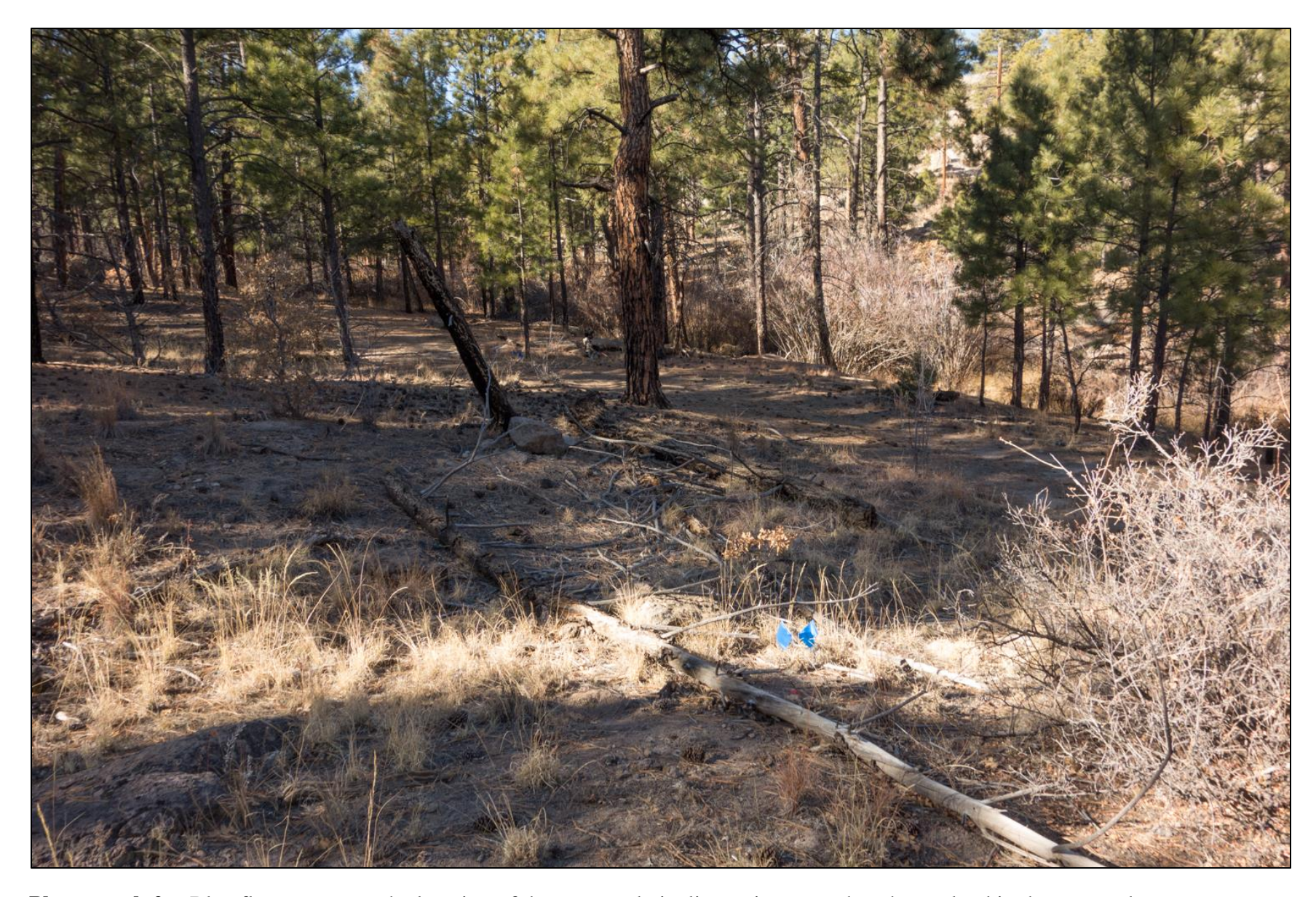
Photograph 2. Blue flags represent the location of the proposed pipeline as it approaches the wetland in the canyon bottom.