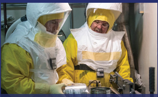
SRS personnel safely package downblended plutonium for shipment out of South Carolina