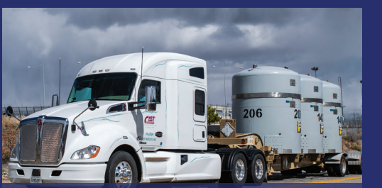
LANL resumed transuranic waste shipments to the Waste Isolation Pilot Plant