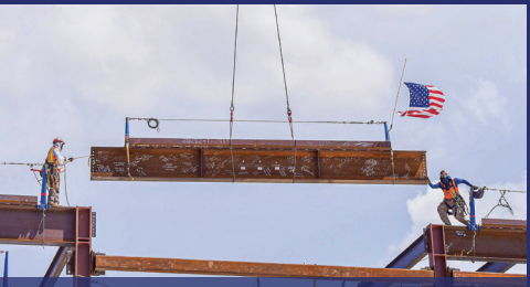
Highest and last piece of structural steel placed at Albuquerque Complex