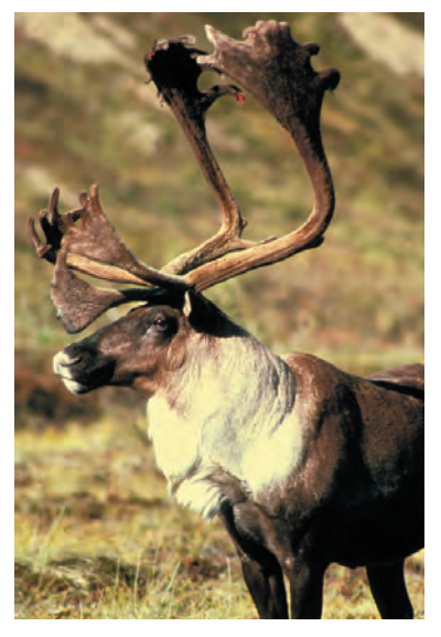
Public involvement in the NEPA process identified impacts to the caribou, a subsistence resource, as a significant environmental concern.

BLM also stated in the notice that its decision to discontinue its planning activities and EIS was also based on the limited resources and impracticality of energy development. BLM's resource assessments indicate that oil reserves are limited in