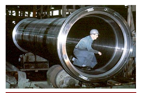
Figure 3: Typical Thick-Walled Pressure Vessel

Advantages: The HLAW technique has many potential advantages over standard arc welding. It is up to ten (10) times faster than conventional welding and produces a deep, narrow weld that requires fewer passes than arc welding, in which a large "V" at the joint is filled with multiple weld passes. The HLAW weld uses less filler metal, shielding gas and energy. The substantially reduced Heat Affected Zone (HAZ) provides the benefit of less residual weld stress. Reduced residual weld stress reduces susceptibility to SCC, which is a major concern in the nuclear industry.