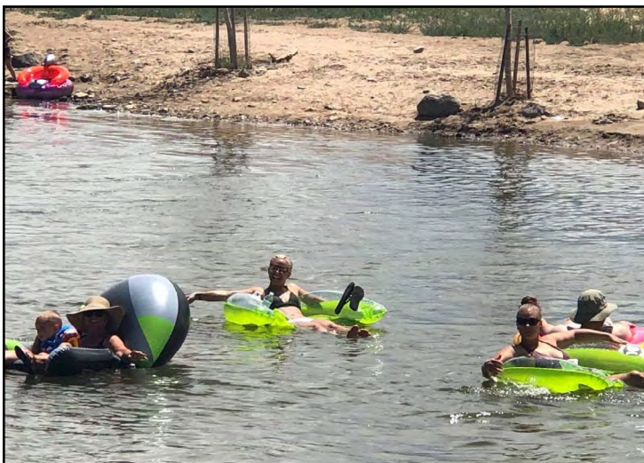
People enjoy water features created at the River Park at Las Colonias, location of the former Grand Junction, Colorado, Processing Site.

LM's conservation reuse includes activities supporting natural resource protection, habitat development and enhancement, and wildlife management options at LM sites. Conservation reuse includes areas where a proactive measure has been