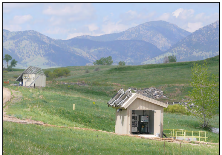
When the East Trenches Plume Treatment System was turned on in 2016, it was the only known solar powered commercial air stripper in use in the United States at the Rocky Flats Site in Colorado.