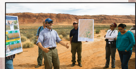
Monument Valley, Arizona, Public Meeting