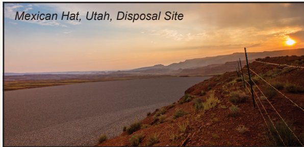
Mexican Hat, Utah, Disposal Site

The Mexican Hat disposal cell contains mill tailings and other low-level radioactive materials from both the former Mexican Hat, Utah, and the Monument Valley, Arizona, processing facilities. LM personnel conduct annual site inspections to evaluate surface-feature conditions, perform site maintenance as necessary, and visually monitor groundwater seeps along arroyos near the site. LM is actively monitoring the disposal cell to ensure that it remains protective of human health and the environment.