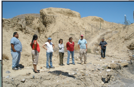
Shiprock, New Mexico, Disposal Site Tour

Remedial action at the Shiprock site consists of natural flushing with active groundwater cleanup in the floodplain. For the Terrace East areas, the remedial action is an active pump-and-evaporation system. Since completing construction on the major component of this system, more than 190 million gallons of contaminated water has been treated. Groundwater contaminants include uranium, nitrate, and other metals.