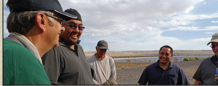
Tuba City, Arizona, Site Tour