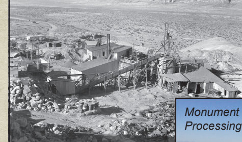
Monument Valley Mill