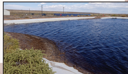
Tuba City, Arizona, Disposal Site Evaporation Pond

As of May 2018 more than 415 million gallons of groundwater have been pumped.