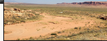
Monument Valley, Arizona, Processing Site